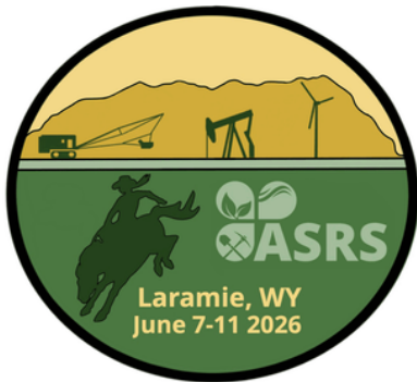
Exhibit and Sponsor Application