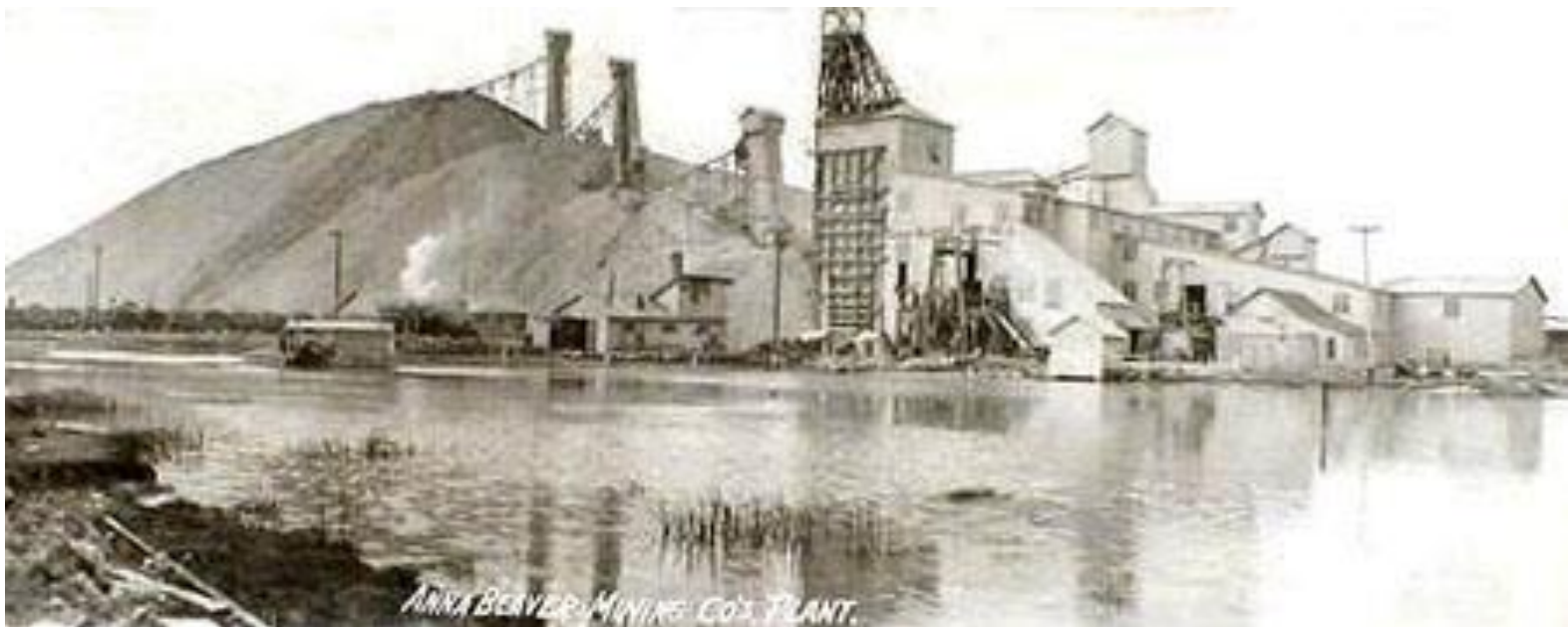
ANNA BEAVER MINING CO'S PLANT.