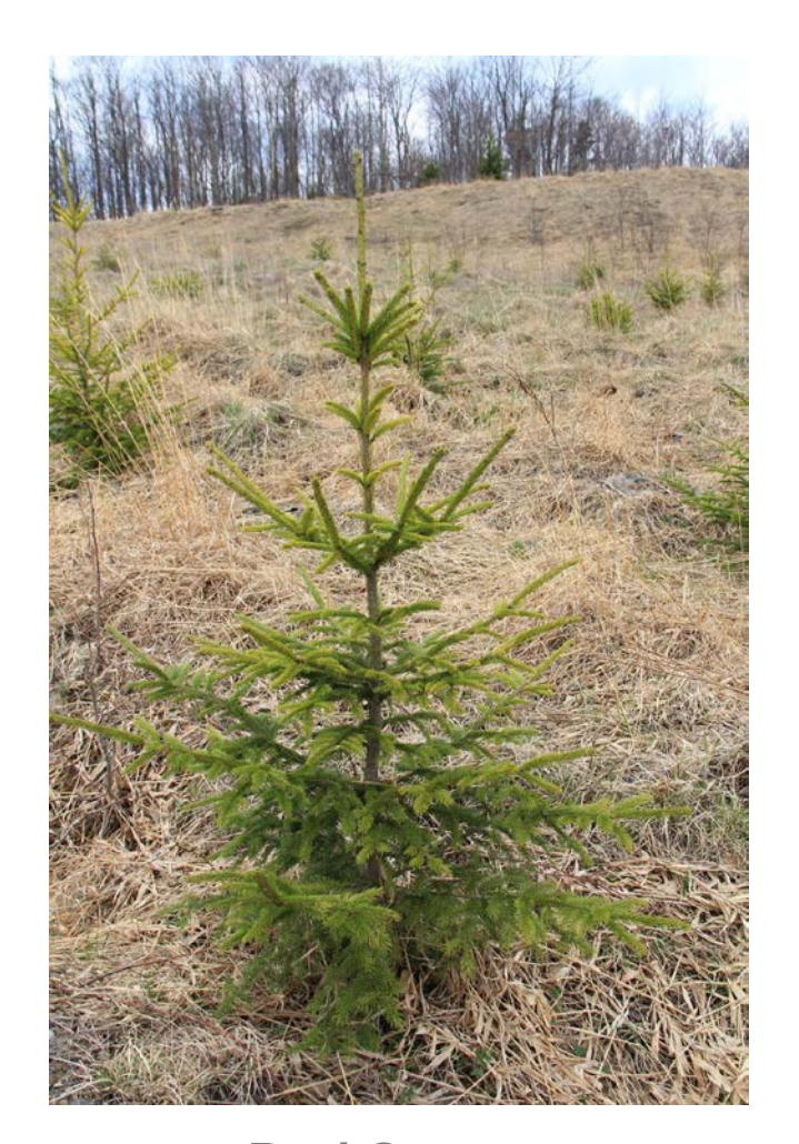
Red Spruce (Picea rubens)