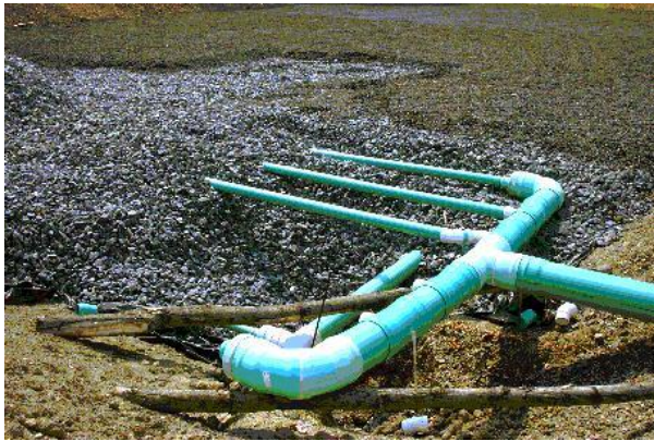
Figure 2: Johnson Run VFP During Installation

To alleviate this problem, pipe saddles can be used to connect header pipes with pipe laterals. Fig. 3 shows this method of connection. These saddles are installed directly to the header pipe and do not require that the header pipes be pieced together at every lateral. Saddles can be installed at any location along the header pipe except where two joints of pipe meet. To maintain the velocity assumptions of the flushing system, the holes cut into the header pipe over which the saddles are installed must be the same diameter of the lateral pipes.