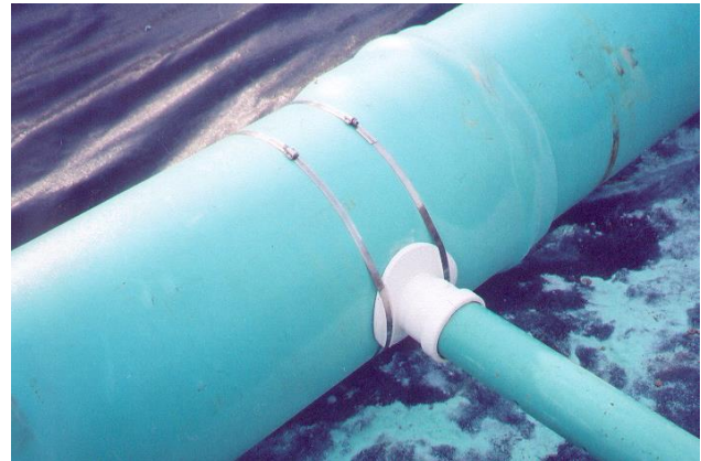
Figure 3: Pipe Saddle Connection Between Lateral Pipe and Header Pipe

Another design consideration that greatly impacts construction is the placement of the flush and underdrain plumbing in limestone. If heavy equipment passes over pipes that are not buried several feet in limestone, the pipes can be crushed. Since the Johnson Run design called for flush pipes one foot from the top of the limestone, equipment could not pass over the surface of the VFP once the flush plumbing has been placed. The construction contractor therefore chose to place all the limestone first and then excavate trenches for each lateral. An excavator was then used to place and distribute the compost (See Fig. 3). The equipment retreated in this manner across the VFP until all materials had been installed. If it becomes necessary to enter the VFP with equipment to perform maintenance or to remove or add more compost, low ground-pressure equipment is recommended in order to protect the plumbing.