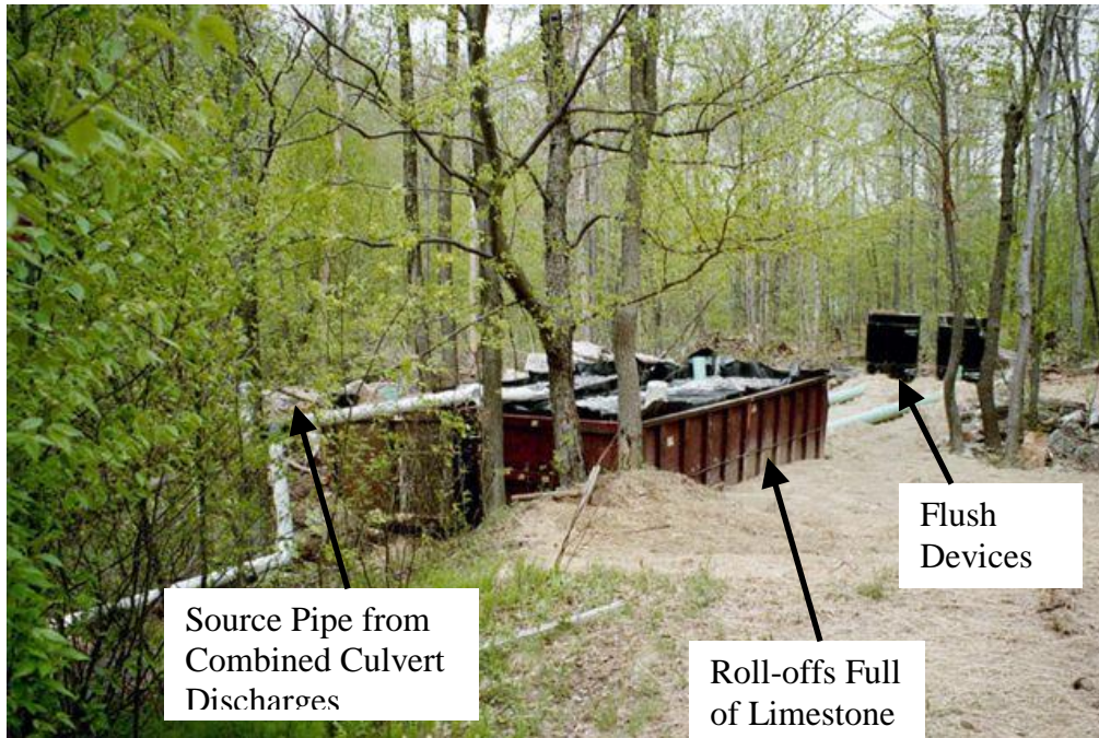
Figure 5: Jonathan Run Pilot Scale Treatment Systems

The systems were installed so that the influent flow rate, and thus the flush cycle time, could be controlled. The average retention time of the systems is half of the flush cycle, since some of the water is retained for the entire time, but the last water that enters the container is almost immediately flushed out. Table 1 shows sampling results for both containers at Jonathan Run. The average influent chemistry, which was fairly consistent, is shown. The influent contained less than 1 mg/L of iron.