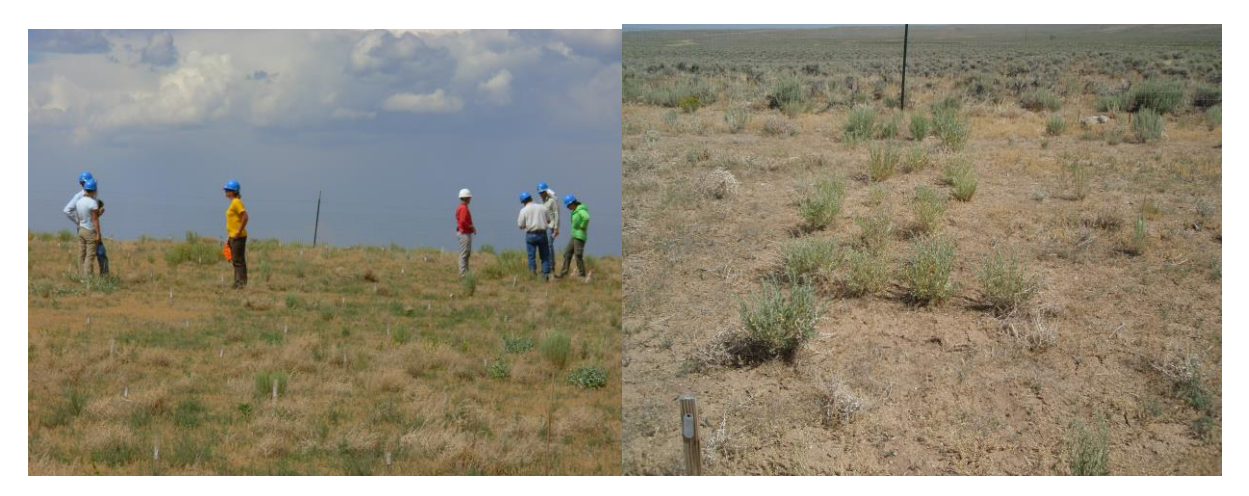
Figure 8. Shrub replicated plot establishment, July 2008.