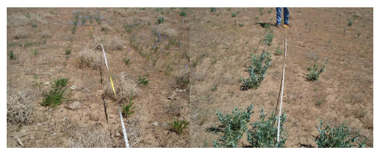
Figure 7. Forb replicated plot establishment, June 2008.

evening primrose were not present on site. Forb heights differed among accessions ( p \le 0.05 ), but were less variable over time than densities. The forbs with better establishment were not always the tallest, due to their inherent growth form.