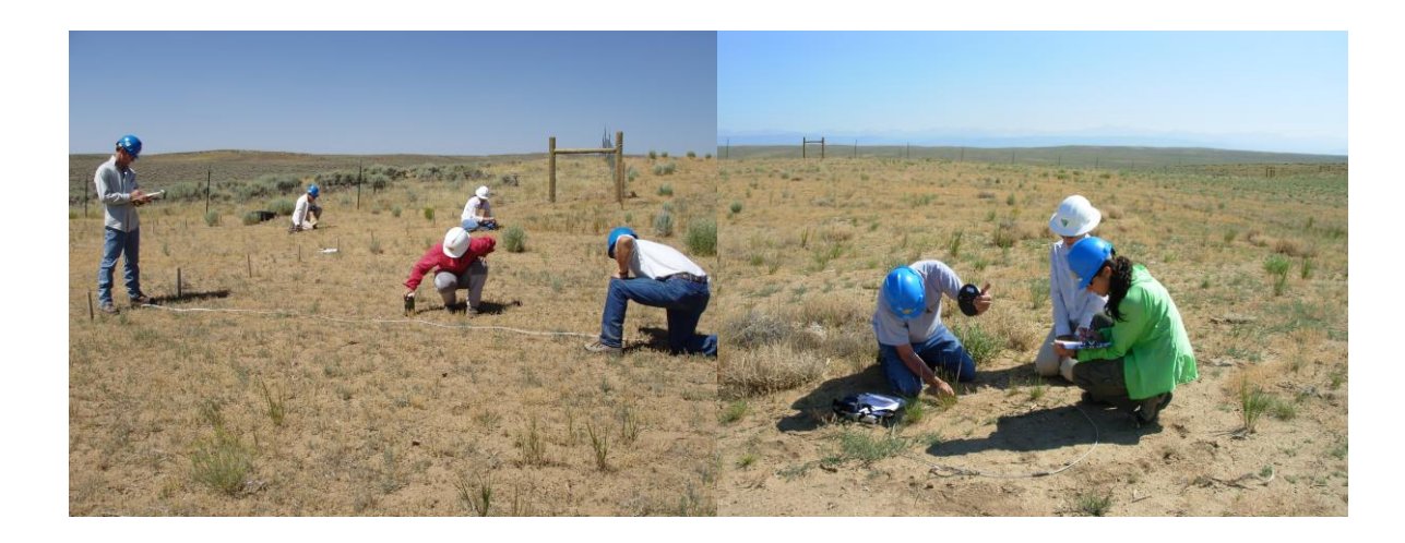
Figure 4. Plot evaluations, July 2008.

<u>Mixture Plots</u>. In 2006, plants of individual species in the broadcast- and hydroseeded treatments were counted in 20, 0.18 \text{ m}^2 plots. In the drill-seeded treatment, plants were counted in twenty, 0.22 \text{ m}^2 plots. In 2007 and 2008, plants of individual species were counted in 10 plots, each 0.89 \text{ m}^2 . Relative plant vigor and plant height in centimeters were assessed across an entire treatment area. The hydroseeded treatment was inspected for signs of improved plant establishment.