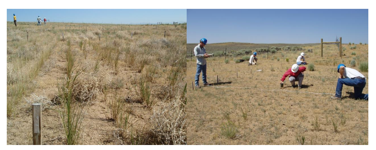
Figure 5. Grass replicated plot establishment, July 2008.

from 2006-2007 in all accessions except Rimrock Indian ricegrass. Eighteen grasses increased densities from 2007 to 2008 (Fig. 5). Over a 3-year period, L-46 basin wildrye remained the top performer, but had also declined in density along with 23 other entries. The most noticeable change was an increase in the slower-to-establish entries of bluegrass, Junegrass, and ricegrass. Considering a target of 66 plants per row-meter (USDA, 2007 a ), the plant densities of the top five species averaged 45 plants per row-meter. Mean biomass values were greatest ( p \le 0.05 ) in L-46 basin wildrye, but not significantly greater than six other accessions of Leymus cinereus , Elymus lanceolatus, Elymus elymoides , or Pseudoroegneria spicata (Table 3). Heights of the grasses differed among accessions ( p \le 0.05 ) but were less variable over time than density (Table 3). The grasses with the better establishment were not always the tallest, due to their inherent growth forms. The long-term drought, where precipitation is approximately 25% below normal (Fig. 6), continued to negatively impact plant growth and development.