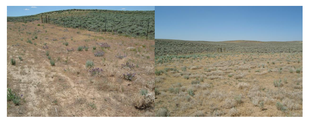
Figure 10. Broadcast treatment: Bridger mix (left) and Shell mix (right), July 2008.