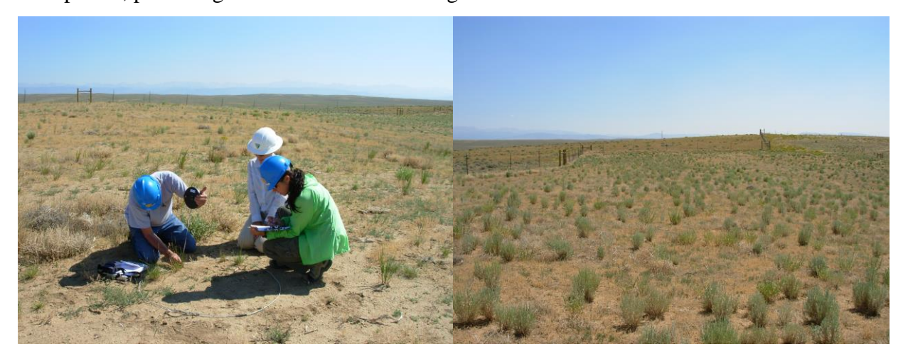
Figure 9. Drill treatment: Bridger mix (left) and Shell mix (right), July 2008.

(70%), Wyoming big sagebrush (50%), Rimrock Indian ricegrass (30%), Sandberg bluegrass and winterfat (20%), and Rydberg's penstemon (10%). In 2008, 40% of species in the seeding mixture were present. Winterfat were present outside the sampled plots at a very low estimate of percentage basal cover. The remaining 50% of the species in the mixture not established included fringed sagewort, yarrow, scarlet globemallow, silvery lupine, and Rydberg's penstemon. Plant densities were greatest in Wyoming big sagebrush, fourwing saltbush, and Rimrock Indian ricegrass. The total number of plants in the treatment increased 16% from the previous year to approximately 4 plants/m<sup>2</sup>. Over a 3-year period, there were 40% fewer plants/ha in the sample area and percentage richness was 50% grass and 50% shrubs. Percentage frequencies of occurrence in the test plots were Wyoming big sagebrush (80%), fourwing saltbush (50%), Rimrock Indian ricegrass (40%), and Sandberg bluegrass (10%). Over the same time period, plant heights increased to an average of 16 cm.