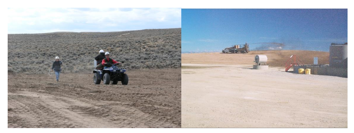
Figure 3. Seeding broadcast (left) and hydro-mulch plots (right), October 2005.

Following planting of the broadcast-seeded plots, the area was roughened with a wooden pallet pulled behind the ATV (Fig. 3). In addition, the Shell mixture was hydroseeded to a 0.4-ha plot on a smooth slope in a one-step mulch application.