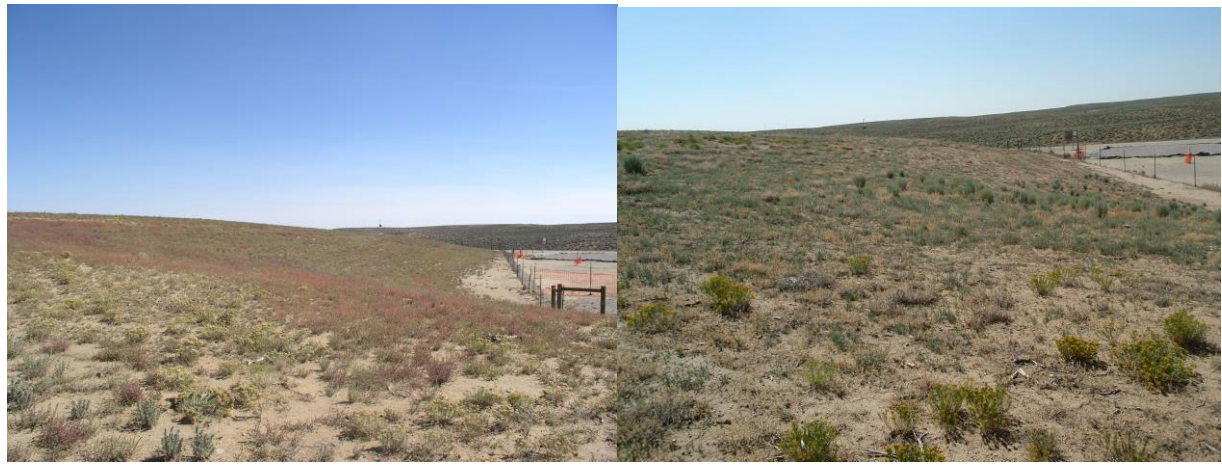
Figure 11. Hydroseed treatment: October 2007 (left) and July 2008.

a two-step approach is preferred where 1) the seed is separately mixed in a trace amount of mulch and applied directly to a roughened soil surface, followed by 2) a second application of mulch to reduce soil erosion and enhance micro-climate conditions necessary for germination and establishment (Holzworth, 2007). The natural terrain of the site is rolling and the percentage slope mostly ranged from less than 1 to 8, with up to 12% slope in portions of the hydroseeded treatment. In the steeper gradients, plots were tracked with minor rills where water moved downhill. Minor soil movement due to wind erosion was evident in small accumulations adjacent to the fence and in low lying areas.