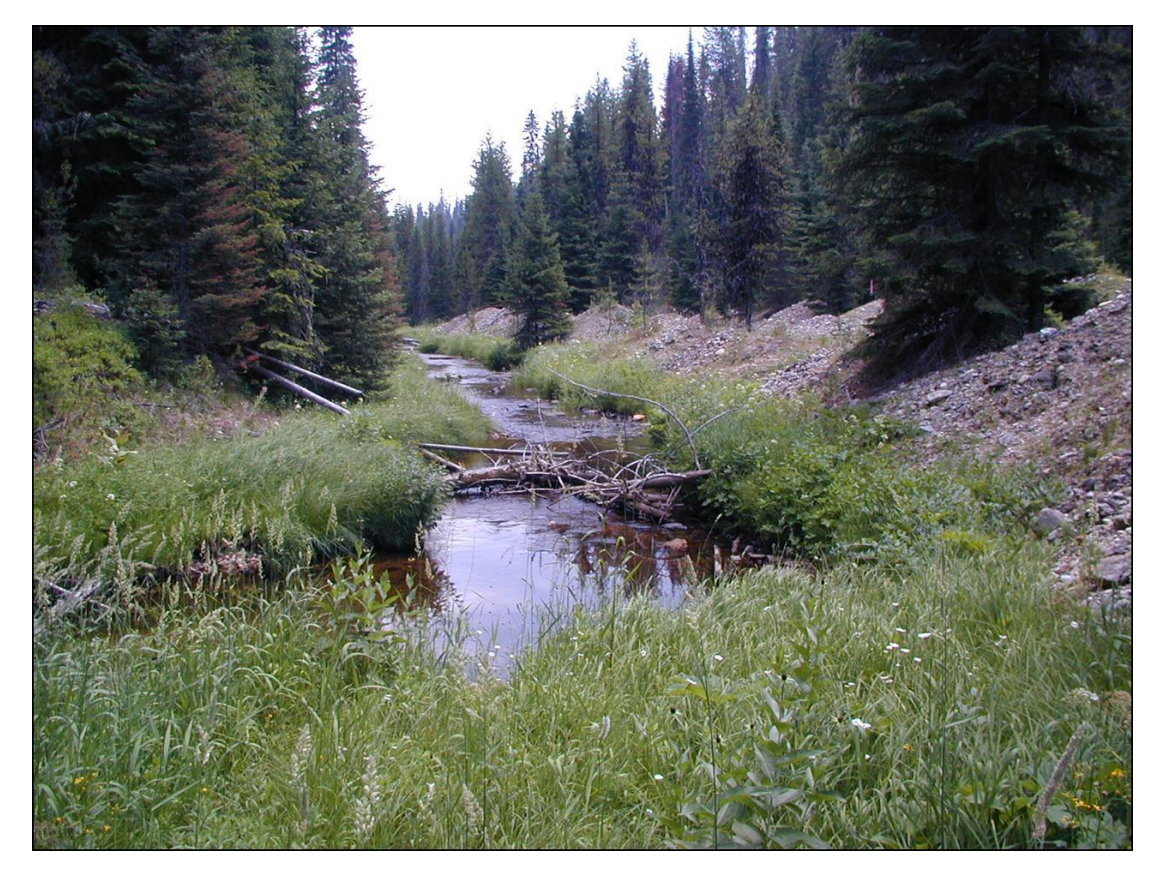
Figure 3. Newsome Creek mine tailings

Historical dredge mining operations have drastically altered the valley by fractionalizing and isolating much of the floodplain and riparian zone, dramatically altering channel morphology (see Fig. 3). Stream sinuosity has been significantly reduced, homogenizing many sections into long, channelized riffles. In addition aquatic habitat conditions including the size and frequency of pools, large woody debris presence/recruitment, and bank stability have been degraded. Activities to promote pool formation, sediment sorting, and grade control have been implemented by the NPNF and the NPT with some success, although the major morphologic and riparian changes caused by dredge mining persist (CCH, 2004).