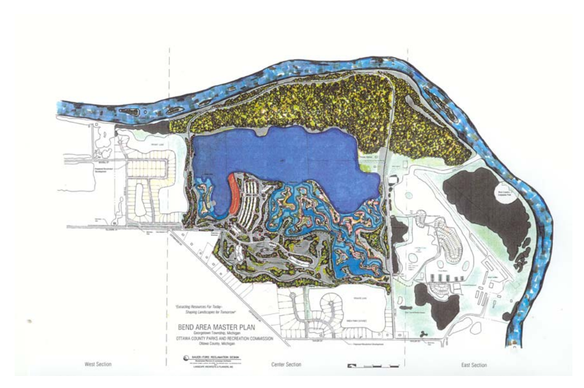
Figure 3. Master Plan for study area.

Because the goal of this project is to provide land owners with optimal value for their post mine properties, the Master Plan provides a combination of proposed housing, commercial, and park development. It is the intention that each will enhance the value of the entire project site.