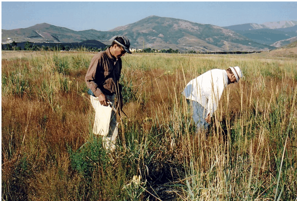
Figure 4. Vegetation growing near Anaconda Dragstrip in 2002 - nine growing seasons.

Vegetation on this large research plot continues to perform well with no treatment since final seeding and planting in 1994. Ground cover of desirable grasses was approximately 28%. Of seeded species, Basin wildrye and Intermediate wheatgrass have declined in cover and production as the site has been invaded by Redtop (probably Agrostis alba ) but all three species were producing large amounts of seed (Figure 4). The Agrostis was a dominant species on surrounding lands both amended and untreated where moisture was not limiting its survival. Like White top and Canadian thistle on Site 1, it continues to pose a problem to plant community development because of very large seed producing populations adjacent to the amended soils. Unlike these noxious weeds, Redtop is a good forage grass and readily consumed by livestock. The other wheatgrasses (Western and Crested) seeded on this site have almost disappeared from the plant community.