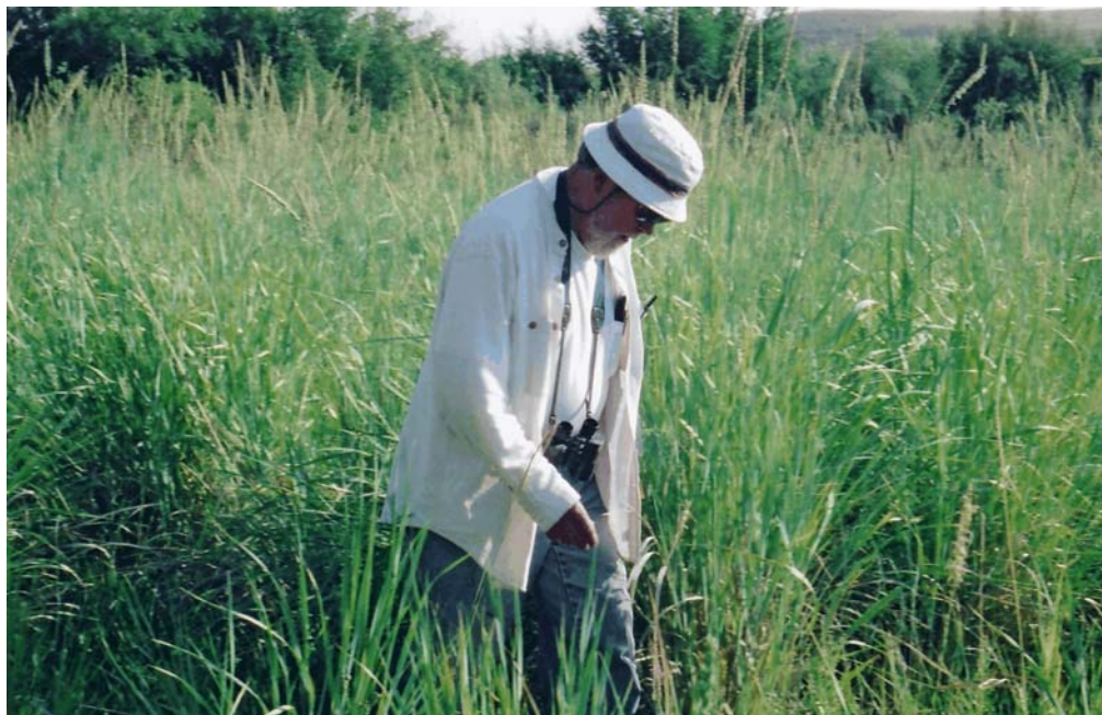
Figure 5. Vegetation growing within the Governor's Demonstration, Clark Fork River in 2002 - twelve growing seasons.

wildryes (Basin and Russian), an invading Poa (probably secunda ), and the very common Redtop were identified within the sampling frames. Three other grass or grass-like species were observed adjacent to the transect. These included Tufted hairgrass, Nebraska sedge, Smooth brome, and Baltic rush.