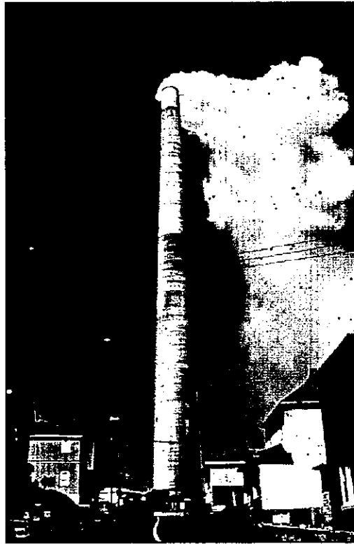
Figure 5. A view of Sudbury, Ontario.

score of 61.9. The fourth scene (Figure 4) is a roadside landscape from northern New Mexico, containing many flowers. The score for this image is 40.33. This image is significantly different from the neutral scene and the floodplain scene. Finally, figure 5 is an image from Sudbury, Ontario, and scores 102.73. This image is significantly different than all the other images (Figure 6). By examining these slides through the visual/environmental quality model it is apparent that various images can be separated into categories of scenic/environmental quality. This approach has some merit for assessing surface mine landscapes and in the planning and design stages for a surface mine.