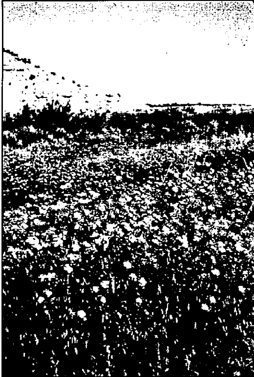
Figure 4. Wildflowers along a New Mexico roadside. activities as well as other disturbances.