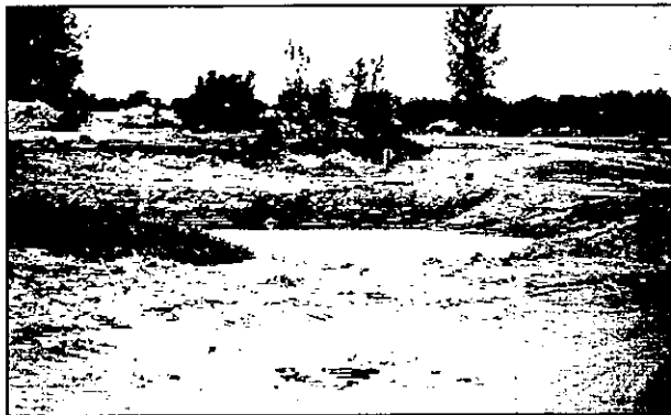
Figure 2. A multiple family housing construction site in Minnesota.