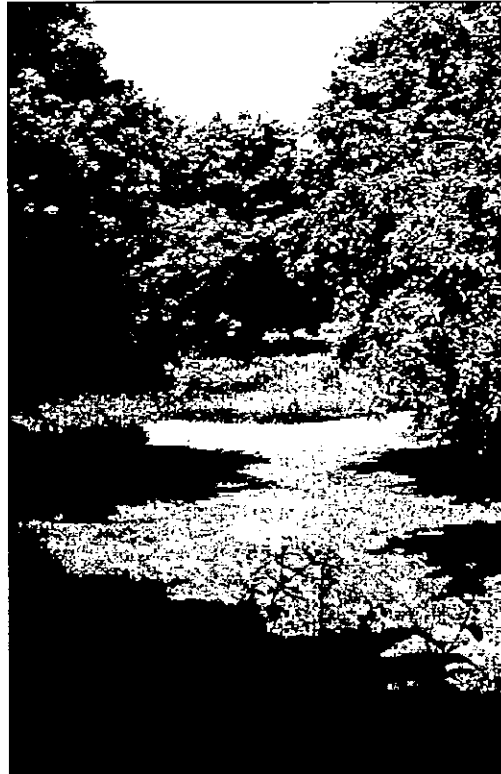
Figure 3. An image from the floodplain on the Red River Valley of the North.

To understand the implications of the model, it is helpful to examine photographs and their visual quality scores. I have chosen five images from the original 250 image study. The original study contained images of surface mine activities and industrial