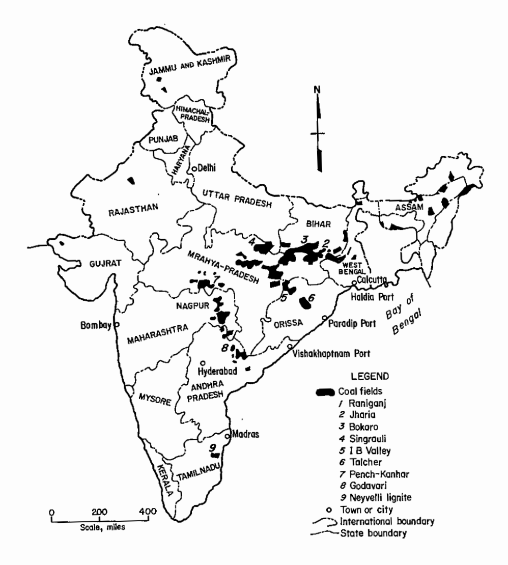
Figure 1.--Major coalfields of India.