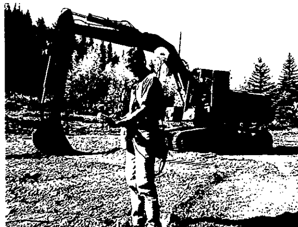
Figure 3. Author performing construction control stakeout at Coal Basin facilities area

GPS waypoints were selected from the design map coordinates to allow for the trace of the inner and outer channel banklines to be transferred from the paper map to the ground. The waypoints were exported from Earthvision as an ASCII data file into the Pathfinder Office software waypoint manager module, where each waypoint could be assigned an identifying number. The resulting waypoint file was then uploaded into the GPS datalogger. The GPS operator then navigated to each of the stakeout waypoints and directed placement of stakes marking the inner and outer channel configuration on the site (Figure 3).