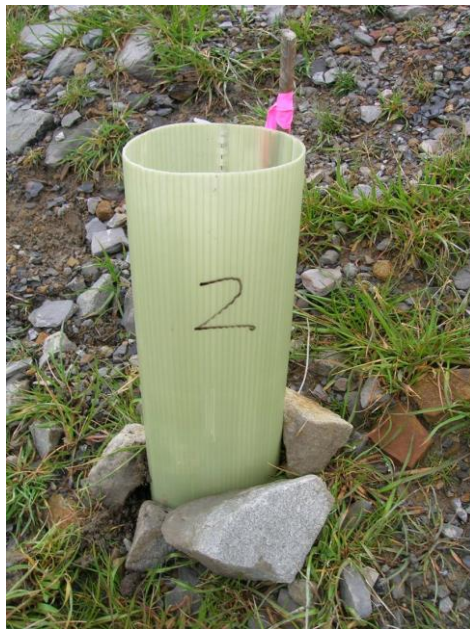
Figure 2. Photo of chestnut planting method taken in March of 2008. “Zip ties” inserted through small holes in the tree tube moored the tree tube firmly to the rebar stake.

compaction and then left in an unmanaged state until this planting. On each of the 4 sites, half of the trees were planted as nuts, using methods described for the 2008 chestnut planting; and the other half were planted as one year-old bare root seedlings without any tube shelters or staking. The bare root seedlings were grown in a nursery by the American Chestnut Foundation. Within each block, each row was planted with a single breeding generation; and the direct seeded nuts were alternated with the bare-root seedlings within each row. Survival, tree height to the highest live bud, and stem diameter at ground level, for the bare-root seedlings only, were measured in late October – early November of the first growing season.