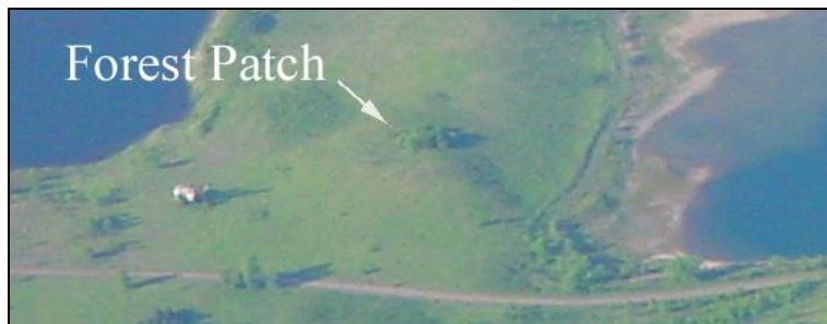
Figure 2. Location of the forest patch on a mound of sand above the 100 year floodplain. The lakes typically are at the elevation of the Mississippi River.

Besides reducing mortality and being able to expand across the landscape, we also thought that the forest patch had another advantage over traditional planting approaches. We thought that the patch was highly visible as a clump of vegetation right from initial establishment, whereas in many cases traditional planting approaches, installed vegetation is almost invisible across an expansive herbaceous post-mining landscape (Fig. 2).