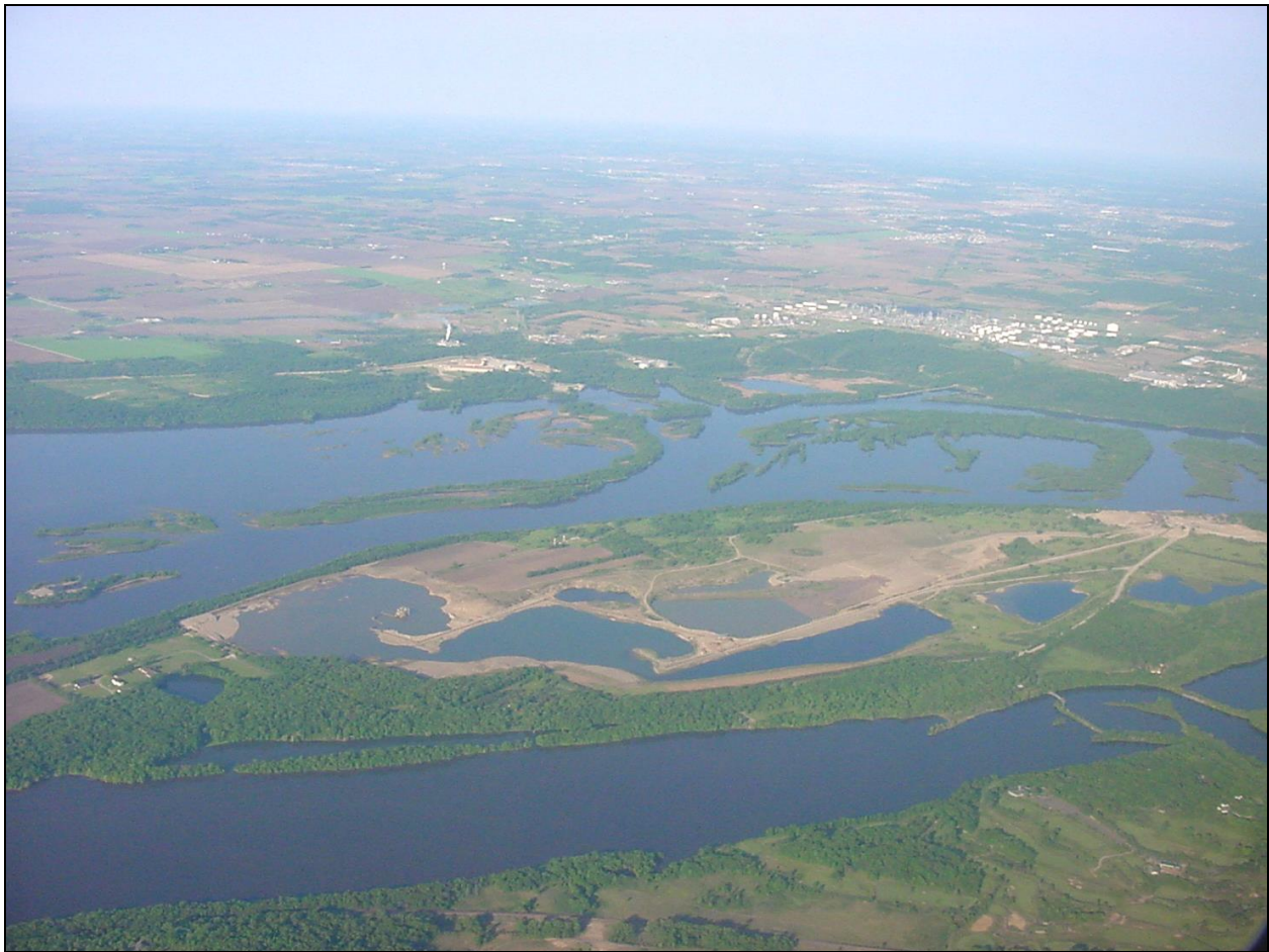
Figure 1. Lower Grey Cloud Island, Minnesota along the Mississippi River, looking southwest in the spring of 2003.

In 1998, we described a circular forest patch that we had established in 1983 on the Lower Grey Cloud Island, southeast of the Twin Cities (Minneapolis and St. Paul, Minnesota) (Burley et al. 1998). The forest patch has been installed on a large xeric mound of excess sand, one of many mounds created to provide suitable post-mining building sites above the 100 year floodplain of the Mississippi, River (Fig. 1). The surface mine is still in operation and supplies sand and gravel for road mixtures and concrete. The mine has been extensively studied (Sanders and Associates 1981) and is expected to complete mining operations in about 20 years (Sanders, Burley, and Churchward 1982). As mining operations continue, our study reports upon the developments within this forest patch since that initial 10 year report and publication.