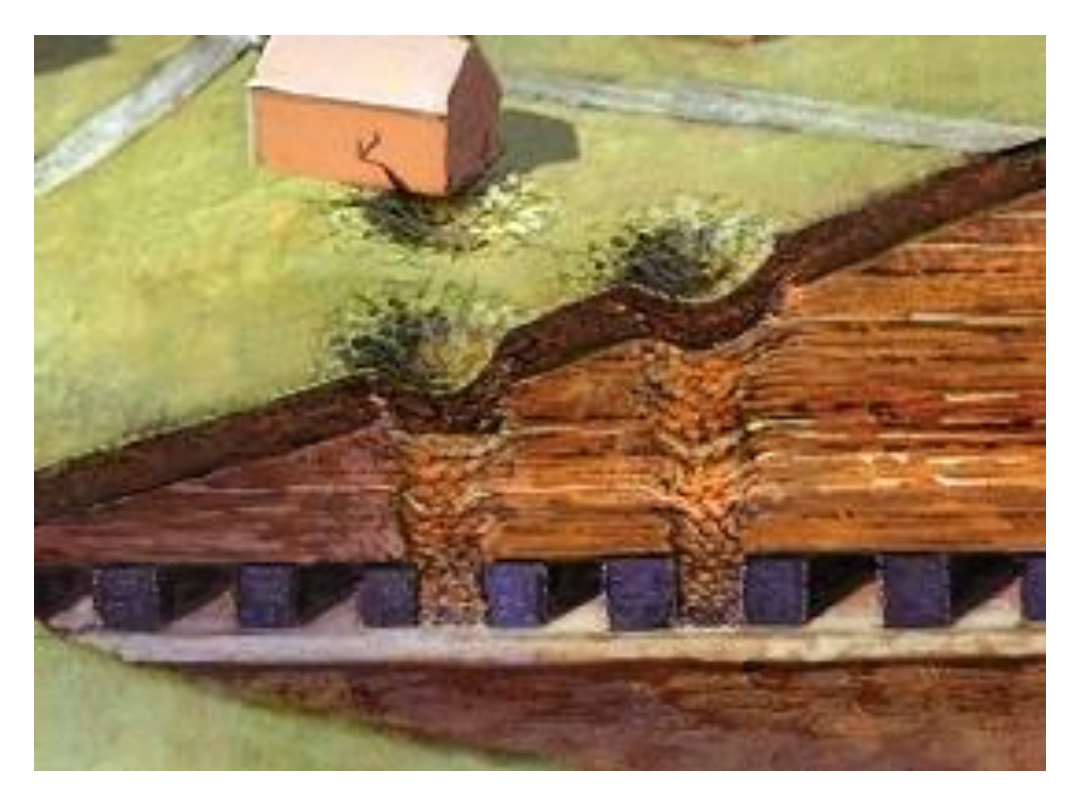
Figure 4 Sinkhole subsidence (excerpt from www.pamsi.org poster).