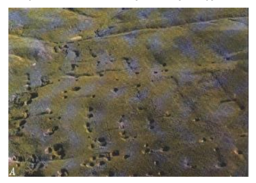
Figure 5 Sean Carroll subsidence field, WY.