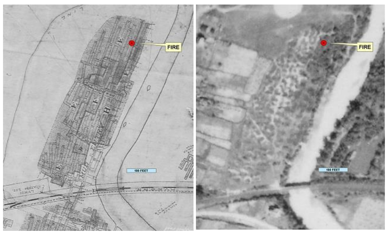
Figure 1 1914 Mine map.

In 2006, background work on a Pittsburgh coal mine fire required georeferencing a 1914 map of the Lynn Station Mine (Fig. 1) to a 1938 aerial photograph (Fig. 2). During the process, a striking geometric light/dark pattern in the photo was observed to clearly coincide with old workings in the affected section of the mine.