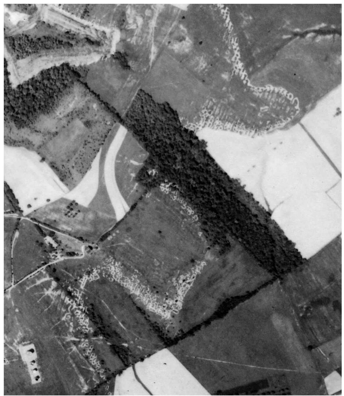
Figure 7 Shallow subsidence patterns near Delmont, PA (north to top).

Pattern variations in this photograph illustrate a wide range of shallow subsidence features. The spots on the photograph are evidence of subsidence that appear as: (1) sinkholes in the southwest and center, (2) probable egg-crate patterns, and (3) subtle linear troughs in the northeast center inside the cropline. Light colors adjacent the spots may be bare soil but are more likely water-stressed vegetation. The band's width varies with slope, narrow on steep slopes and wider on gentler slopes. Finally, the band is completely hidden by the canopy of the woodlot near the center.