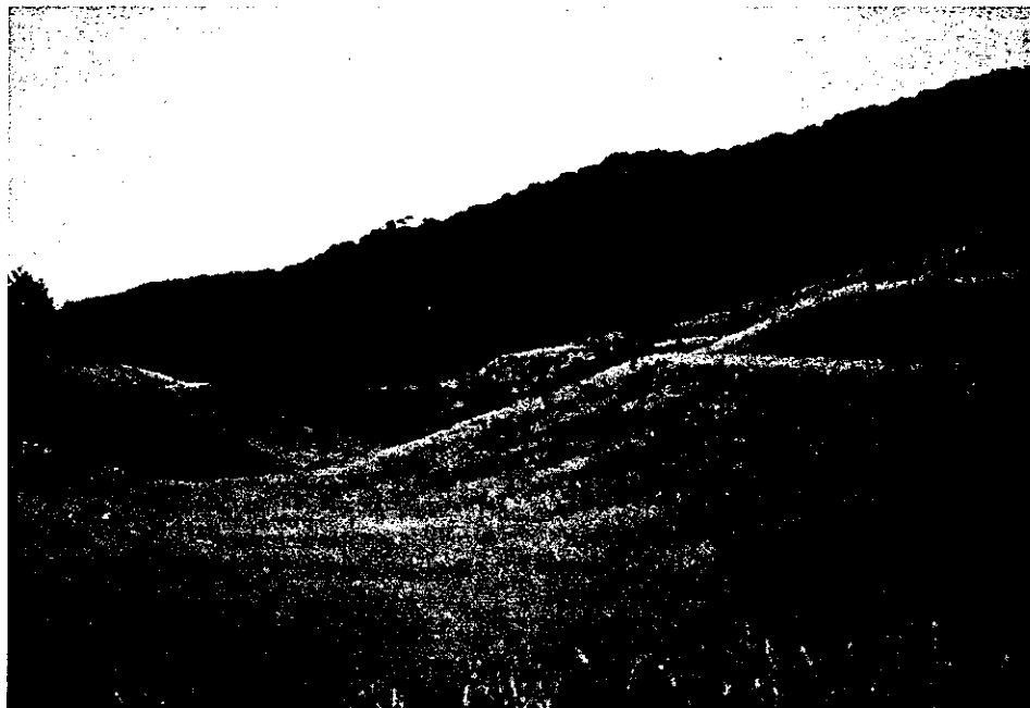
B. After cooperative USFS and TVA reclamation of the Georges Branch mine in Smyth County, Virginia, July 1987.