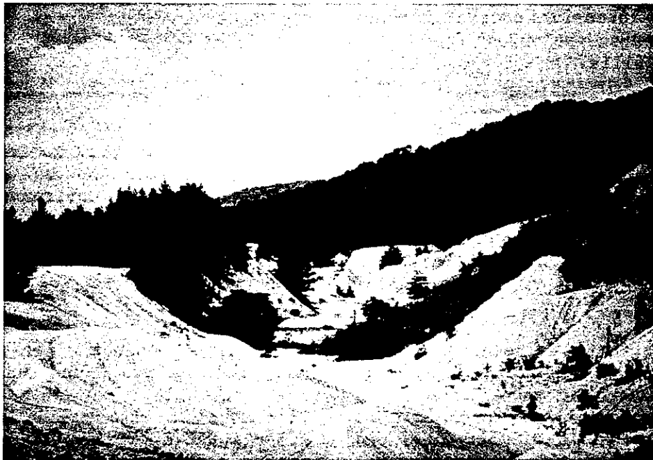
A. Before reclamation of the Georges Branch mine in Smyth County, Virginia, June 1985.