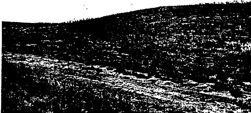
Figure 1.--Hillslope RNMW. Seeded after initiation of research project.