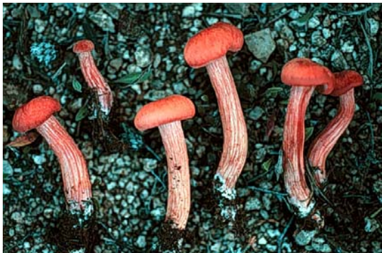
Fig. 2. Mycorrhizal fungus Laccaria proxima sporocarps from a smelter-impacted area near Butte, MT.