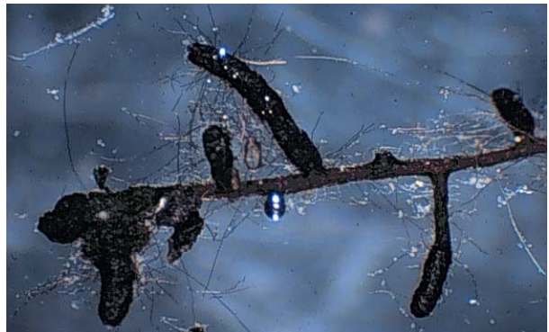
Fig. 3. Mycorrhizae comprised of fungus Cenococcum geophilum and aspen roots from the Anaconda Superfund site.

Other fungi associated with young roots, include Scleroderma cepa , Thelephora terrestris , and Cenococcum geophilum (Fig. 3) which produces no fruiting bodies.