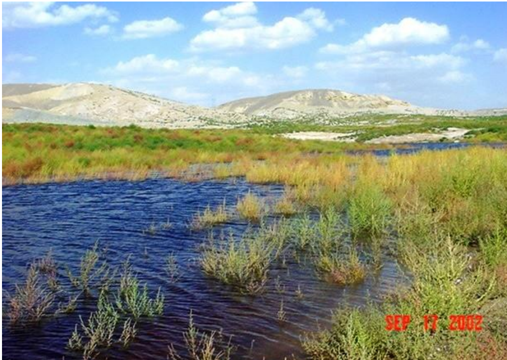
Figure 1. 17 Sept 2002, Cottonwood reclamation west storm surge basin as Inspector Robert Russell saw it. The un-vegetated portions of the two steep hills in the background are GeoFluv reclamation also and needed no erosion repair after the series of intense storms during the second week of September.

point of reference, a 50-yr, 3-hr storm at the site is about 49.5 mm (1.95 in). All the designed ephemeral channels flowed that day.