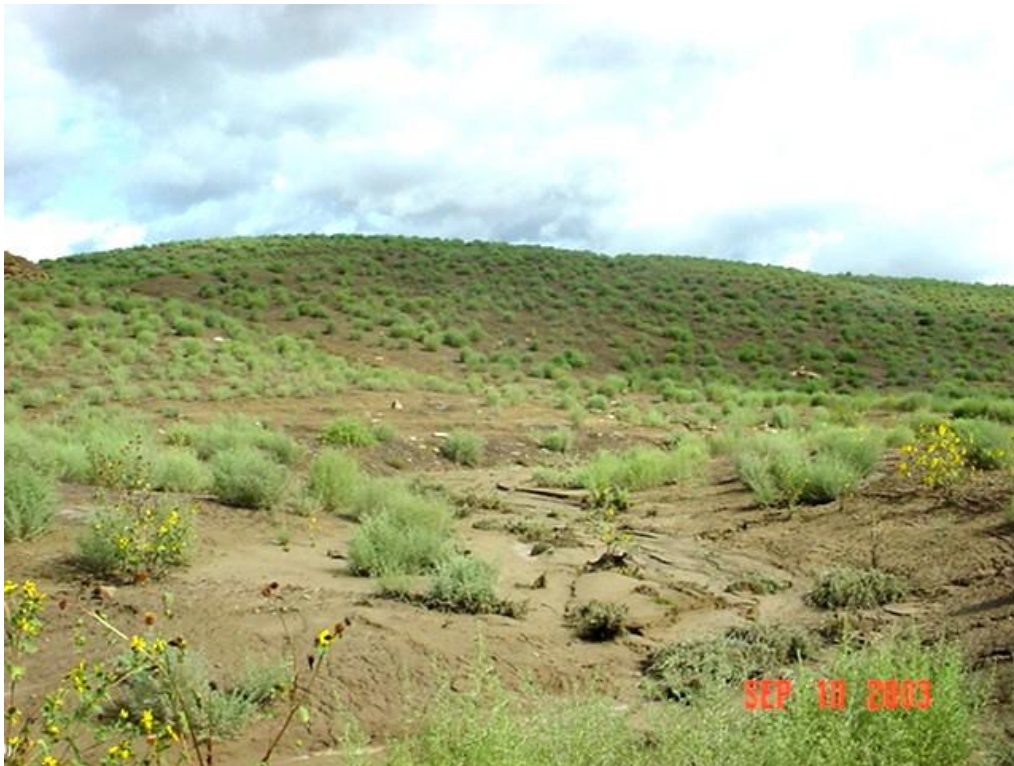
Figure 9. 10 September 2003, South McDermott valley bottom channel, reach 7 to 8