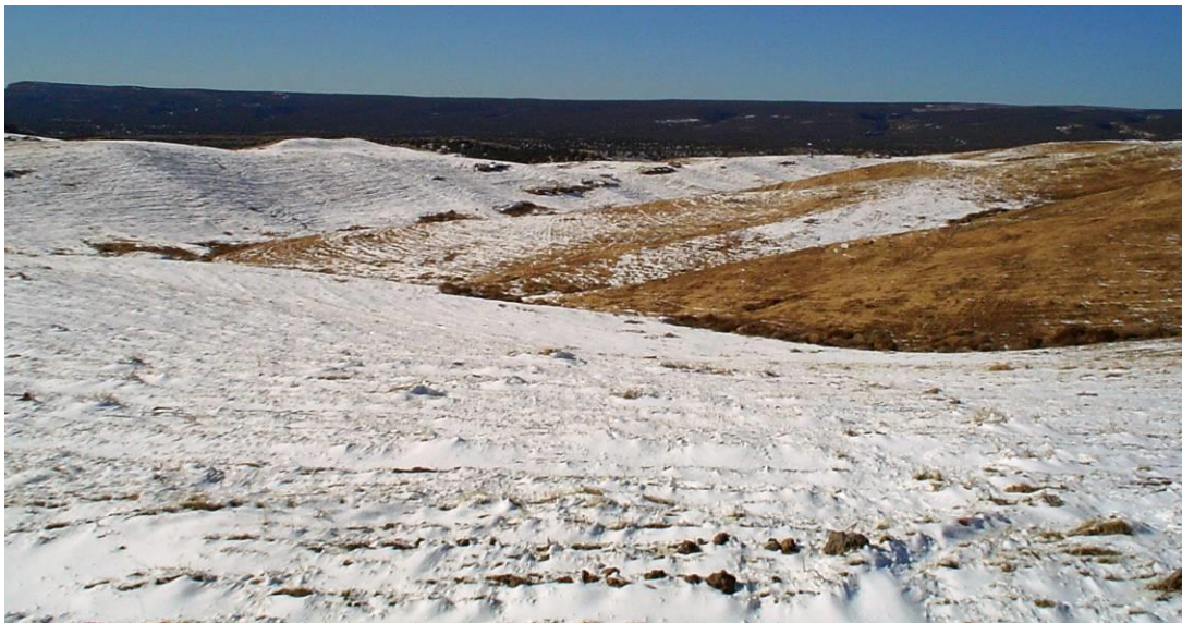
Figure 10. December 2005, Northgate Arroyo headwaters showing variation in moisture harvesting from slope aspect diversity in fluvial geomorphic-designed landform.

Conversely, the variation in moisture harvest resulting from the dissected topography will likely play a larger role in creating community diversity. The image in Fig. 10 below was taken in December 2005 and shows the variation in moisture harvesting that results from the complex fluvial geomorphic slope design. The north-facing slope at the left of the image is maximizing moisture harvesting because it is not exposed to the sun's energy all day. The south-facing slope across the valley has less snow cover overall, but the GeoFluv design has broken the slope into smaller subwatersheds that contain east and west aspects. The reclamation landform provides variation in water content and sunlight to naturally create niches for different plant species that will promote vegetation diversity.