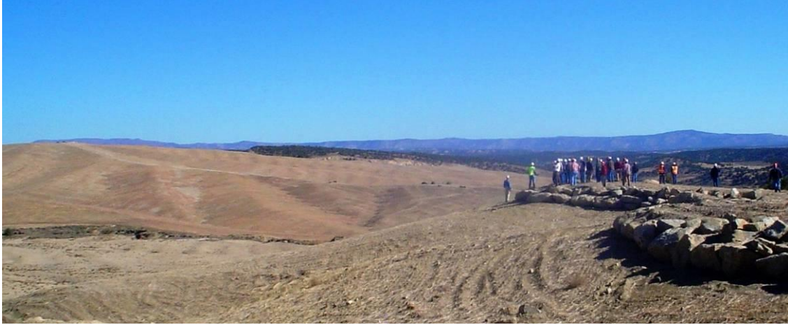
Figure 6. A fluvial geomorphic reclamation area at La Plata Mine that has been topsoiled; all the landform in the fore-ground and mid-ground without tree cover is graded and topsoiled reclamation. Image captured during 28 October 2008 National Association of Abandoned Mine Land Programs national conference tour.