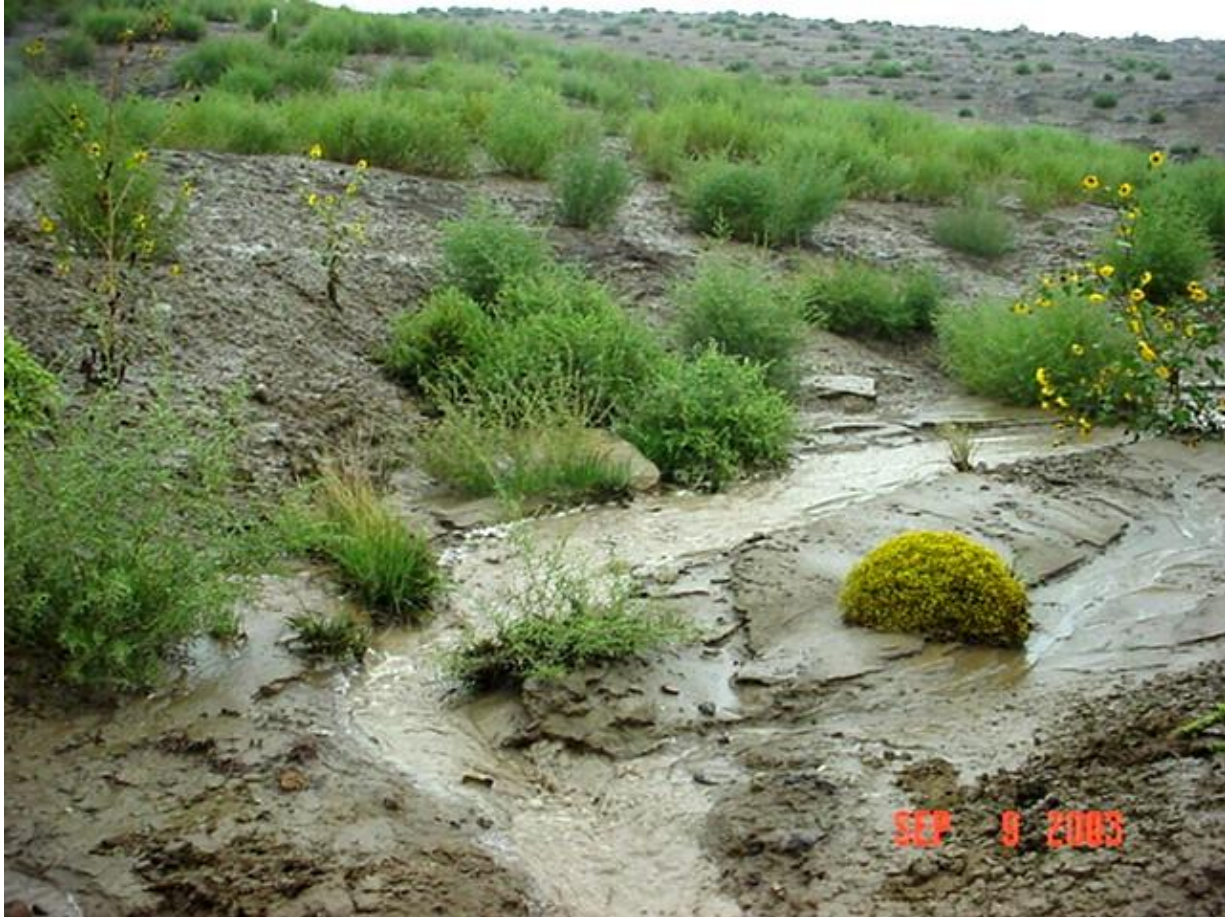
Figure 2. 9 September 2003, South McDermott channel, reach between tributaries 5 and 4, during waning discharge.

In one upland slope area between channels 3 and 4, some minor surface rilling was observed. This upland area was designed as a ridge separating these two channels near their headwaters. After grading and topsoil application, the ridge did not have the relief necessary to convey all water off either side to the south and north into channels 3 and 4 respectively; it had become flattened and allowed some runoff in the extreme storms to flow west down the flattened ridgeline. The extreme 2003 event took place after the reclaimed area had sat dormant for over two years, as most revegetation seeds failed to germinate in the droughty conditions. All the constructed channels remained stable. The company and regulatory staff agreed that the reduction in reclamation runoff coefficient that would occur when the vegetation sprouted would be sufficient to prevent future rilling from this small headwaters area, and no repair work was necessary. This was another instance where the construction crews learned the importance of maintaining the design integrity through grading and topsoil application.