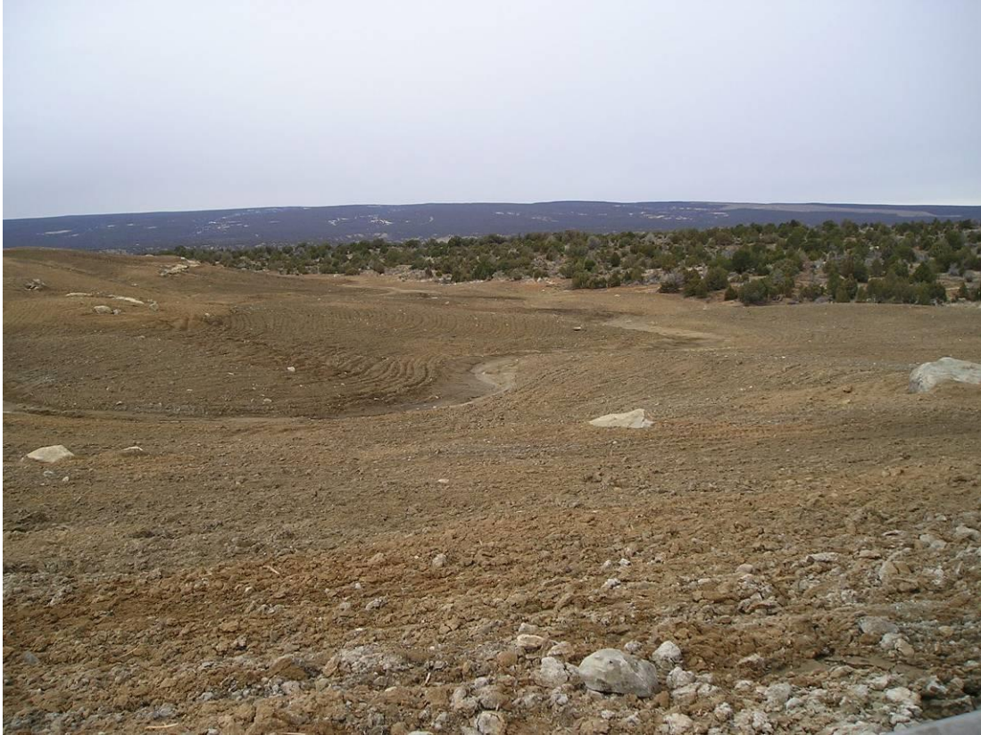
Figure 3. La Plata Mine Northgate North Subwatershed 1 in January 2005

For example, a shovel has a specific optimal face cut efficiency and this in turn relates to bench height; by designing the fluvial geomorphic slope and channel elevations to honor these equipment constraints, considerable construction efficiency could be gained without compromising the environmental goals. The GeoFluv design method had been incorporated into the Natural Regrade computer software and La Plata Mine used the beta software to design the project before the software was officially released in 2005. The ability to use high-speed computers to make the complex calculations greatly aided the design staff in its efforts to optimize the design for material handling and environmental considerations, while staying ahead of the construction operations.