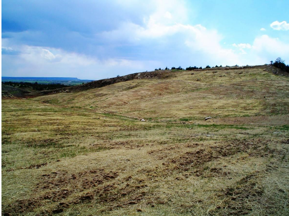
Figure 8. 5 May 2005, 170 Arroyo endwall reclamation with grassland mixture sprouting