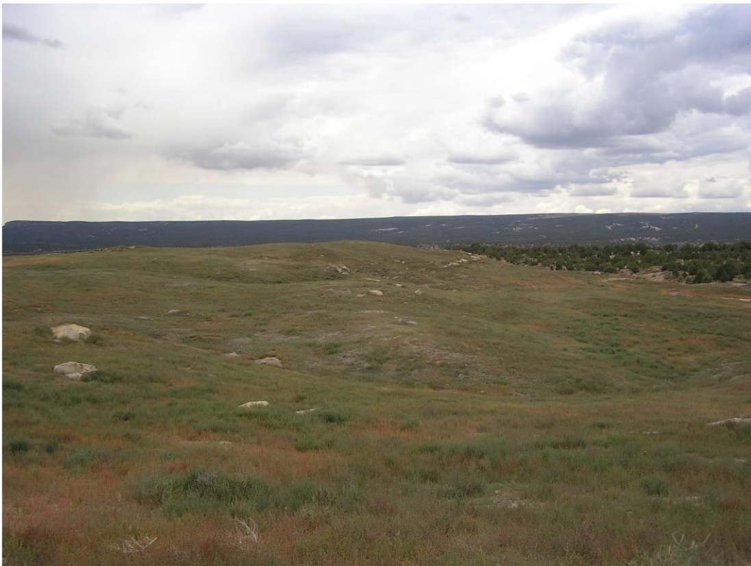
Figure 4. La Plata Mine Northgate North Subwatershed 1 in September 2006

The image in Fig. 4 was taken in mid-September of 2006 following the extreme July storm event. Figure 4 shows the same sub-watershed as Fig. 3 after the application of topsoil and seeding, and is typical of the reclamation landform response to the >100-yr recurrence interval storm. The vegetation in the image is just starting and mostly annual plants are visible, representing just the first season's volunteer growth shading the reclamation seeding sprouts. The erosion monitoring after this extreme storm event documented that the fluvial geomorphic landform performed its functions as designed and found only two areas needing repair, at least one of which was attributable to improper construction.