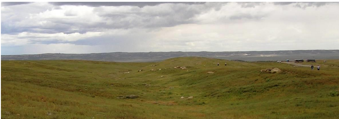
Figure 7. A view of a fluvial geomorphic reclamation area at La Plata Mine that has vegetation starting. The image of a subwatershed headwaters area was captured during the 12 September 2006 National Interactive Forum on Geomorphic Reclamation. The vegetation in the image is just starting and mostly annual plants are visible, representing just the first season's volunteer growth shading the reclamation seeding sprouts.

These results strongly suggest that the geomorphic-designed landform with merely a topsoil cover can satisfy erosion control needs sufficient to meet water quality goals, but they do not tell the soil volume or mass that was involved. Although the water quality samples from La Plata Mine give some indication of the erosion control benefit of this geomorphic approach, they do not directly quantify actual sediment load (volume). The concentration values, without discharge and duration data, and supplemental concentration values taken throughout the event, cannot