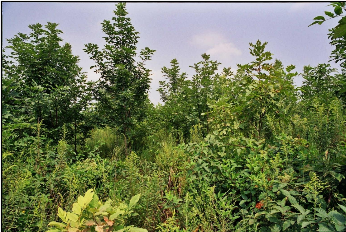
Figure 4. An emerging hardwood forest established on an active mine site in Virginia as a demonstration of the FRA.

Nitrogen-fixing trees and shrubs act as nurse plants for the higher quality hardwoods and some provide wildlife food and cover. Good nurse/wildlife plants include redbud ( Cercis canadensis ), hawthorn ( Crataegus mollis ), dogwood ( Cornus florida ), and black locust ( Robinia pseudoacacia ). Crop trees should be selected according to the soil and environmental conditions. Research has shown that commercially valuable hardwoods can be successfully grown including northern red oak ( Quercus rubra ), white oak ( Quercus alba ), green ash ( Fraxinus pennsylvanica ), black cherry ( Prunus serotina ), sugar maple ( Acer saccharum ) and yellow-poplar ( Liriodendron tulipifera ) (Burger et al., 2005). Using the FRA also encourages natural succession of early-successional native forest plants. By planting nurse and wildlife species, mid and late successional tree species, and creating conditions for early successional species to volunteer, a shorter amount of time is required to reach a diverse, commercially-valuable mature forest (Fig. 4).