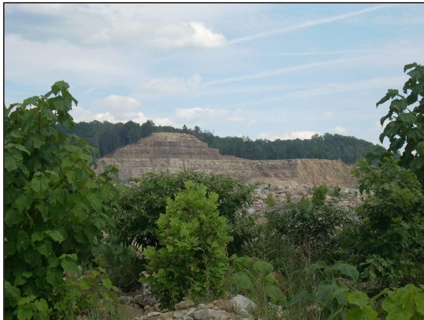
Figure 8. Three years of natural generation producing 66% ground cover and 61 different species at the University of Kentucky's Bent Mountain Reforestation Research Complex in Pike County, Kentucky (Angel, 2008).