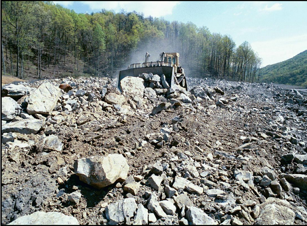
Figure 1. Photo shows the White Oak reforestation research plots in east Tennessee where an alternate growth media is being loosely graded to form a soil medium suitable for tree growth under the FRA.