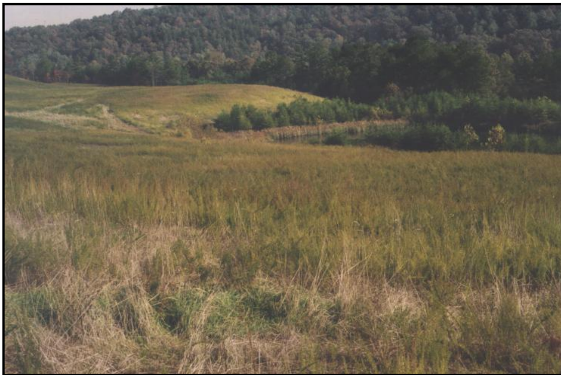
Figure 3. This photo shows a mine site in eastern Kentucky where a thick cover of Kentucky 31 fescue ( Festuca arundinacea ), sericea lespedeza ( Lespedeza cuneata ), and yellow sweet clover ( Melilotus officinalis ) would provide too much competition for tree seedlings to survive (photo by Patrick Angel).

Seeding rates should be reduced in order to limit ground cover competition to planted tree seedlings. This is possible because loosely-placed mine soils recommended in Step 2 allow greater rates of water infiltration which reduces the potential for soil erosion. Competitive ground cover will inhibit both tree survival and productivity. Tree compatible grasses include foxtail millet ( Setaria italica ), rye ( Secale cereale ), red top ( Agrostis palustris ), perennial ryegrass ( Lolium perenne ) and orchardgrass ( Dactylis glomerata ) (steep slopes only), and compatible legumes include birdsfoot trefoil ( Lotus corniculatus ) and Ladino clover ( Trifolium repens ). By using these species in a mix with other appropriate species, seedling survival will be increased and erosion will be controlled. Fertilizer rates should be low in nitrogen to discourage heavy ground cover growth while applying sufficient rates of phosphorus and potassium for optimal tree growth (Burger et al., 2005).