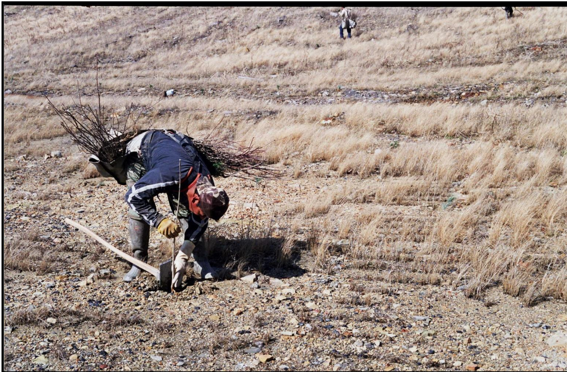
Figure 5. Tree seedlings must be carefully planted by hand in order for the fifth step of the FRA to be implemented properly.

The importance of proper tree planting cannot be over stated. The best planting stock available should be selected and maintained in cold storage until planted. Tree seedling roots exposed to air for as little as 15 minutes can significantly increase the mortality rate. From the time seedlings are removed from cold storage to the time they are planted, they should be handled with care. The seedlings must be kept moist and immediately placed in the planting bag; their roots should never be pruned. The planting hole must be made as deep as possible, to accommodate the entire root system. The planting hole must be completely closed and the soil around the seedling firmed with the planting tool or boot to eliminate air pockets. In most cases, the extra cost of hiring professional tree planters will be well worth the investment (Fig. 5).