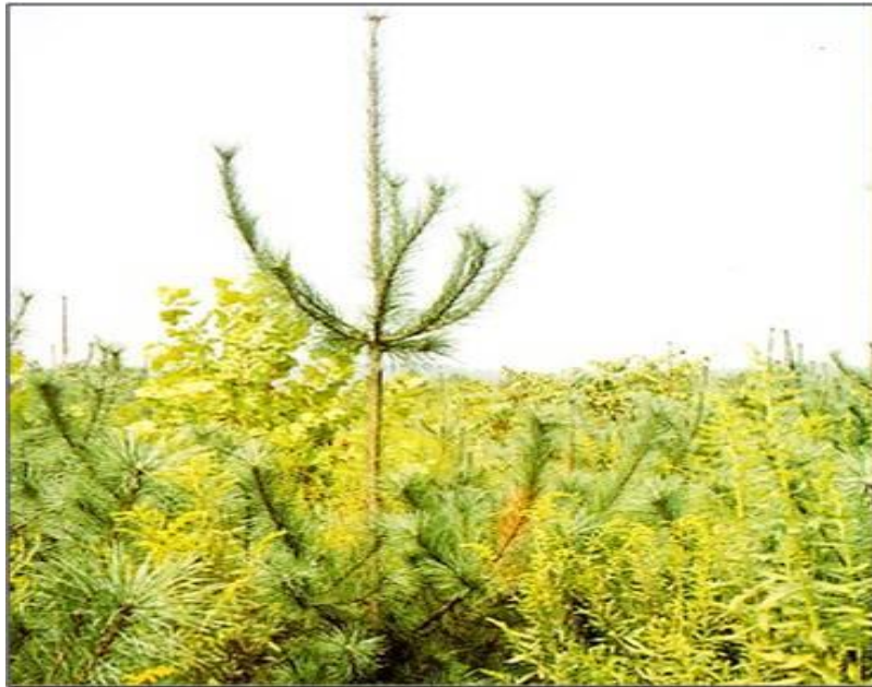
Figure 7. Six-year-old eastern white pine planted in FRA compliant spoil in WV with an annual growth interval of over 1.2 m (4 ft).

Bent Mountain three years after site preparation. After the third year, the best plots had 66% ground cover and 61 different species (58% of which were native species) (Angel, 2008).