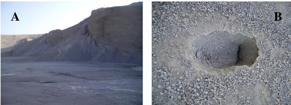
Figure 1. Location of the mine waste (chat) site. Panel A shows the piles of chat wastes at the site and Panel B shows the chat samples collected.

The Elvin/Rivermines Mine Tailings site is one of the six major mine tailings sites in the Park Hills-Desloge-Bonne Terre area of St. Francois County, Missouri. The site is located between the former towns of Elvins and Rivermines, now part of the City of Park Hills. Mining activities commenced in the Old Lead Belt about 1890, with early operations including mining, milling, roasting, and smelting. In the early years, milling operations were conducted at numerous locations in the area. Milling operations were consolidated at Elvins around 1909. The Elvins Mill also processed ore from other area mines until it was permanently closed around 1940. The site consists of chat piles that cover approximately 0.08 km 2 and are approximately 51 m high, and a tailings area covering approximately 0.53 km 2 . The tailings area is relatively flat and approximately 15 m lower than the chat pile (Fig. 1). "Chat" is a gravel-like waste product from mining and milling of lead ore, generally larger than 0.64 cm in diameter. "Tailings" are smaller, resulting from a different type of milling process. Tailings are generally less than 0.08 cm in diameter. Samples of raw chat were collected in 5 gallon buckets from the site (Fig. 1). Once collected, they were transported to the EPA Center Hill Facility in Cincinnati, OH. Upon receipt of the raw chat samples, the bucket was homogenized in rotary tumblers, rotating at 30 ± 2 rpm,