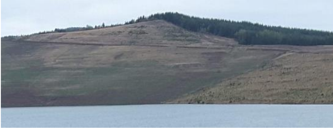
Figure 2. Photo showing long, straight slopes driving large surface-flow rates.

Water Infiltration, Penetration and Runoff. Water infiltration is the process of water entry into the soil, which is typically by downward flow through all or part of the soil surface (Hillel, 1998). The ability of water to infiltrate the soil largely depends on 1) time from the onset of rain; 2) initial soil water content; 3) soil hydraulic conductivity; 4) surface conditions; and 5) profile depth and layering (Hillel, 1998; Ryel et al., 2003; Reynolds and Reddy, 2012). Lower water infiltration creates more water runoff, less soil penetration, reduced moisture available to plants, and greater potential for sediment erosion (Herrick et al., 2006a). The rate of infiltration relative to the rate of water supply will determine how much water enters the root zone versus how much water will runoff. The relationship between the return of soil moisture, the return of vegetative cover, and recovery of soil properties is enhanced by adequate infiltration capacity of reclaimed soils (Reynolds and Reddy, 2012).