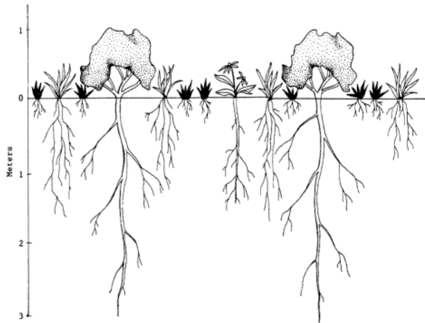
Figure 3. A healthy semi-arid, relatively weed-resistant plant community composed of early-season, shallow-rooted species (black), mid-season species with moderately deep roots (white), and late-season, deep-rooted species (grey). Establishing plant communities with diverse belowground functional group niche occupation leads towards fewer open niches susceptible to invasion by exotic invasive species, creates greater interference from neighbors and fewer resources available to exotic annuals. Plant communities are more resistant and resilient to disturbances. Adapted from Sheley et al., (1996) – drawn by Susan Kedzie-Web.

All functional groups are important; however, some functional groups can address specific limitations of the disturbed site and/or climate. Functional groups that improve hydrologic processes (e.g., infiltration, erosion, or soil structure development), water use efficiency, or micro-environmental conditions are critical in water-limited environments. Much of the stability, resistance, and self-repairing capacity associated with species-rich ecosystems is likely a result of functional group diversity rather than species diversity. Figure 3 shows below ground niche occupation by different functional groups in an arid or semi-arid ecosystem. Cool season shallow-rooted species take advantage of early season growth conditions (i.e., moisture and soil temperature) ultimately giving way to warm season and/or deeper-rooted species as the soil profile dries through the summer months. Thus, a functional matrix of traits extends the functional-types approach to consider all the traits present in an ecosystem and is useful guidance in designing seed mixtures for reclamation (Chapin et al., 2011). By selecting appropriate species with specific traits, reclamation specialists can assist the trajectory of ecosystem development.