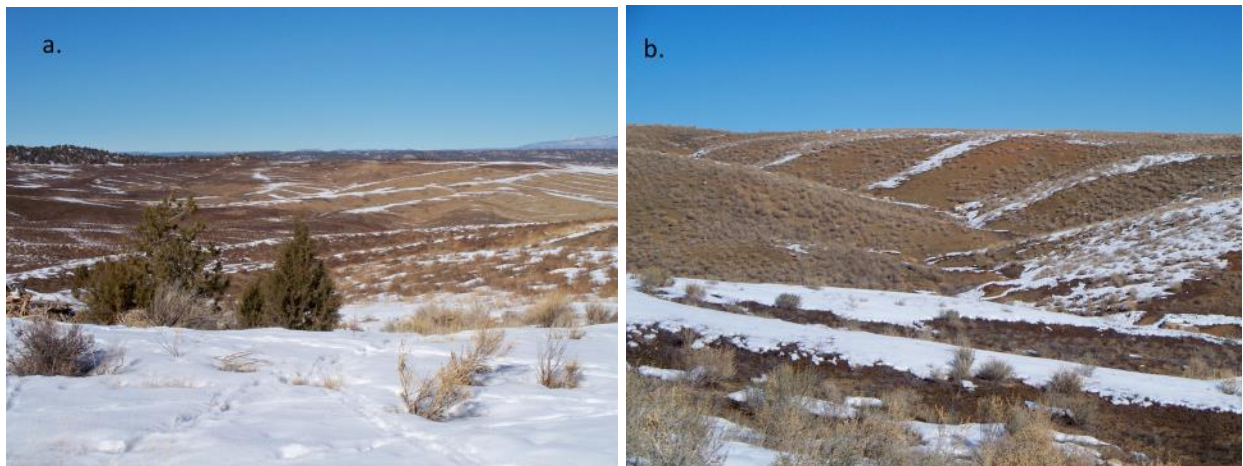
Figure 1a-b. Mature stages of reclamation showing a.) Geomorphically reclaimed landform; and b.) Geomorphic reclamation on drainage channel.

Figure 1a-b illustrates a mature landform and a mature drainage channel following geomorphic reclamation. Geomorphic reclamation aims to increase diversification of landforms, enhance sustainability, and define ridges and valleys while honoring the major drainage routes. Use of geomorphic principles in surface coal mine reclamation to design mature landforms also serves to improve the aesthetic appearance and provide a wider range of habitats for wildlife than traditional reclamation strategies (e.g., terraces). However, constructing landforms that naturally blend into the steep slopes of the surrounding environment may not ensure stability (DePriest et al., 2015). Long straight slopes can often foster large surface-flow rates and should be avoided if feasible (Fig. 2). In arid and semi-arid regions, creating terrain diversity on reconstructed landforms increases the potential to capture and store water, providing a solution to a key limiting factor and spatial variation (Bugosh, 2004; Martin-Duque et al., 2010).