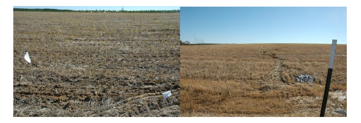
Figure 20. Switchgrass planted on 6 August 2009 on 6 November, 2009 (left). Same erosion gully as in Fig. 13 left and 17 left on 6 November, 2009 (right).

Several planting options were evaluated on two topsoil substitute soils which consisted of red oxidized topsoil substitute and prime farmland topsoil. The planting options included 1) an existing stand of bermudagrass that was killed with glyphosate followed by disking in red oxidized topsoil substitute and prime farmland topsoil respread in 2007 2) red oxidized topsoil substitute respread in 2009 was seeded directly with switchgrass, 3) browntop millet was established with switchgrass, or 4) switchgrass was established in senescing browntop millet or wheat without tillage. These were large, unreplicated areas that provided anecdotal opportunities for observation as illustrated pictorially above. Soil response was the main factor quantified across transects.