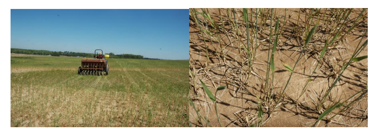
Figure 5. Switchgrass was replanted with a Tye drill at 65 kg PLS ha<sup>-1</sup> on 15 April, 2009 to redo planting in erosion repairs into standing wheat (left). Both repaired and non-eroded non-repaired areas were replanted.

Figure 4. Erosion was minimal on level prime farmland topsoil (left) or where overland water flow was reduced (right) on 25 August, 2008.