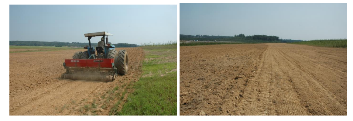
Figure 1. Switchgrass was planted with Brillion (left) at 6 kg pure live seed (PLS) ha<sup>-1</sup> on 18 August, 2008 into a prepared seedbed (right).