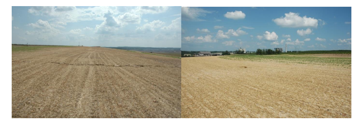
Figure 14.Green growth to the left was planted 20 May, 2009 and replanted after erosion repairs on 2 June, 2009 (left). Green growth to right is browntop millet planted with switchgrass on 20 May, on 9 June, 2009 (right).