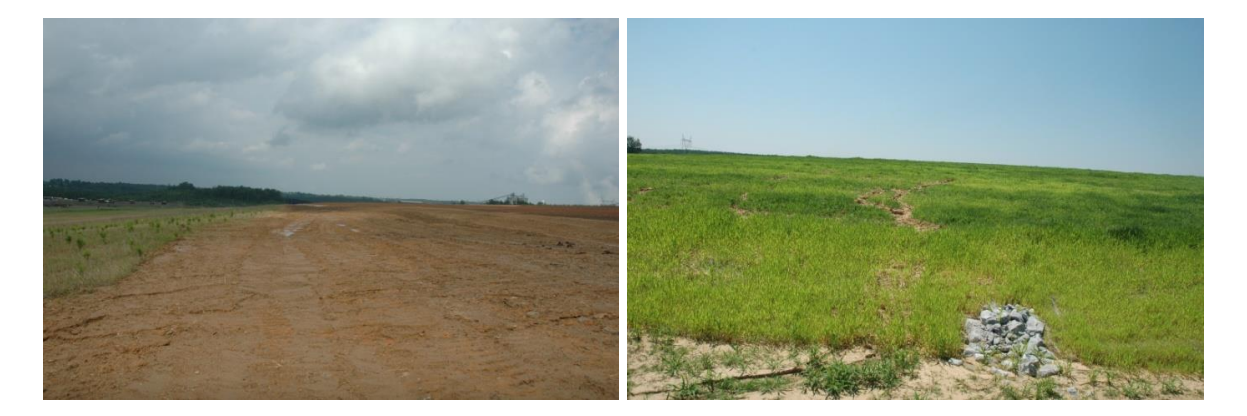
Figure 13. New Switchgrass Area on May 26 2009 (left) . Initial planting on 20 May, 2009 10 kg PLS ha-1 with Brillion planter along with 10 kg browntop millet seed per ha. Numerous erosion gullies required disking and switchgrass was replanted on 2 June 2009 along with 20 kg ha<sup>-1</sup> of browntop millet to provide sufficient ground cover (right).