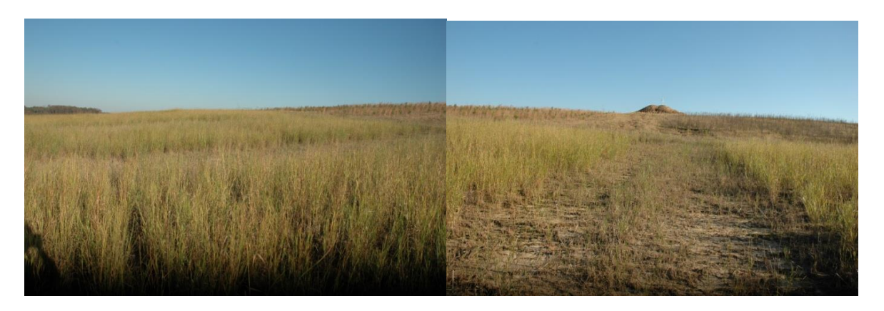
Figure 11. Switchgrass planted 18 August, 2008 on 2 November, 2009 in red oxidized soil (left) and repair strip upslope west end on 2 November, 2009 (right)

Figure 10. Lower strip east end looking west into transition from prime farmland (PFL) topsoil to red oxidized topsoil substitute (lighter green switchgrass in background) on 25 June 2009 (left) and Switchgrass in PFL soil on 25 June 2009