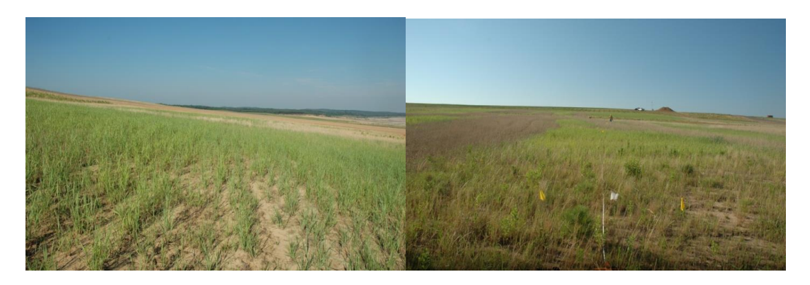
Figure 8. Switchgrass on 25 June 2009, established 18 August, 2009 into red oxidized subsoil as a topsoil substitute as approved in the permit as topsoil substitute for upland reconstruction (left). Transect from north to south for ground cover and stand evaluation (right).