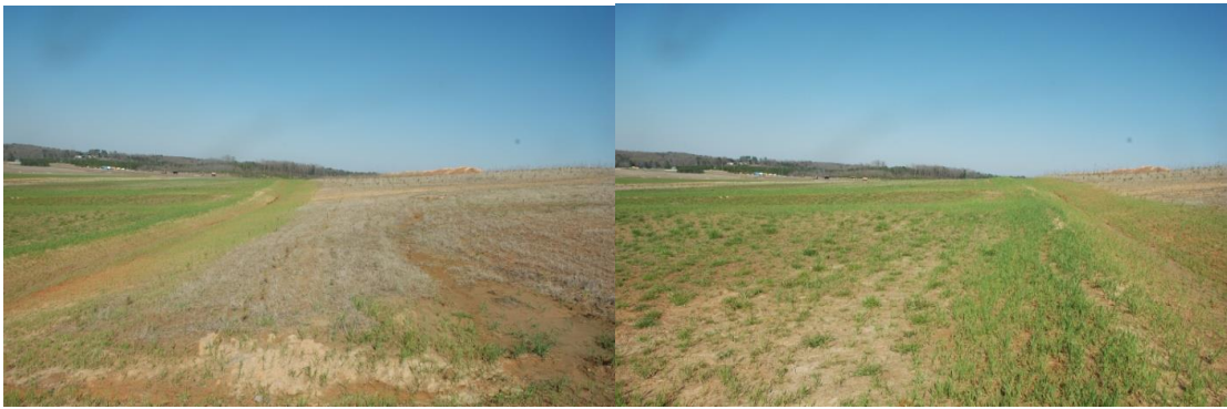
Figure 7. Wheat strips and winter ground cover on 18 March, 2009.