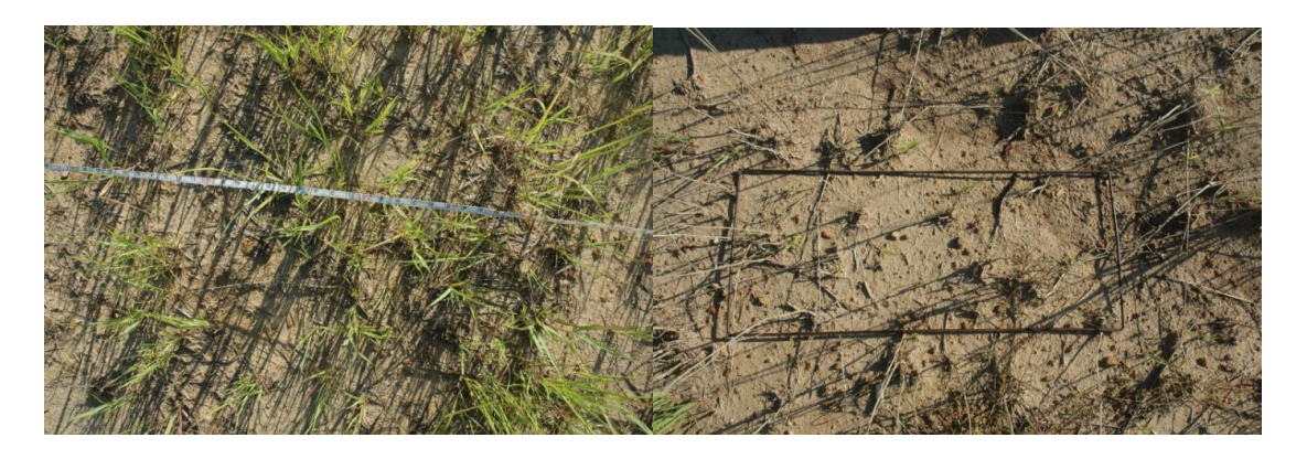
Figure 6. Ground cover was estimated by counting intersecting points along a tape (left). Seedling counts and biomass were determined within 0.25 m-2 quadrats (right) on 25 June, 2009 in switchgrass established on 18 August, 2008. Smaller seedlings planted on 15 April, 2009 were not harvested on 25 June (right). Red oxidized soil.

Figure 5. Switchgrass was replanted with a Tye drill at 65 kg PLS ha<sup>-1</sup> on 15 April, 2009 to redo planting in erosion repairs into standing wheat (left). Both repaired and non-eroded non-repaired areas were replanted.