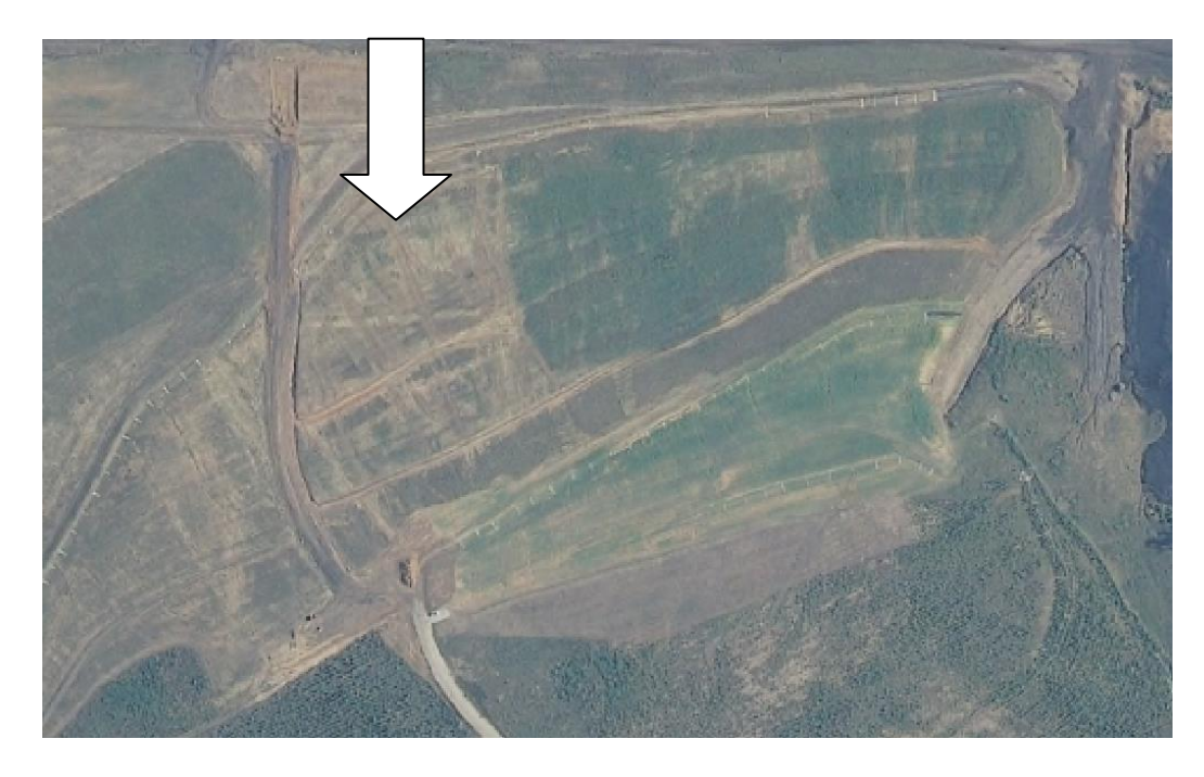
Figure 2. Switchgrass planted into two respread soils: Red oxidized subsoil to left of arrow and prime farmland topsoil to the right of arrow.

2.3 L ha<sup>-1</sup> crop oil on 23 March and repeated on 18 April, 2009 to suppress wheat, volunteer ryegrass ( Lolium multiflorum ) and various broadleaf rosettes.