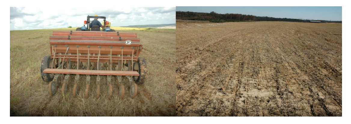
Figure 18. Switchgrass was replanted on 6 August 2009 into senescing browntop millet (left) and provided sparse ground cover by 6 November, 2009 (right).

Figure 17. Browntop millet fertilized with was too competitive for switchgrass seedlings. It was clipped in July and formed a suppressive mat that provided good erosion control (left). Erosion gully in newly planted switchgrass and browntop millet on 24 July 2009 (right) same gully as in Fig. 13 left.