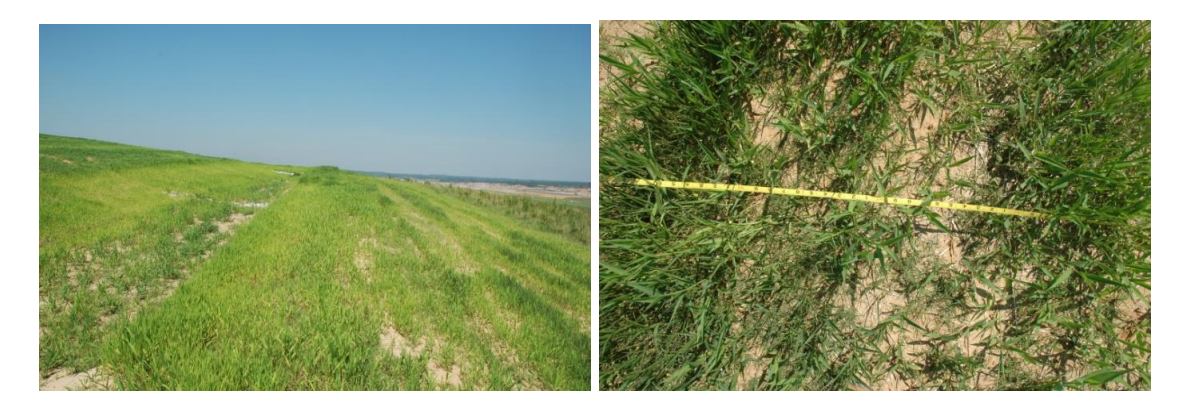
Figure 16. Terrace was planted to browntop millet and bermudagrass on 2 June 2009 (left). Ground cover of browntop millet and bermudagrass on 25 June, 2009 (right).

Figure 15. New erosion gully as of 9 June 2009 following planting on 2 June and application of 2.4 Mg ha<sup>-1</sup> mulch (left). Erosion gullies following the 2 June planting were isolated and not repaired. Green to the left was planted earlier in May, 2009 had few erosion gullies (right).