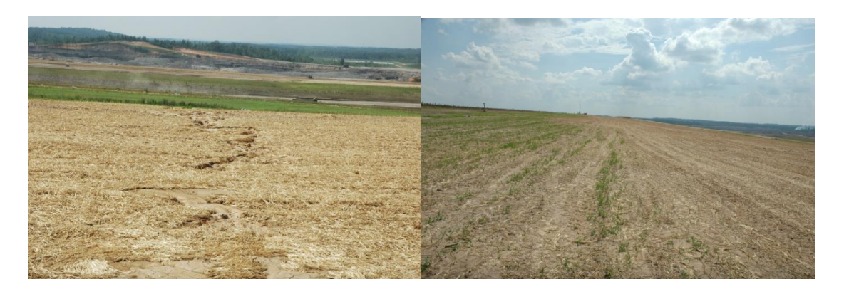
Figure 15. New erosion gully as of 9 June 2009 following planting on 2 June and application of 2.4 Mg ha<sup>-1</sup> mulch (left). Erosion gullies following the 2 June planting were isolated and not repaired. Green to the left was planted earlier in May, 2009 had few erosion gullies (right).

Figure 14.Green growth to the left was planted 20 May, 2009 and replanted after erosion repairs on 2 June, 2009 (left). Green growth to right is browntop millet planted with switchgrass on 20 May, on 9 June, 2009 (right).