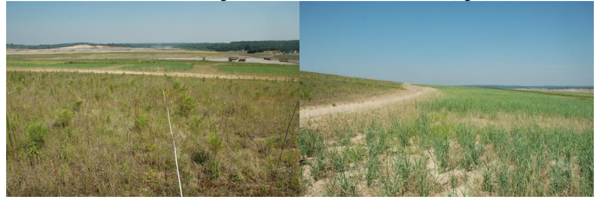
Figure 9.Transect downslope for initial harvest of switchgrass on 25 June, 2009 (left). Upper strip of switchgrass planted 18 August, 2008 on 25 June 2009 east to west (right) in red oxidized soil.

Figure 8. Switchgrass on 25 June 2009, established 18 August, 2009 into red oxidized subsoil as a topsoil substitute as approved in the permit as topsoil substitute for upland reconstruction (left). Transect from north to south for ground cover and stand evaluation (right).