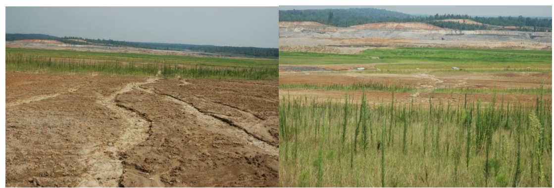
Figure 3. Erosion gullies washed through switchgrass planted into a prepared seedbed with red oxidized soil with a 1-2 % slope (left) with overland flow from upslope following tropical storm Fay (right).

Switchgrass seedlings were counted within a 0.25 m<sup>-2</sup> quadrats (Fig. 6). An initial random count was conducted on 6 November, 2008 and at 15 m intervals along each transect on 25 June and 5 November, 2009. Hand clipped samples within 0.25 m<sup>-2</sup> quadrats were collected and dried at 55 ^{\circ} C on 25 June and 5 November, 2009. Two additional transects were installed prior to sampling in November, 2009.