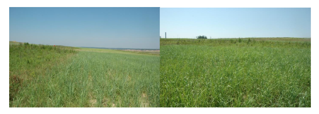
Figure 10. Lower strip east end looking west into transition from prime farmland (PFL) topsoil to red oxidized topsoil substitute (lighter green switchgrass in background) on 25 June 2009 (left) and Switchgrass in PFL soil on 25 June 2009