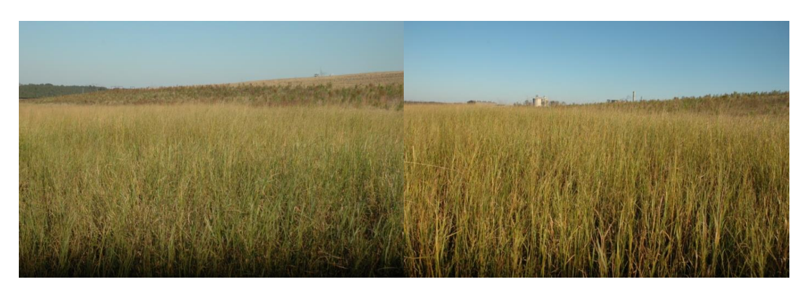
Figure 12. Switchgrass growth in brown silt loam prime farmland soil on 2 November, 2009.

Figure 11. Switchgrass planted 18 August, 2008 on 2 November, 2009 in red oxidized soil (left) and repair strip upslope west end on 2 November, 2009 (right)