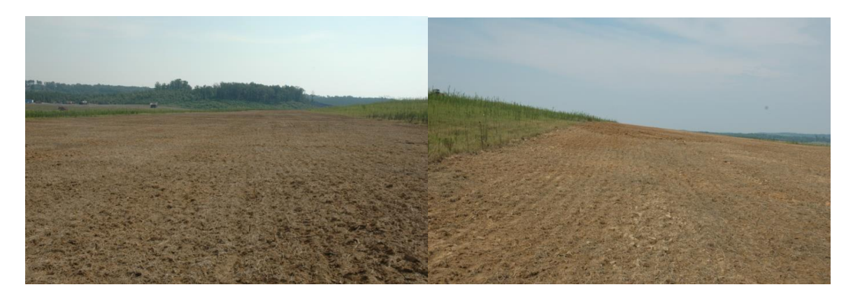
Figure 4. Erosion was minimal on level prime farmland topsoil (left) or where overland water flow was reduced (right) on 25 August, 2008.