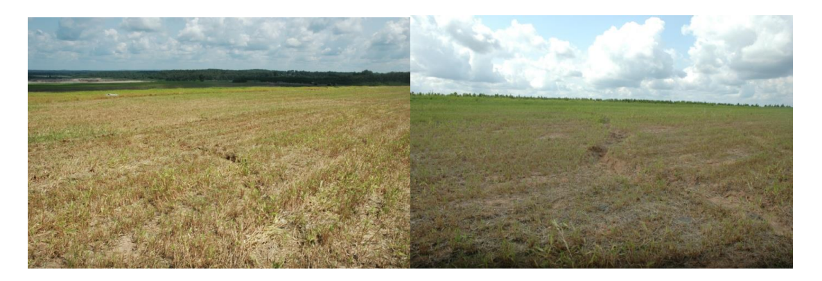
Figure 17. Browntop millet fertilized with was too competitive for switchgrass seedlings. It was clipped in July and formed a suppressive mat that provided good erosion control (left). Erosion gully in newly planted switchgrass and browntop millet on 24 July 2009 (right) same gully as in Fig. 13 left.