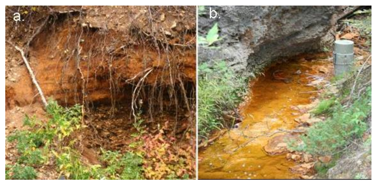
Figure 3. Photographs of Swift Gulch: a) ancient ferricrete-cemented soil forming a bench above the modern streambed; b) the stream during late summer baseflow conditions at monitoring station L-19 (the automated sampler in the background is roughly 1 m tall).

was not a pre-existing seepage collection system, and therefore relied solely on source control provided by covers to reduce infiltration. Subsequent to mine closure ARD issues have developed in Swift Gulch. This gulch contains a small headwater stream which drains from north of the Queen Rose and Surprise pits on the northern end of the Landusky mine to the Fort Belknap reservation. Typical average flow for Swift Gulch is < 50 L/sec. Ferricrete deposits, which formed before mining began, have been recognized in Swift Gulch (Fig. 3).