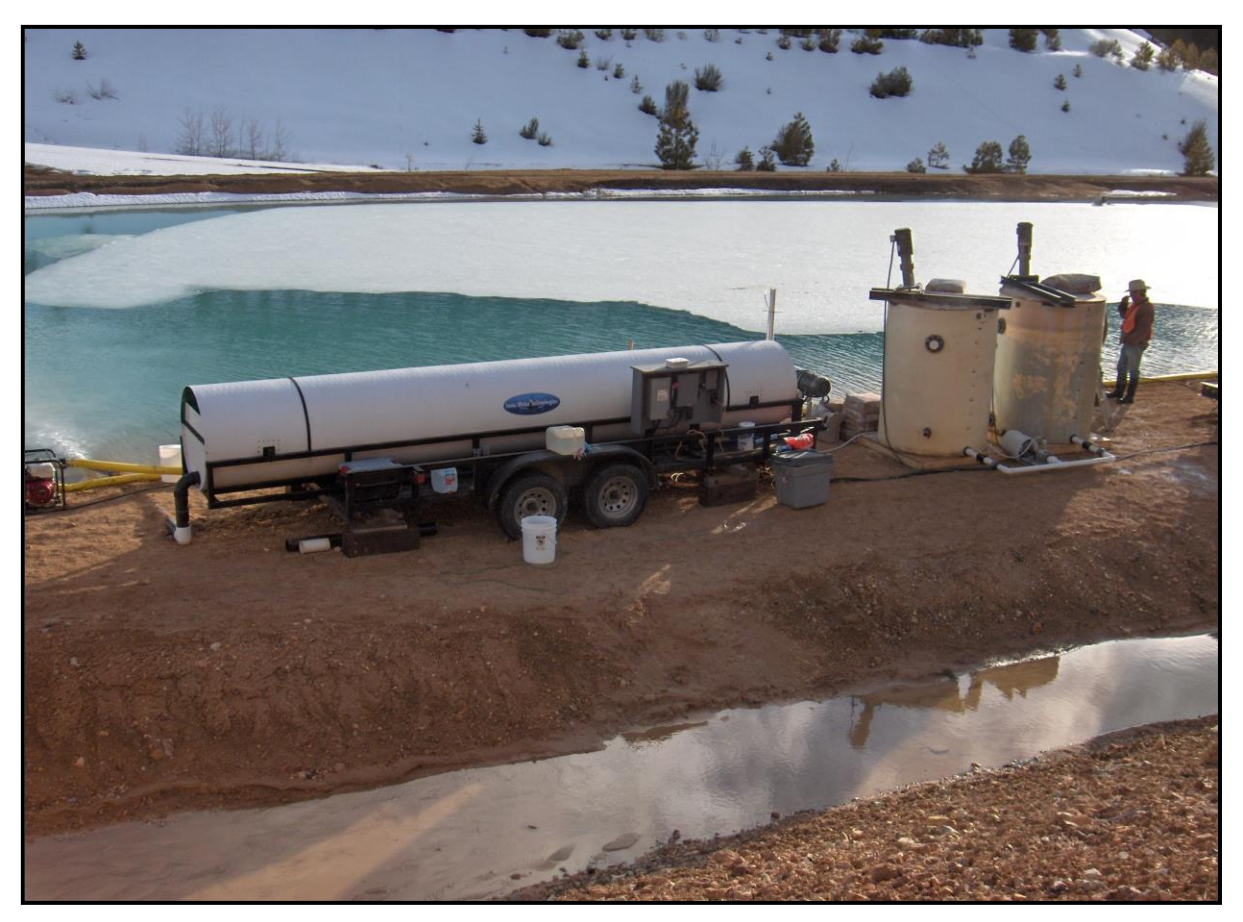
Figure 3. RCTS system at the Leviathan Mine.

The RCTS<sup>™</sup> system operated between 4-14-2006 and 7-10-2006. The conventional system operated between 6-27-2006 and 8-25-2006. The influent AMD analysis is provided in Table 4. The pH and metals concentrations in the influent were relatively consistent over the treatment span of the conventional system.