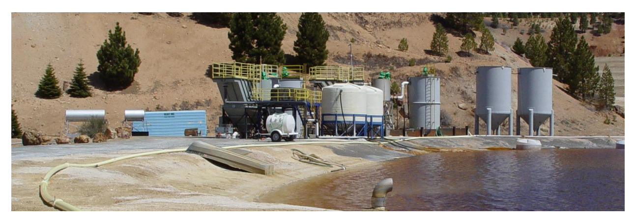
Figure 2. Conventional treatment system at the Leviathan Mine.

the water/AMD mixture contained in the storage ponds using a conventional system that was originally designed to treat highly evapoconcentrated AMD with high As concentrations. The system used a biphasic configuration (2 stage pH adjustment and 2 stage sludge separation) until 2005 when the system was converted to monophasic treatment to simplify the system and enable higher treatment rates.