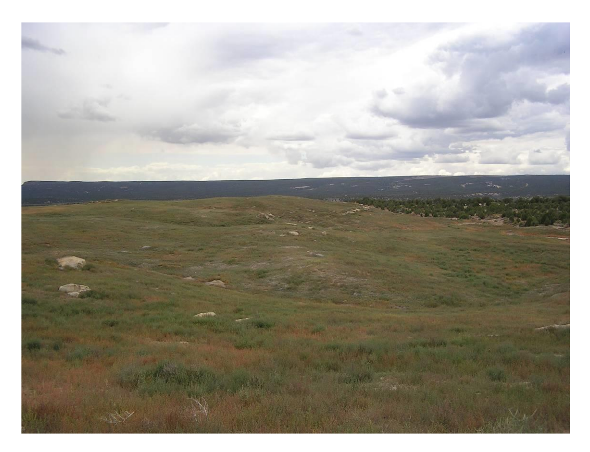
Figure 4. La Plata Mine Northgate North Subwatershed 1 in September 2006

The image in Fig. 4 was taken in mid-September of 2006 following the extreme July storm event. Figure 4 shows the same sub-watershed as Fig. 3 after the application of topsoil and seeding, and is typical of the reclamation landform response to the >100-yr recurrence interval storm. The vegetation in the image is just starting and mostly annual plants are visible, representing just the first season's volunteer growth shading the reclamation seeding sprouts. The erosion monitoring after this extreme storm event documented that the fluvial geomorphic landform performed its functions as designed and found only two areas needing repair, at least one of which was attributable to improper construction.