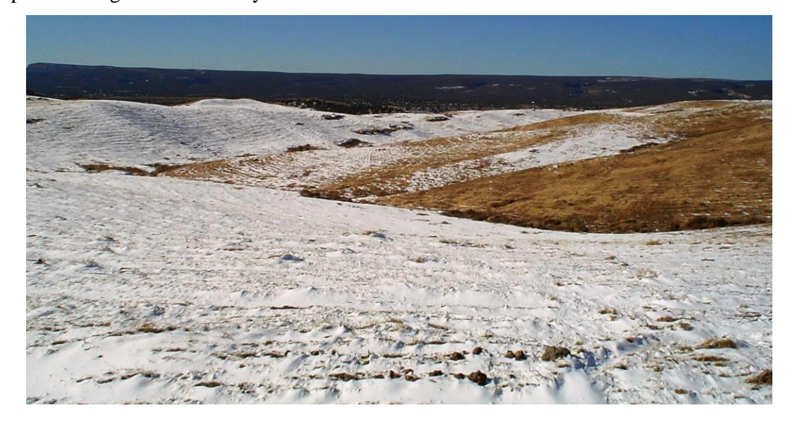
Figure 10. December 2005, Northgate Arroyo headwaters showing variation in moisture harvesting from slope aspect diversity in fluvial geomorphic-designed landform.

Conversely, the variation in moisture harvest resulting from the dissected topography will likely play a larger role in creating community diversity. The image in Fig. 10 below was taken in December 2005 and shows the variation in moisture harvesting that results from the complex fluvial geomorphic slope design. The north-facing slope at the left of the image is maximizing moisture harvesting because it is not exposed to the sun's energy all day. The south-facing slope across the valley has less snow cover overall, but the GeoFluv design has broken the slope into smaller subwatersheds that contain east and west aspects. The reclamation landform provides variation in water content and sunlight to naturally create niches for different plant species that will promote vegetation diversity.