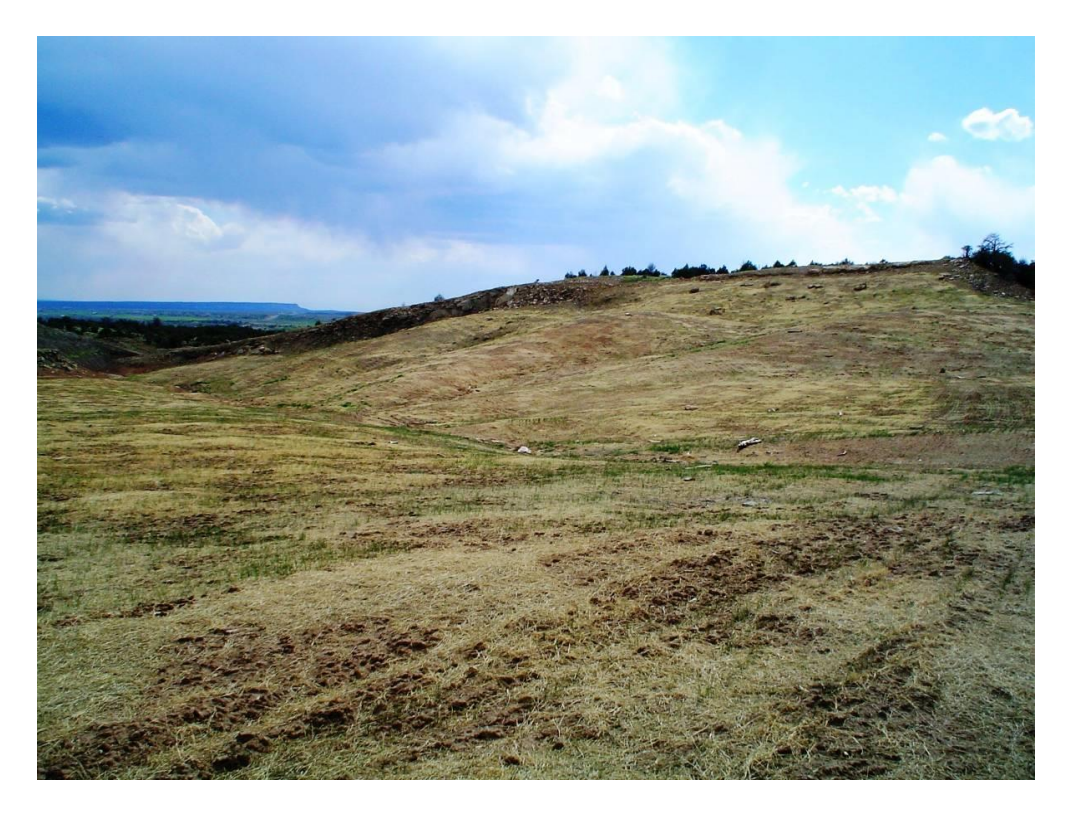
Figure 8. 5 May 2005, 170 Arroyo endwall reclamation with grassland mixture sprouting