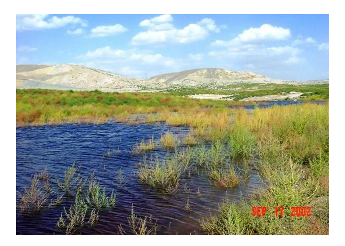
Figure 1. 17 Sept 2002, Cottonwood reclamation west storm surge basin as Inspector Robert Russell saw it. The un-vegetated portions of the two steep hills in the background are GeoFluv reclamation also and needed no erosion repair after the series of intense storms during the second week of September.

point of reference, a 50-yr, 3-hr storm at the site is about 49.5 mm (1.95 in). All the designed ephemeral channels flowed that day.