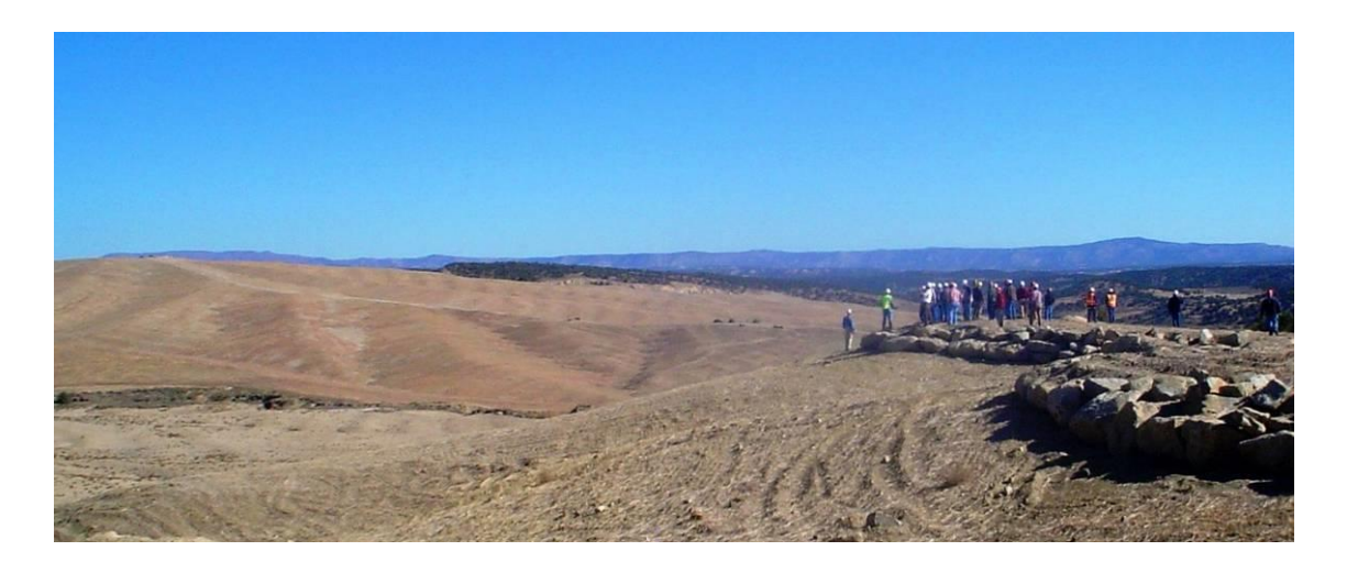
Figure 6. A fluvial geomorphic reclamation area at La Plata Mine that has been topsoiled; all the landform in the fore-ground and mid-ground without tree cover is graded and topsoiled reclamation. Image captured during 28 October 2008 National Association of Abandoned Mine Land Programs national conference tour.