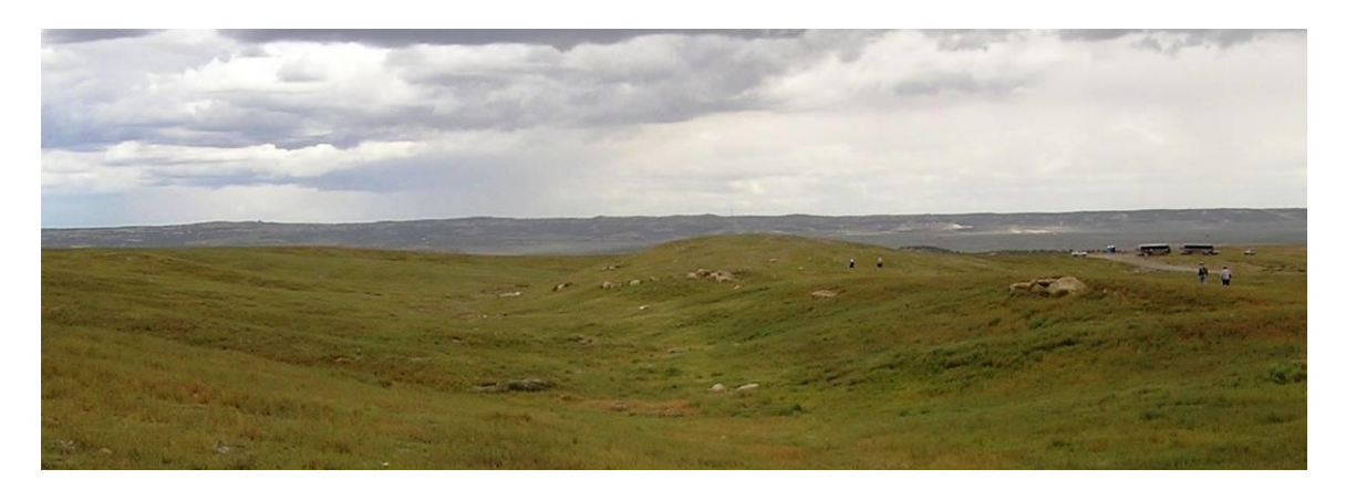
Figure 7. A view of a fluvial geomorphic reclamation area at La Plata Mine that has vegetation starting. The image of a subwatershed headwaters area was captured during the 12 September 2006 National Interactive Forum on Geomorphic Reclamation. The vegetation in the image is just starting and mostly annual plants are visible, representing just the first season's volunteer growth shading the reclamation seeding sprouts.

Figure 6. A fluvial geomorphic reclamation area at La Plata Mine that has been topsoiled; all the landform in the fore-ground and mid-ground without tree cover is graded and topsoiled reclamation. Image captured during 28 October 2008 National Association of Abandoned Mine Land Programs national conference tour.