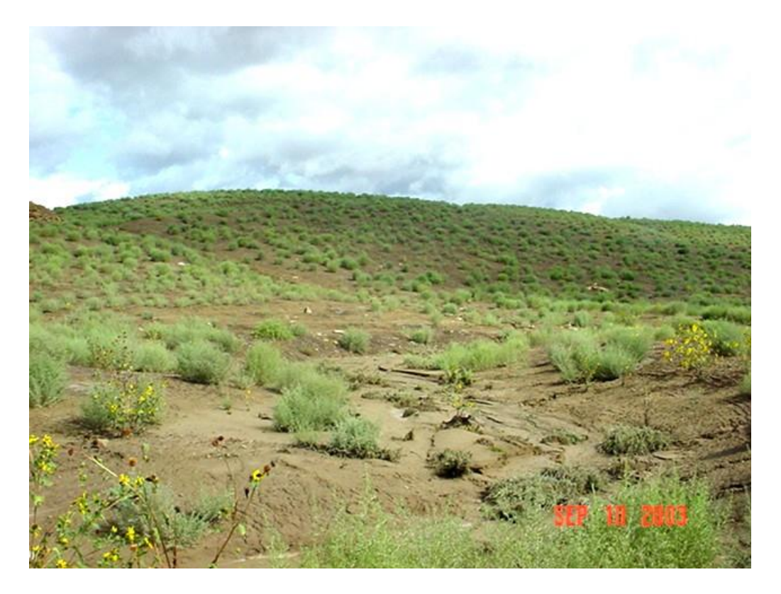
Figure 9. 10 September 2003, South McDermott valley bottom channel, reach 7 to 8

Figure 8. 5 May 2005, 170 Arroyo endwall reclamation with grassland mixture sprouting