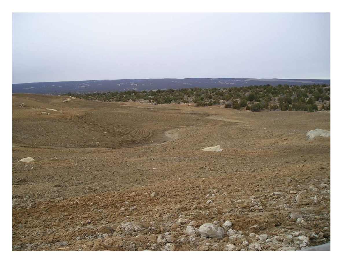
Figure 3. La Plata Mine Northgate North Subwatershed 1 in January 2005

For example, a shovel has a specific optimal face cut efficiency and this in turn relates to bench height; by designing the fluvial geomorphic slope and channel elevations to honor these equipment constraints, considerable constructions efficiency could be gained without comprising the environmental goals. The GeoFluv design method had been incorporated into the Natural Regrade computer software and La Plata Mine used the beta software to design the project before the software was officially released in 2005. The ability to use high-speed computers to make the complex calculations greatly aided the design staff in its efforts to optimize the design for material handling and environmental considerations, while staying ahead of the construction operations.