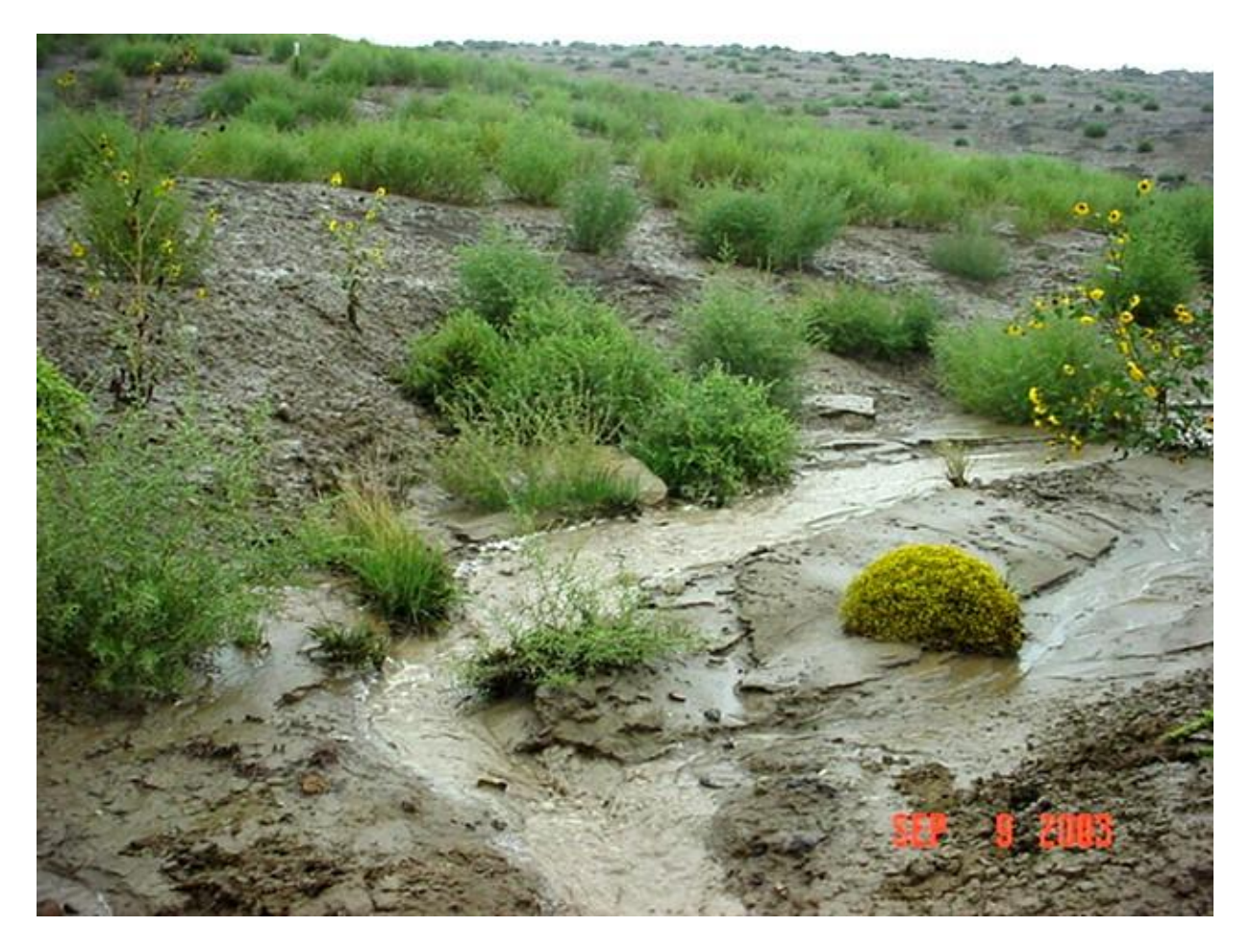
Figure 2. 9 September 2003, South McDermott channel, reach between tributaries 5 and 4, during waning discharge.

In one upland slope area between channels 3 and 4, some minor surface rilling was observed. This upland area was designed as a ridge separating these two channels near their headwaters. After grading and topsoil application, the ridge did not have the relief necessary to convey all water off either side to the south and north into channels 3 and 4 respectively; it had become flattened and allowed some runoff in the extreme storms to flow west down the flattened ridgeline. The extreme 2003 event took place after the reclaimed area had sat dormant for over two years, as most revegetation seeds failed to germinate in the droughty conditions. All the constructed channels remained stable. The company and regulatory staff agreed that the reduction in reclamation runoff coefficient that would occur when the vegetation sprouted would be sufficient to prevent future rilling from this small headwaters area, and no repair work was necessary. This was another instance where the construction crews learned the importance of maintaining the design integrity through grading and topsoil application.