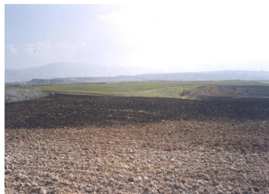
Figure 8. Spreading of topsoil on horizontal surfaces of waste heaps designated for farming

In any case, the environmental permits make easier the participation of the public and all involved stakeholders in environmental impact assessment and environmental auditing procedures. In this way the development of innovative technical and administrative activities, which aim at improved environmental protection, is promoted.