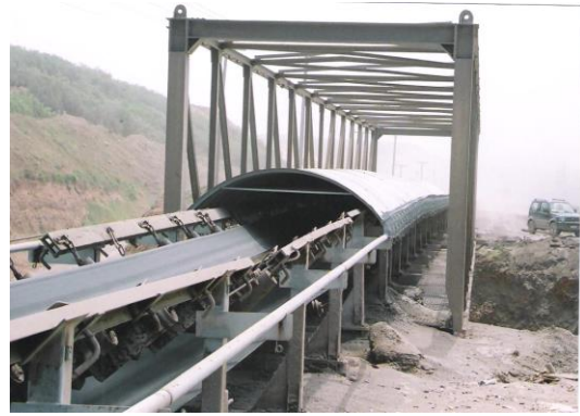
Figure 6. Installation of covers on belt conveyors that transport ash from the thermal power plants to the mines.