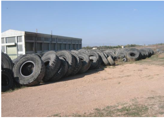
Figure 5. Temporary storage of tires delivered to contractors specialized in recap and recycling.