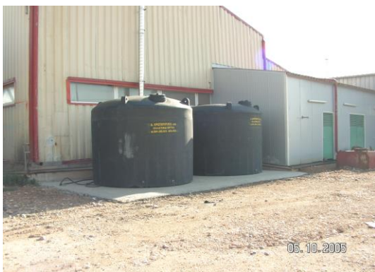
Figure 7. Temporary storage of used lubricants