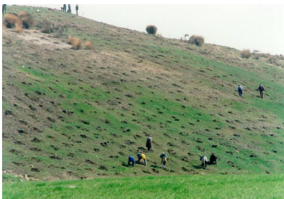
Figure 2. Reforestation of a waste heap slope.