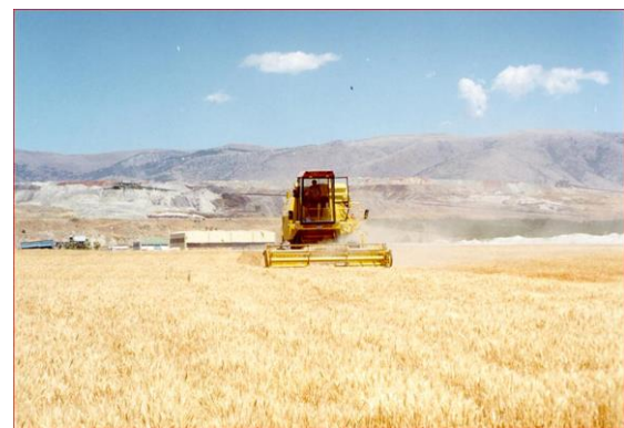
Figure 3. Cultivation of reclaimed mine land by local farmers.

The exploitation of these lignite mines has a strategic importance for the Greek energy portfolio. It provides significant advantages, such as low cost of extraction and relatively stable and easily predictable fuel prices. It also contributes to a significant saving of foreign currency reserves (approximately 1 billion dollars annually) and offers both stability and security in the availability of fuel supplies. At the same time, the utilization of lignite provides thousands of jobs throughout the Greek countryside, where high rates of