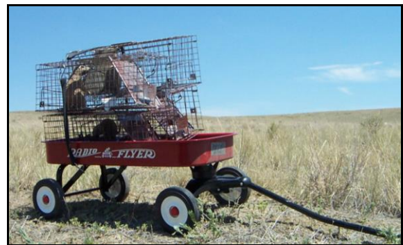
Figure 2b. Transferring prairie dogs to within the Antelope Mine permit area artificial colony in reclamation at the Antelope Mine.