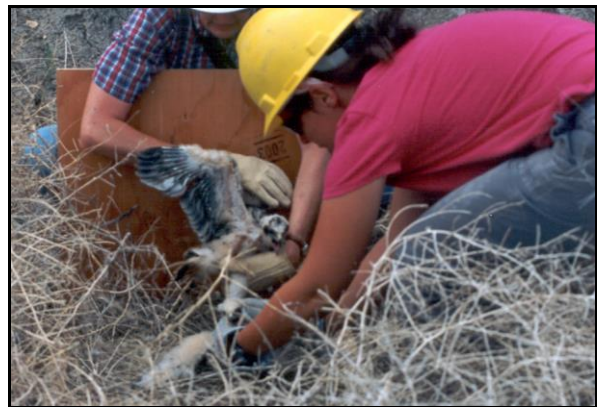
Figure 5c. Relocating an active northern harrier ground nest at a surface coal northeast mine in northeast Wyoming.