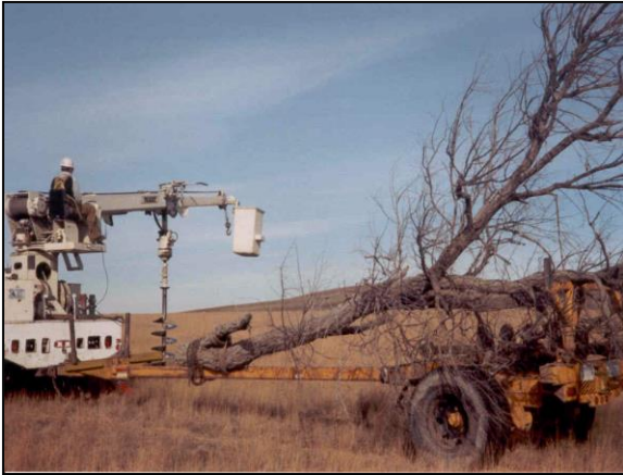
Figure 4a. Relocating an inactive Swainson's hawk nest tree at a surface coal mine in northeast Wyoming.