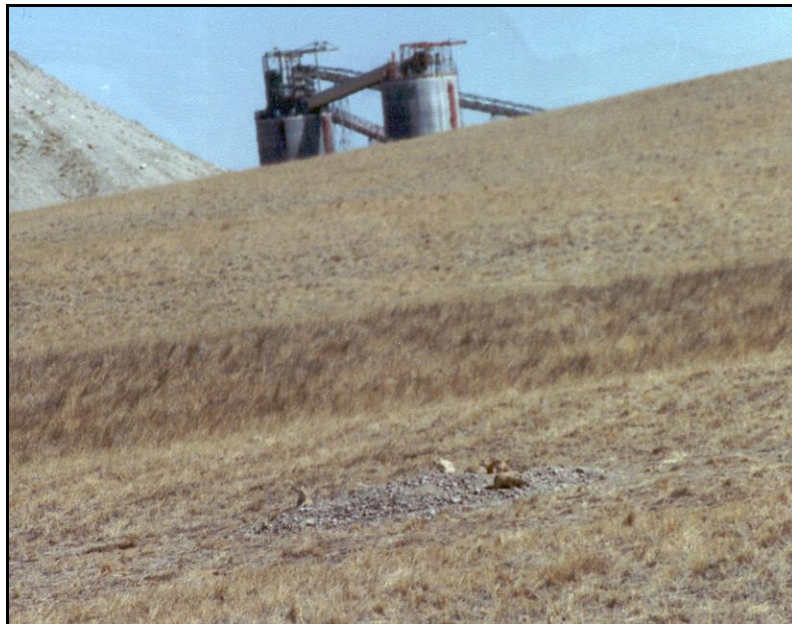
Figure 9. Prairie dogs post release in man-made colony in Reclamation at the Antelope Mine in northeast Wyoming.

By September 2006, the four-colony complex had expanded to approximately 86 non-contiguous ha. Burrow density at the release sites had increased dramatically by fall 2006, from a total of 70 man-made holes to more than 800 (including the original 70). Along with their tentative efforts to expand the colonies, the prairie dogs are also having an impact on the vegetation in the mitigation area. Numerous burrow entrances within the mitigation colonies are already ringed by bare ground from the animals clipping the grass down to the roots below the surface (Fig. 9). That behavior will greatly contribute to the ultimate goal of creating viable mountain plover habitat (i.e., short, sparse vegetation) in reclamation. Cattle grazing also reduced vegetation height throughout reclamation during 2004 -2006, including the areas immediately adjacent to the mitigation colonies.