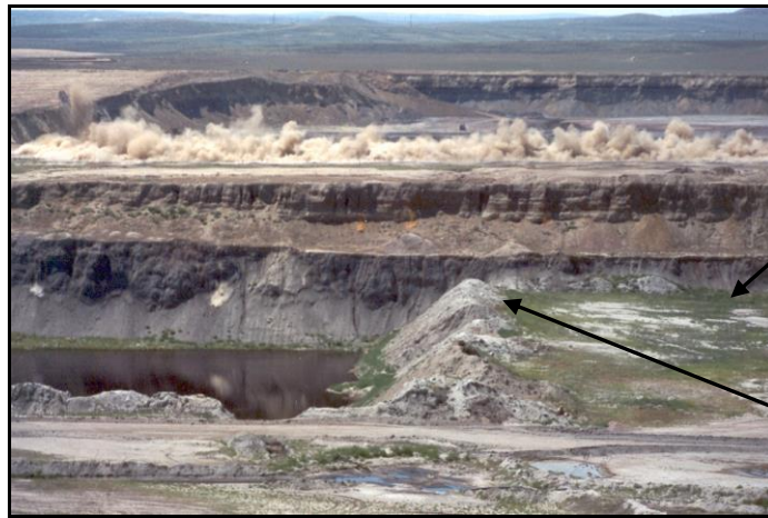
Figure 5a. Northern harrier nest sites at base of overburden highwall at a surface coal mine in Wyoming.