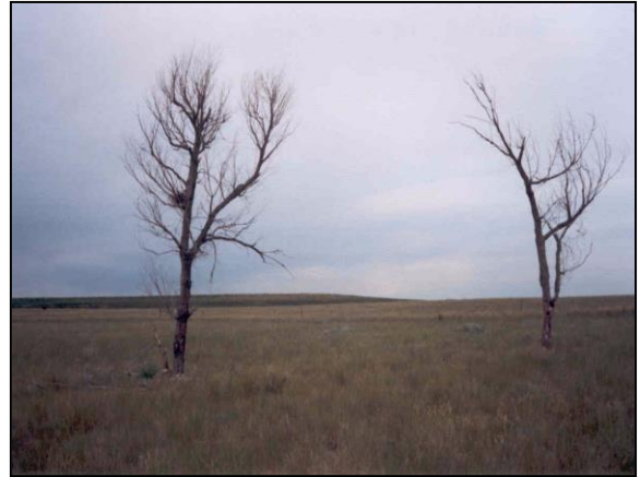
Figure 4b. Relocated Swainson's hawk nest tree at a surface coal mine in Northeast Wyoming.