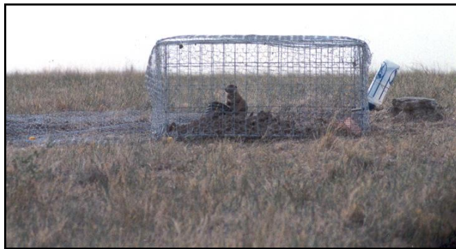
Figure 2c. Prairie dog in acclimation cage with wire blanket over tunnel & chamber in an artificial colony in reclamation at the Antelope Mine.