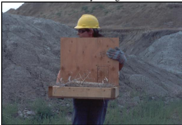
Figure 5b. Relocating an active northern harrier ground nest at a surface coal mine in Wyoming.