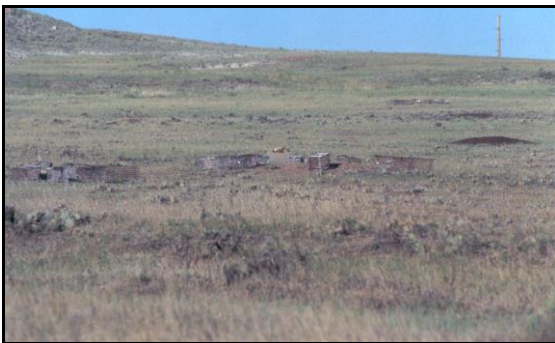
Figure 2a. Trapping prairie dogs at source colony

Captured prairie dogs were relocated to a release site (Fig. 2b), with placement dependent on their age, sex, family relationship to other translocated animals, and source colony. A few of the prairie dogs captured in 2003 were free-released into existing burrows to supplement colonies created in 2002, but most were placed in the 2003 release cages in groups of 1-5. Prairie dogs were kept in the cages for a period of 4-7 days (Fig. 2c), depending on their age and whether or not unconfined dogs were present in the colony. All confined animals were fed and watered daily. Artificial colonies were monitored daily during the initial capture/release phase to determine retention rates after release. Rations continued to be provided periodically throughout the winter to encourage the prairie dogs to remain in the colonies and maximize survival rates.