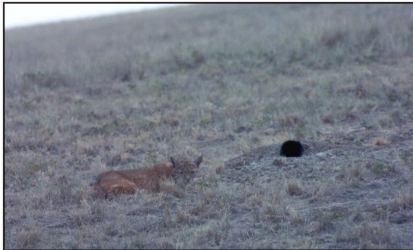
Figure 7. Bobcat outside artificial prairie dog burrow in Reclamation at the Antelope Mine in northeast Wyoming.

primarily due to natural dispersal and predation. It is likely that some adults, especially the adult males, left the sites immediately upon their release from the acclimation cages. This is supported by the fact that many of the prairie dogs that remained in the largest colony after their release in summer 2002 were known to be juveniles, as they had been marked upon capture. Numerous potential predators reside at the mine, including golden eagles, coyotes ( Canis latrans ), badgers ( Taxidea taxus ), bobcats ( Lynx rufus ), red fox ( Vulpes vulpes ), and even prairie rattlesnakes ( Crotalus viridis ). Five of those six species were observed patrolling through, or perching near, the mitigation colonies once prairie dogs had been placed there. A bobcat frequented the colonies for a while during 2002 (Fig. 7), and badgers dug out several of the unsecured chambers in both years, especially 2003.