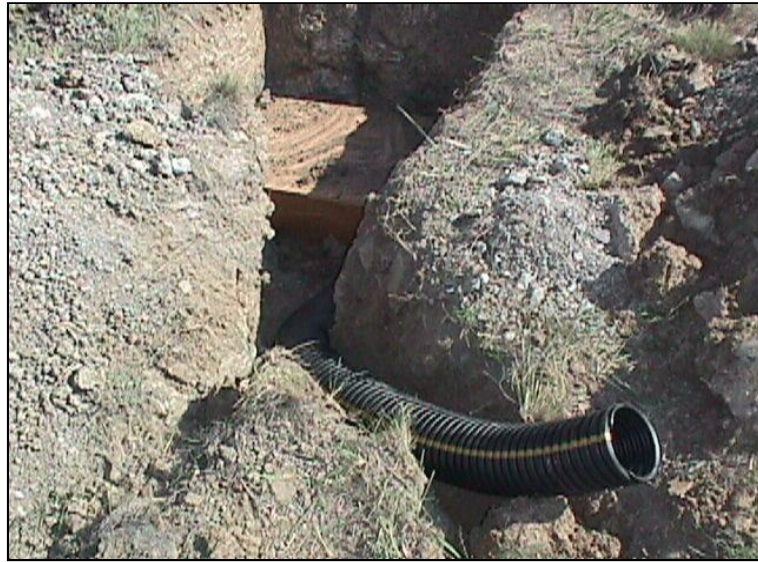
Figure 1c. Tube tunnel connecting box-lined chamber to surface in artificial prairie dog colony in reclamation at the Antelope Mine.

prevent the prairie dogs from escaping prematurely. The remaining chambers consisted of a wooden lid set on four stakes to keep the hole from caving in when it was reburied. Those sites were left unlined in the hope that prairie dogs would use them as starter chambers once they were released from their containment cages. All chamber floors were lined with grass to serve as bedding material, and connected to the surface with either one or two lengths of 1.5-1.8 m x 10 cm diameter corrugated tubing, depending on chamber size. The tubing was arranged to provide a horizontal turn of about 45 degrees between the surface and the chamber bottom, to simulate natural burrow construction.