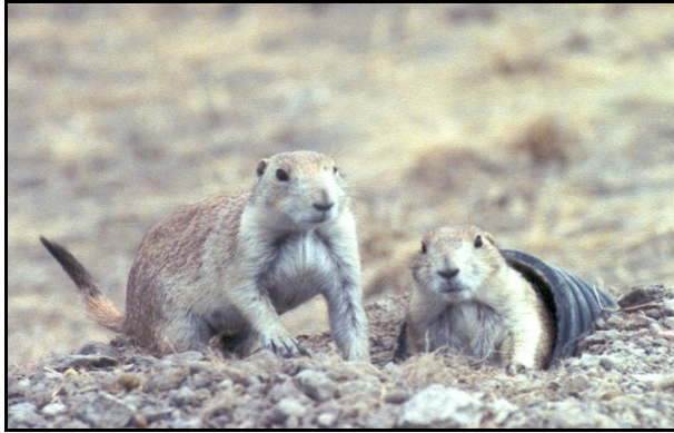
Figure 8a. Prairie dogs at artificial burrow entrance post-release in man-made colony at the Antelope Mine in northeast Wyoming.