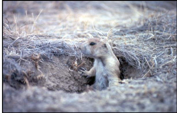
Figure 8b. Prairie dog at new natural burrow excavated post-release in man-made colony at the Antelope Mine in northeast Wyoming.

By September 2006, the four-colony complex had expanded to approximately 86 non-contiguous ha. Burrow density at the release sites had increased dramatically by fall 2006, from a total of 70 man-made holes to more than 800 (including the original 70). Along with their tentative efforts to expand the colonies, the prairie dogs are also having an impact on the vegetation in the mitigation area. Numerous burrow entrances within the mitigation colonies are already ringed by bare ground from the animals clipping the grass down to the roots below the surface (Fig. 9). That behavior will greatly contribute to the ultimate goal of creating viable mountain plover habitat (i.e., short, sparse vegetation) in reclamation. Cattle grazing also reduced vegetation height throughout reclamation during 2004 -2006, including the areas immediately adjacent to the mitigation colonies.