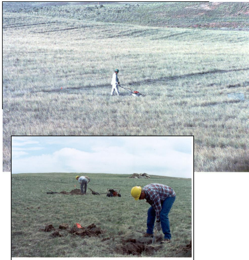
Figure 1b. Excavating burrows in an artificial prairie dog colony in reclamation at the Antelope Mine.

Preliminary work for the prairie dog project consisted of several activities each year. All sites were mowed prior to construction to simulate vegetative conditions at the source colonies (Fig. 1a). Burrow tunnels and chambers were excavated with a gas powered hand auger, trencher, and hand tools (Fig. 1b). A total of 70 burrow chambers were constructed in four colonies in reclamation over the two years. The mitigation colonies ranged in size from approximately 2.5-10 ha, for a total of 25 non-contiguous ha.