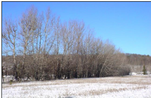
Figure 7 Humboldt Hybrid Aspen Windbreak

from these trees replicate the superior disease resistance and hardiness of the parent in Michigan's northern climate. Working with the forester, CCMO began harvesting cuttings from these trees in the winter of 2003. Over two winters CCMO harvested approximately 20,000 hybrid aspens from Humboldt cuttings for establishment of the nurseries and planting on mine reclamation sites. Aspens planted in these nurseries from various sources are rapidly becoming an excellent source of cuttings for future mine reclamation. CCMO has found that even late July plantings develop adequate roots. One hybrid species had 100% mortality, emphasizing the importance of using test plots and selecting the proper hybrid species. Managing the nurseries provides a continuous supply of hybrid aspens from cuttings for use in future mine reclamation.