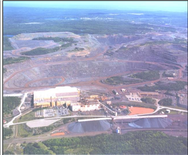
Figure 2 Michigan Operations West Facility