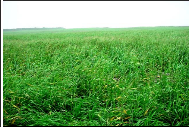
Figure 6 After: Final Vegetation