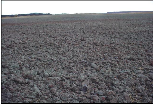
Figure 5 Before: Residuals Application