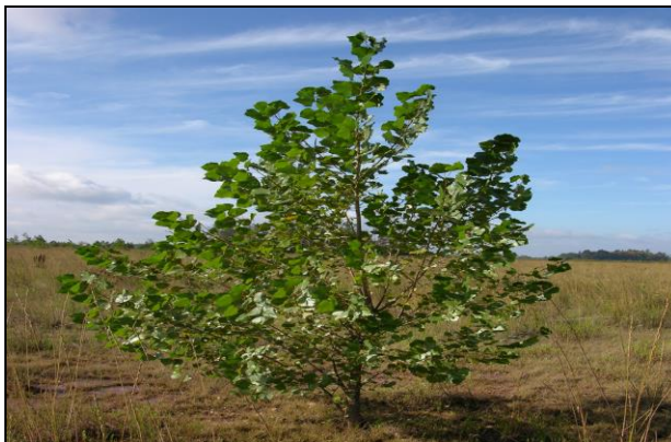
Figure 8 Hybrid Aspen in Nursery

CCMO continues to work closely with this forestry contractor who has a local greenhouse and grows seedlings from locally harvested seed. CCMO and the forester study reference communities on mine sites to determine what species have the highest survivability. Seedlings from these species are then grown in the greenhouse for Michigan Operations reclamation sites. Numerous innovative and cost-effective ideas have resulted from this partnership.