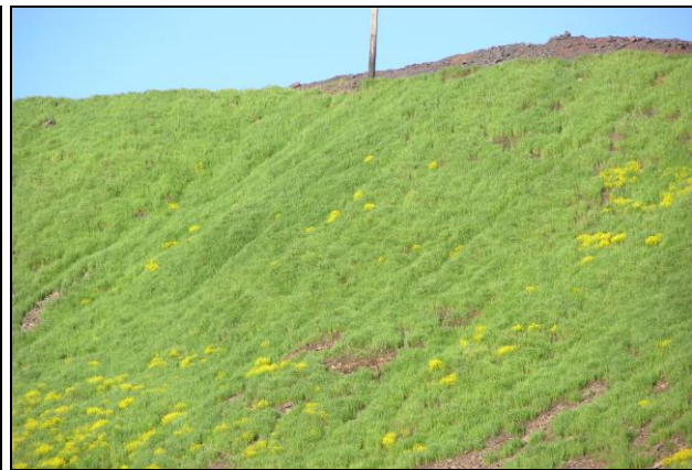
Figure 4 Final Stockpile Slope