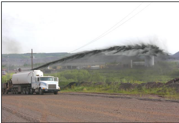
Figure 3 Applying Biosolids

The biosolids produced at MAWTF meet USEPA (United States Environmental Protection Agency) and MDEQ “Class B” pollutant ceiling concentrations, Class B requirements for pathogens, and vector attraction reduction requirements. The USEPA Part 503 Biosolids Regulations that govern general treatment requirements, pollutant limits, management practices, operational standards, requirements for frequency of monitoring, record keeping, and reporting are strictly followed.