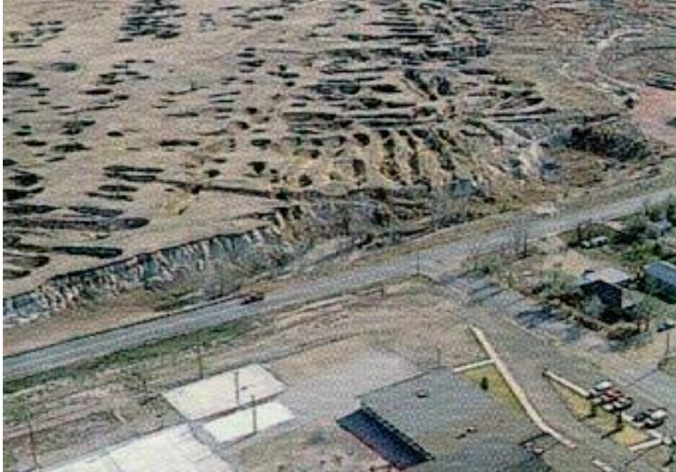
Figure 6 Scranton, ND

Similar fields are rare in the Appalachian coalfields and most sinkholes are isolated events which AML workers deal with individually. As background to her research, Dyne (1998) provides an excellent treatment of several workers' findings pertinent to chimney caves and similar shallow subsidences. She addresses type of collapse, time since mining, depth of overburden, and other factors responsible for the formation of these subsidence effects. Dyne found that many decades can pass between mining and the actual subsidence event. The "egg-crate" type of subsidence introduced here formed under much shallower cover during a mining era that is long gone. Unlike the better-known shallow subsidences, egg-crate formation is widespread over the shallow works and may have been penecontemporaneous with first mining and certainly formed within a few years after mining. Because subsidence is essentially total and the land surface is stable, egg-crated areas have not been included in the AML inventory.