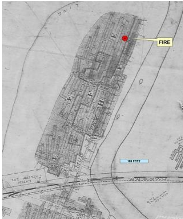
Figure 1 1914 Mine map.

In 2006, background work on a Pittsburgh coal mine fire required georeferencing a 1914 map of the Lynn Station Mine (Fig. 1) to a 1938 aerial photograph (Fig. 2). During the process, a striking geometric light/dark pattern in the photo was observed to clearly coincide with old workings in the affected section of the mine.