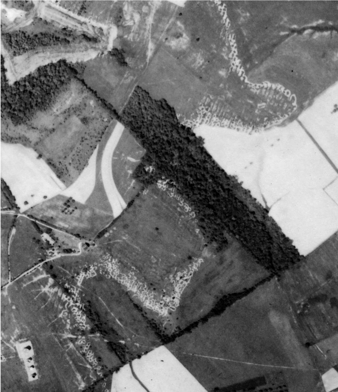
Figure 7 Shallow subsidence patterns near Delmont, PA (north to top).

Pattern variations in this photograph illustrate a wide range of shallow subsidence features. The spots on the photograph are evidence of subsidence that appear as: (1) sinkholes in the southwest and center, (2) probable egg-crate patterns, and (3) subtle linear troughs in the northeast center inside the cropline. Light colors adjacent the spots may be bare soil but are more likely water-stressed vegetation. The band's width varies with slope, narrow on steep slopes and wider on gentler slopes. Finally, the band is completely hidden by the canopy of the woodlot near the center.