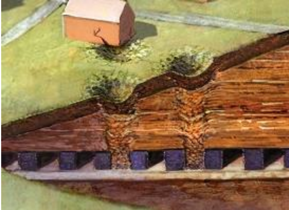
Figure 4 Sinkhole subsidence (excerpt from www.pamsi.org poster).