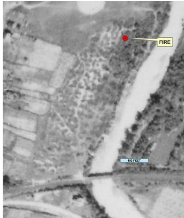
Figure 2 1938 Aerial photograph.

The site's surface consists of 3- to 8-foot hummocks on about 20-foot centers and looks very much like a snow skier's mogul field or a foam "egg-crate" mattress pad. Trenches dug to access the fire revealed that mining was advance only and conducted under less than 15 feet of cover consisting of weathered shale, alluvium, and soil (Fig. 3). Some entries were open but roof collapse had filled crosscuts.