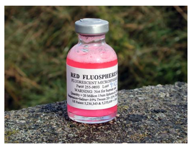
Figure 3. Bottle of 15µm microspheres used as a tracer for mine water investigations.