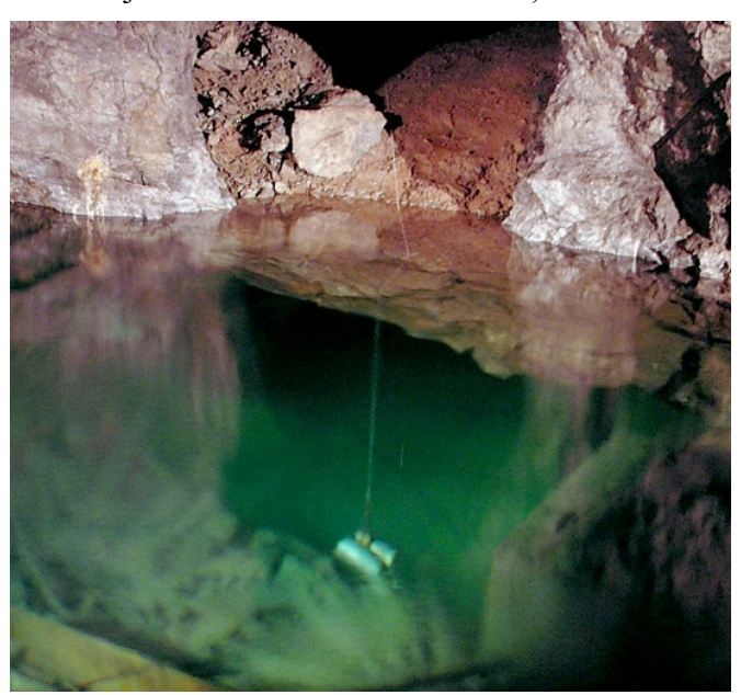
Figure 1. Felsendome Rabenstein/Germany tracer test with the open tracer probe hanging above the flooded inline drift to the 3<sup>rd</sup> and 4<sup>th</sup> working levels. The green cloudily colour comes from the Na-fluorescein (250 g)

During the past decade the author has conducted nine tracer tests in abandoned and flooded underground mines with the aim of improving the tracer techniques for underground mines and to understand the hydrodynamic regime of such hydrogeological systems (Wolkersdorfer 2002; Wolkersdorfer 2005b; Wolkersdorfer et al. 2002a). It became clear that from a hydrodynamic point of view there are two different types of mines. The first type can be considered the multiple-shaft mines (MSM) and the second, single-shaft mines (SSM); however, as will become clear, these designations do not necessarily mean, that more than two or really just one shaft exists (Fig. 1). Because mines usually have a limited number of discharge points or pump sumps, the flow direction of the tracer is usually known before a mine water tracer test is conducted (yet, in the case of the Straßberg/Harz tracer test the mine operator thought the tracer would flow into another direction, but because all potential discharge points were included in the sampling programme, all the injected tracers could be found).