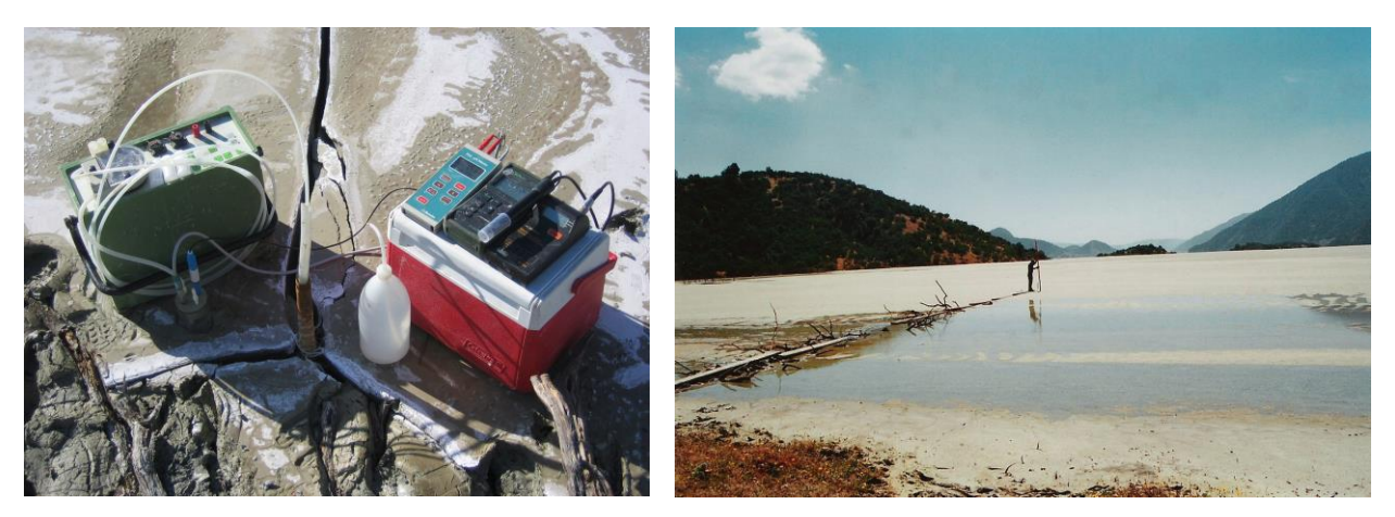
Figure 2: Sampling at point TL-26; water sampling by drive-point piezometer with measurement of pH and Eh (left picture) and sampling of tailings by a hand-corer (right picture).

Drive-point piezometer were installed at six sampling points (TL-10 – TL-28, Fig. 1) in the tailings impoundment to sample water to 4 m depth (Fig. 2, left). Tailings samples were taken at these sampling points up to 2.5 m depth (Fig. 2, right). Eh, pH, alkalinity, Fe(II)-concentrations of water samples, and sample colour, texture and paste-pH of tailings samples were measured immediately.