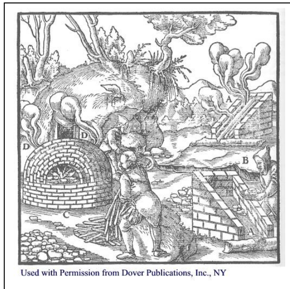
Figure 3 – Roasting circa 1540

Roasting temperature can have a significant effect on metal recovery; Guay (in Schlitt, et al., 1981) reported that Au liberation in carbonaceous Carlin ores was the best in the range between 500 and 550°C. In the past, roasting has typically been used to pre-condition hard ores for crushing and/or oxidizing sulfides to oxides in preparation for smelting. In the SRBR substrate processing situation, it would be applied to reduce the organic content (where the metals are bound); sulfide oxidation would also occur.