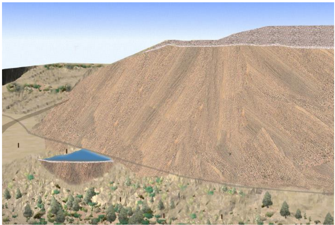
Figure 3. Unreclaimed stockpile at angle of repose.