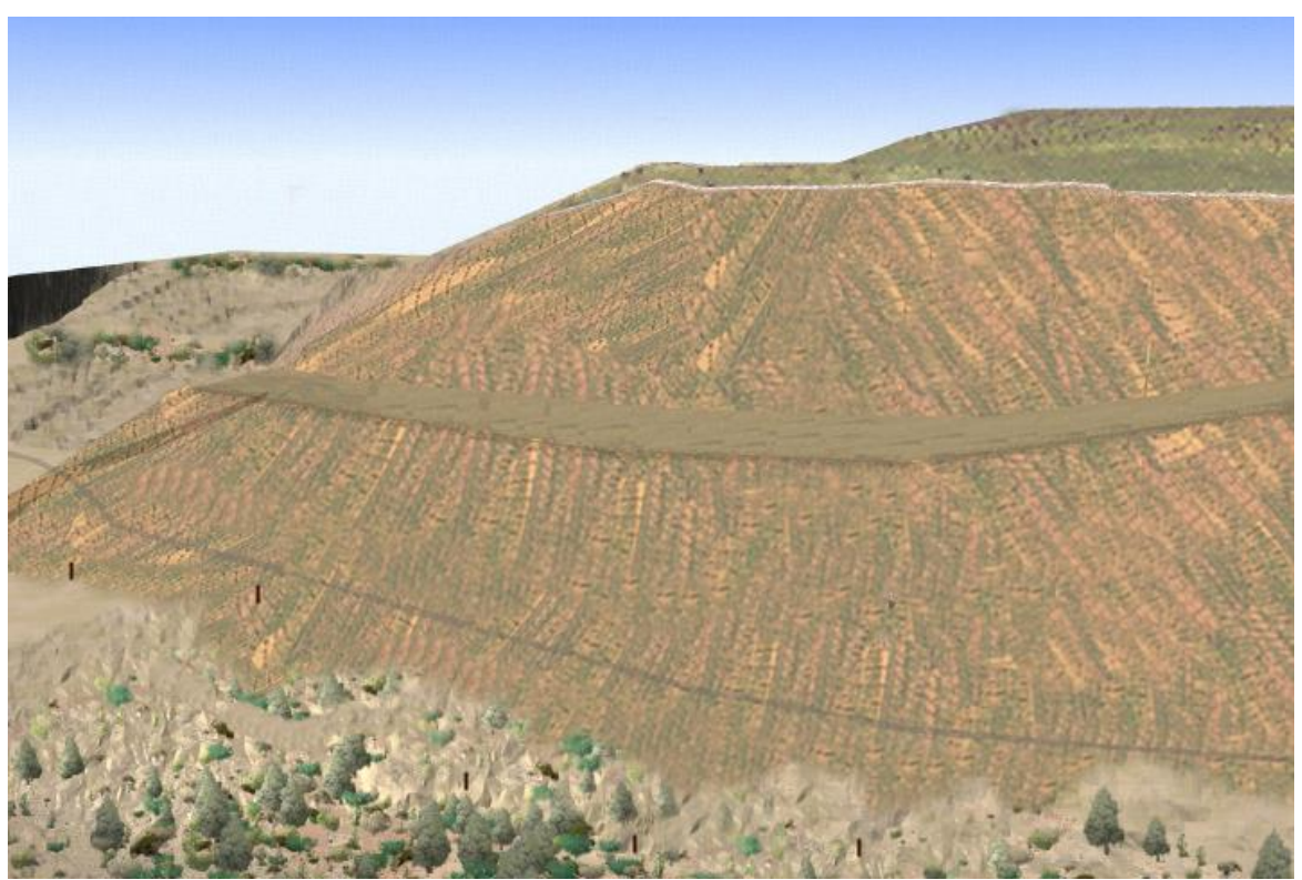
Figure 4. Reclaimed stockpile at 4:1 with expanded footprint.