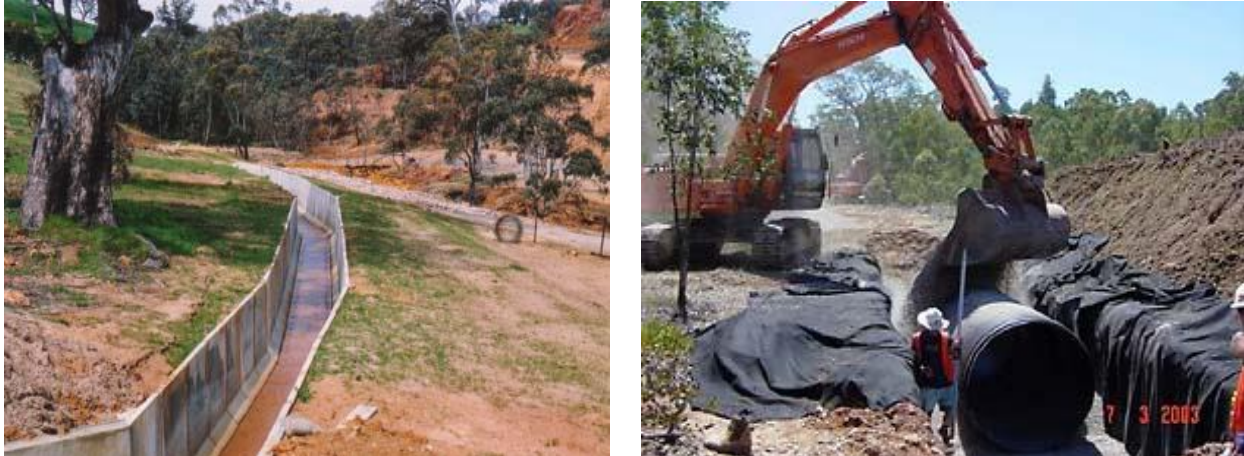
Figure 2. Dawesley Creek diversion drain. Laying pipe for the underground segments of the drain (right) and open channels (left).

In June 2003, Stage 1 of the program, construction of the Dawesley Creek diversion, was successfully completed. The diversion isolates Dawesley Creek from the pollution generated at the mine site. The 1.7 km diversion includes 780 metres of 1.5 metre diameter reinforced concrete pipes, 175 metres of High-Density Polyethylene (HDPE) plastic pipe and 750 metres of drilled and blasted open channel (Fig. 2). The original section of creek, adjacent to the waste rock piles, now provides a sink for the collection of acid drainage that previously flowed directly into the creek. Construction of the drain resulted in an immediate improvement in water quality in Dawesley Creek downstream of the mine for the first time in 50 years.