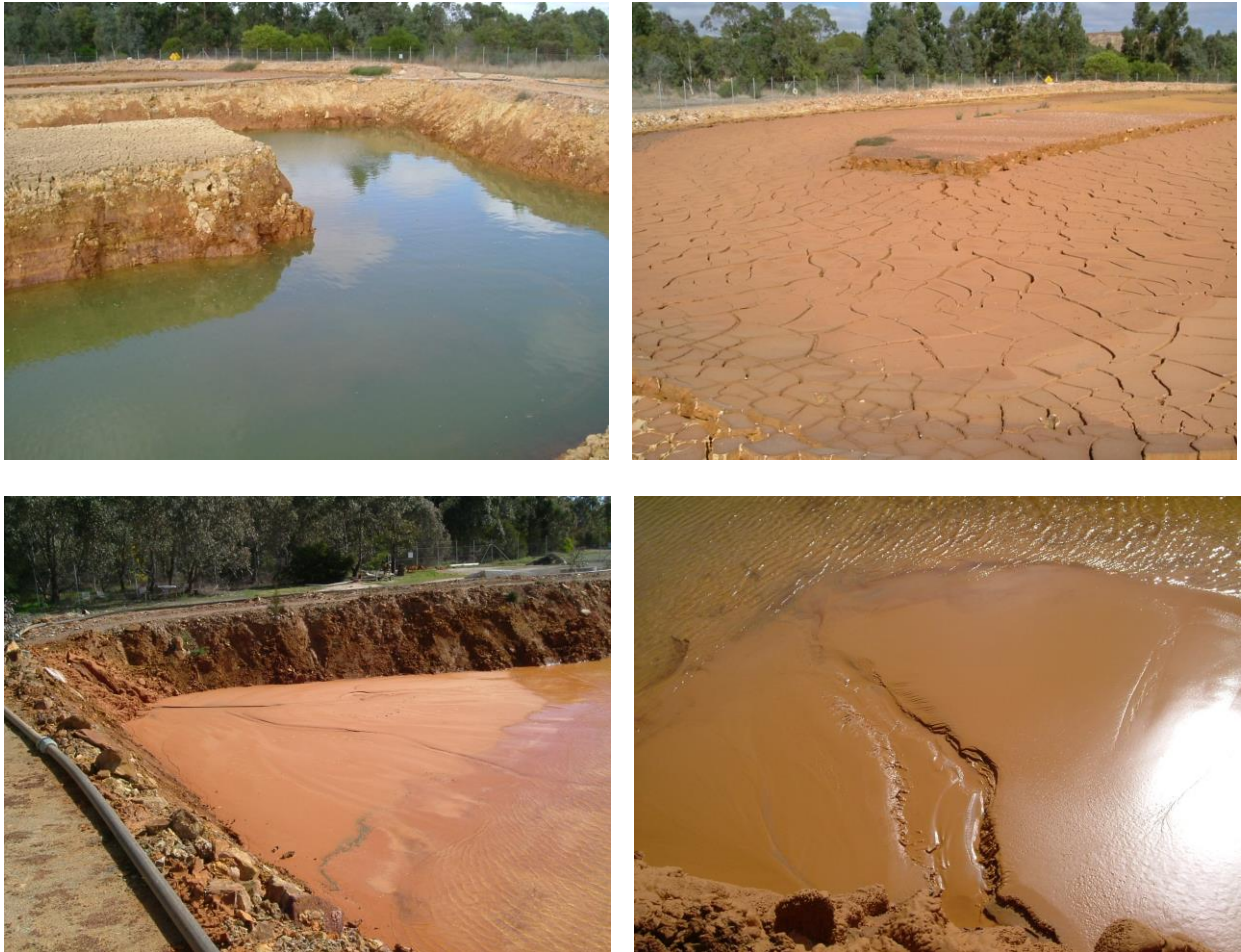
Figure 8. Sludge pond. Low-density sludge prior to plant upgrade partly fills one of the two sludge ponds (upper left). Sludge pond full of partially air dried sludge prior to desludging (upper right). High-density sludge entering the sludge pond after plant upgrade (lower left and right).

annually to every 2-3 years. This represents an estimated cost saving of between 50 and 66% on dislodging costs alone.