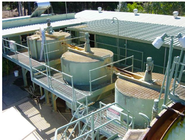
Figure 4. Reactors 1, 2 and 3 as viewed from the thickener tank (existing plant).