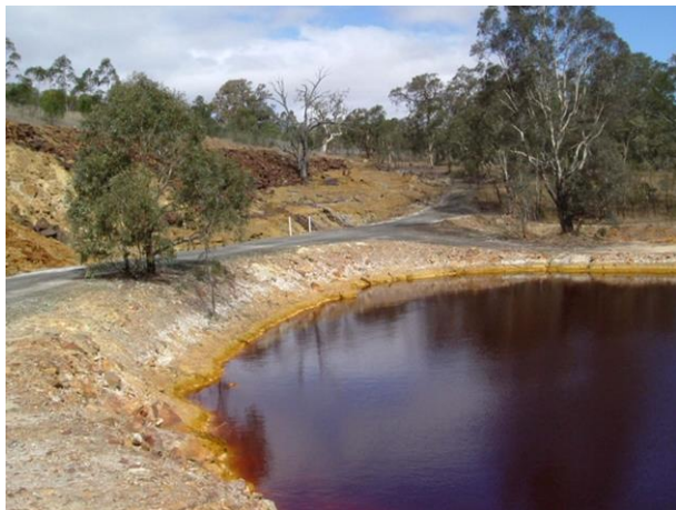
Figure 3. Acid drainage from the site is pumped to the North AMD holding pond (shown) prior to treatment.

Carbide lime slurry is mixed in a 50 kL below ground tank (Fig. 5), and dispensed to Reactor 1 as required to achieve a pH of approximately 9.5 in water exiting the plant. The carbide lime is a form of hydrated lime that is a by-product of the acetylene manufacturing process. The reagent therefore contains minor impurities (eg. \text{CaC}_2 ) that is not present in conventional hydrated lime. Carbide lime slurry is delivered to the site by road tanker 3 days a week. Excess slurry is stored in an evaporation pond to the west of the plant. Partially-dried carbide lime from the evaporation pond is transferred to one of two above-ground temporary storage areas. When required, the partially-dried carbide lime is added (with water) to the 50 kL below ground lime slurry tank. Annual consumption of reagent is variable but averages approximately 600 dry tonnes per annum.