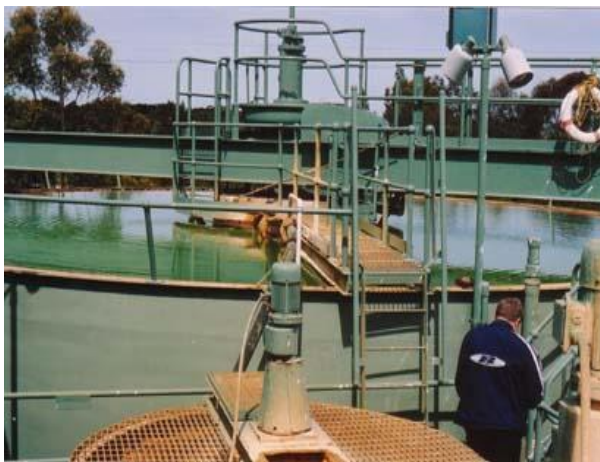
Figure 6. Thickener / clarifier tank.

Settled sludge in the base of the thickener / clarifier tank is either recycled into Reactor 2 or pumped to one of two sludge ponds located on the tailings facility. The low-density sludge exiting the plant prior to its upgrade was between 3 and 5 wt% solids.