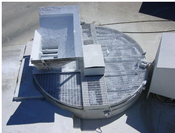
Figure 5. Below ground hydrated lime storage, mixing and dosing system.

Water from Reactor 1 flows by gravity to Reactor 2 and (subsequently) to Reactor 3. The use of three reactor vessels provides the retention time required for the completion of the treatment reactions. Water exiting Reactor 3 then flows into a below ground sump. When the sump is full, water is pumped up to a 390 kL thickener / clarifier tank. Flocculent is dispensed into the stream of water from the below ground sump before it enters the thickener / clarifier tank (Fig. 6). Clear supernatant water from the thickener / clarifier tank overflows to a clarification pond before being released into Dawesley Creek, downstream of the mine site.