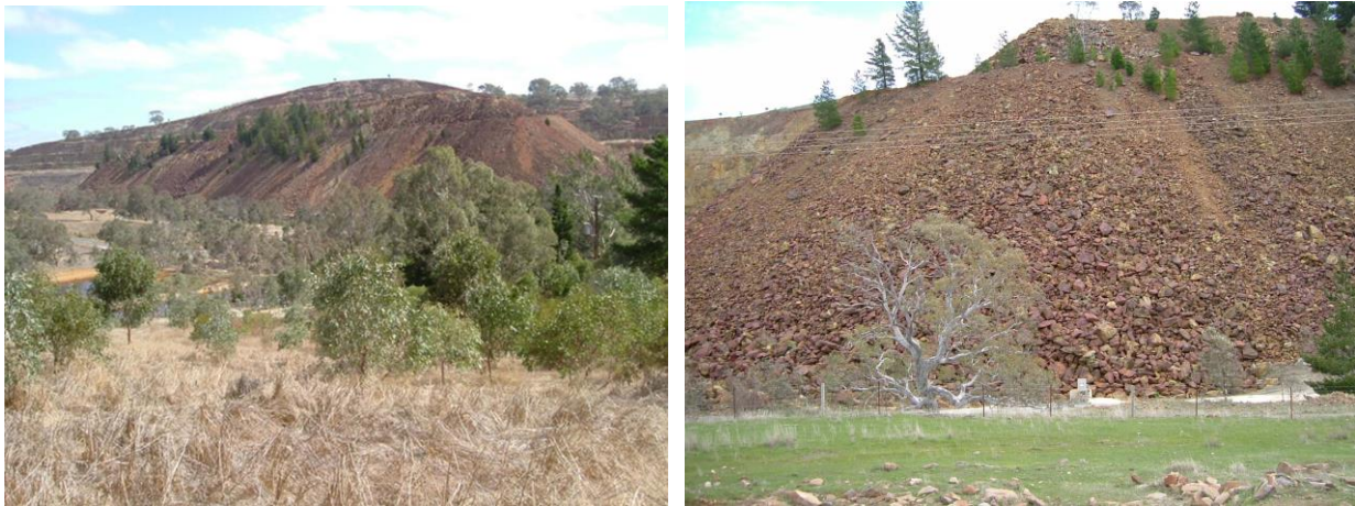
Figure 9. Waste rock piles at the Brukunga site, to be rehabilitated during Phase 3 of the remediation program.

The third stage in the rehabilitation works at the Brukunga site involves the reduction of acid generation and seepage on site. The key to this will be the rehabilitation of the waste rock piles on site. Currently waste rock piles are located along the base of the open cut bench and have not been capped. This allows uncontrolled infiltration of water into the piles, and results in seepage of acidic drainage generated within the piles (Fig. 9).