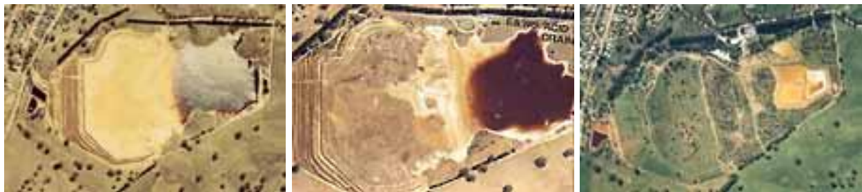
Figure 9. Aerial view of the progressive rehabilitation of the tailings storage facility. Far left: 1973, 12 months after closure of the site. Middle: 1985, remaining acid water on tailings facility after initiation of treatment in 1980. Right: 1997, revegetated surface of the tailings facility.

A great deal of the success of the revegetation program was due to the use of ‘biosolids’ from the annual clean out of Waste Water Treatment Plants and from daily truckloads of wet sludge cleared from local domestic septic tanks. The biosolids were spread thinly over the tailings facility surface, contributing to increasing soil cover and providing moisture, nutrients and bacteria necessary to invigorate healthy plant growth.