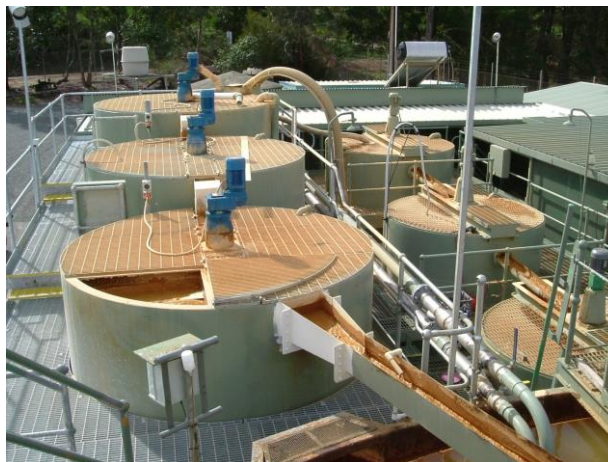
Figure 7. New treatment plant showing second parallel series of reaction vessels (upper left) with existing upgraded plant (lower right).

In May 2005, a second parallel series of 3 larger reaction vessels was installed to effectively double the treatment capacity of the plant (Fig. 7). This new plant also operates in HDS mode and has a design capacity of 25 kL/hour. The installation of the new plant and upgrade to the existing plant was completed at a cost of $750,000 (AUD). Improvements in sludge density and settling characteristics enabled the existing thickener to accommodate the sludge output of both plants.