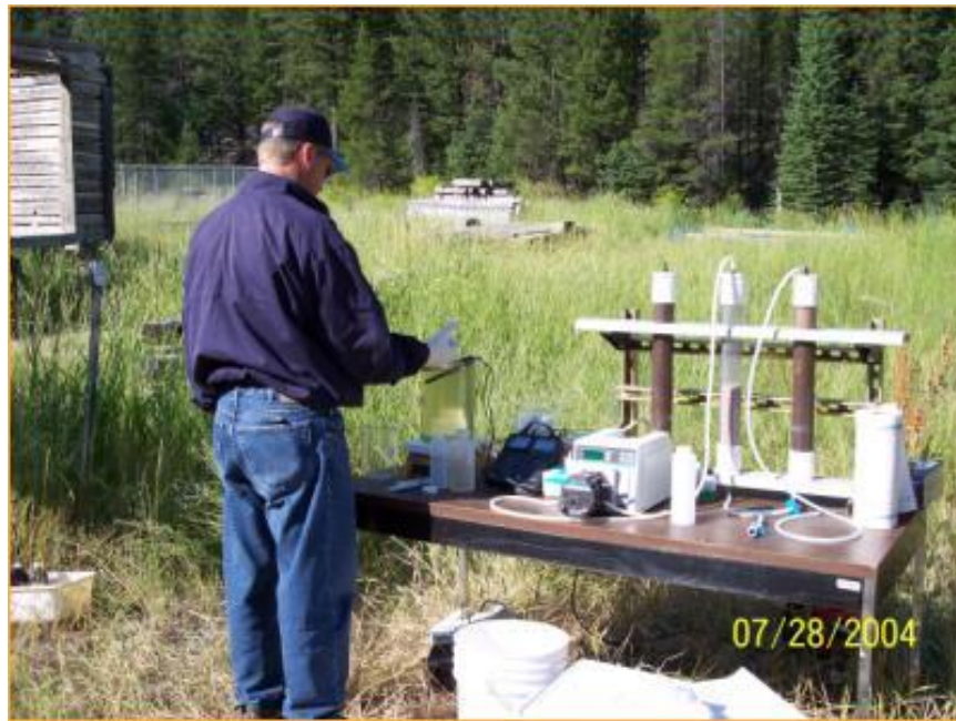
Figure 3. Arsenic Treatability Studies at Susie Mine, Ten Mile Creek, Rimini, Montana

Both aforementioned projects are being performed with EPA Region 8, Montana Department of Environmental Quality, and Camp Dresser & McKee (CDM). Figure 3 is a photograph of treatability studies at the Susie Mine.