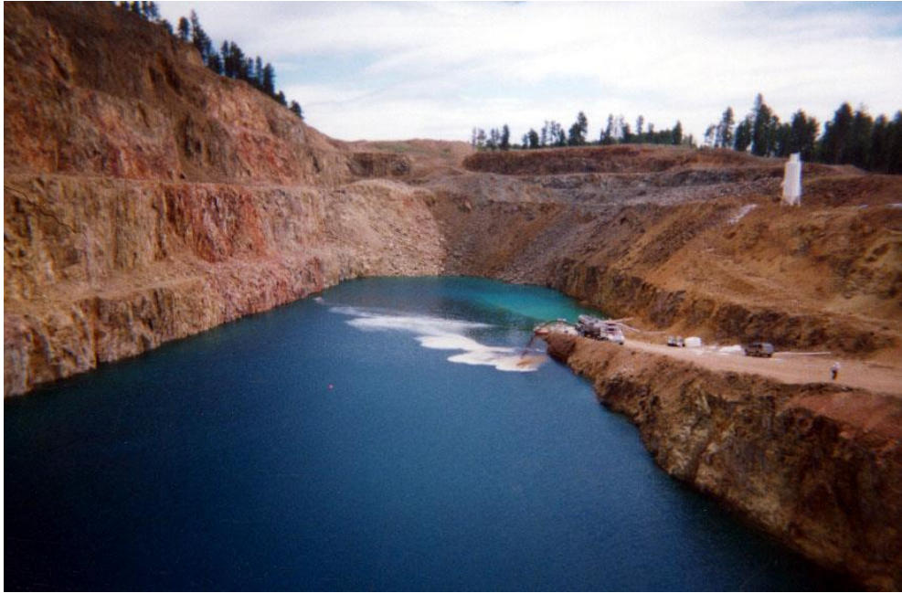
Figure 5. Molasses addition to Anchor Hill Pit, Gilt Edge Mine South Dakota