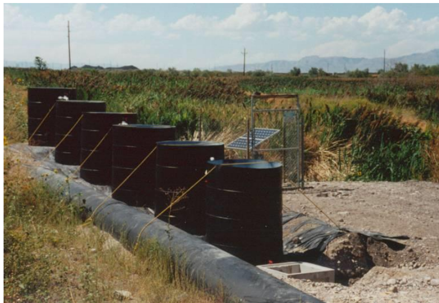
Figure 4. BSeR system at Kessler Springs Site at Kennecott Utah Copper Corporation.

Two innovative technologies as well as ferrihydrite precipitation--the Best Demonstrated Available Technology (BDAT)--were evaluated. The influent water used for the demonstration was the Garfield Wetlands-Kessler Springs ground water containing approximately 2000 \Phi\text{g/L} selenium. The primary objective was to reduce the concentration of dissolved selenium in the effluent waters to a level under the National Primary Drinking Water Regulation Limit for selenium of 50 \Phi\text{g/L} established by EPA (CFR, 2002). All three technologies removed selenium to below the project objective of 50 \Phi\text{g/L} under optimum conditions. The biological selenium reduction (BSeR™) technology developed by Applied Biosciences of Salt Lake City, Utah, was the most consistent process tested, with the majority of results less than the detection limit for selenium of 2 \Phi\text{g/L} . This technology was selected as the preferred treatment in the Record of Decision for this Superfund site. (Joyce et al., 2001). Fig. 4 is a photograph of the BSeR technology at the KUCC demonstration site.