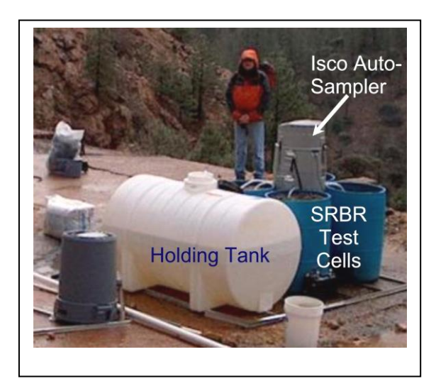
Figure 2. Bench test cell setup

• the autosampler was programmed to deliver a slug of about four liters of ARD from a 350-gallon holding tank to each test cell every six hours (four slug deliveries per day).