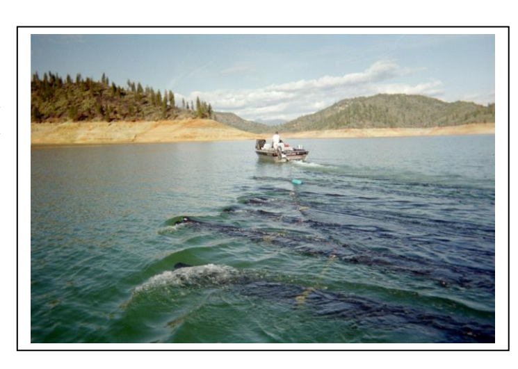
Figure 8. Transport of 6-inch HDPE pipe across Lake Shasta

The initial performance results of the pilot system were quite favorable; over 99 percent removal of heavy metal loading with a circumneutral discharge pH were achieved within about a month after startup in July, 2004. In November, 2004, the small scale pipeline delivery system was replaced with a buried 6inch (150 mm) diameter HDPE pipeline that will service the full-scale passive treatment system to be constructed at a future date. In the five months that the small scale delivery pipeline was used (July to November, 2004), the only maintenance problem of consequence was damage from local wildlife. Inquisitive black bears bit into the exposed pipe, leaving small punctures that required occasional repair.