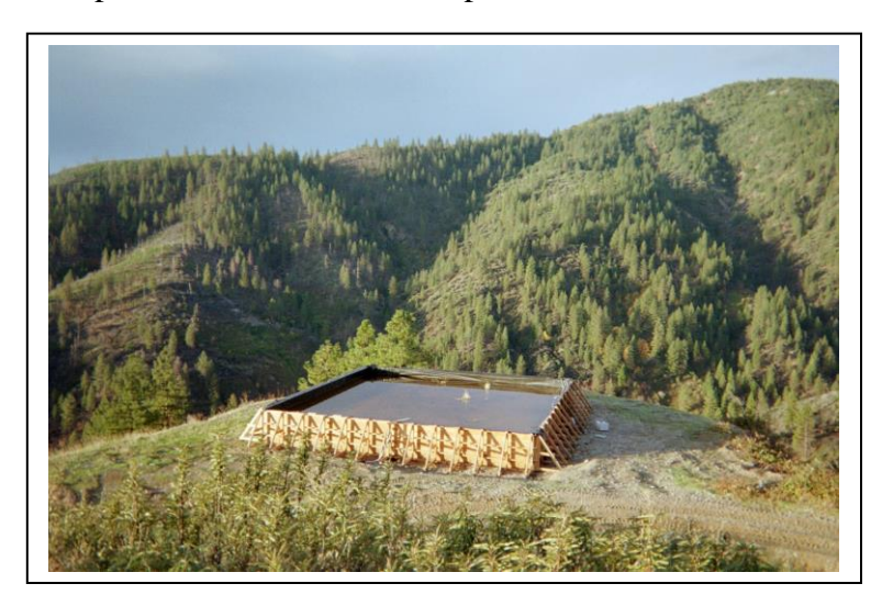
Figure 7. Finished SRBR pilot test cell

Engineering calculations that assume ideal conditions and field reality sometimes do not agree. The installed pipeline profile had many places where air-lock conditions prevailed. In order to develop sufficient pressure to overcome these multiple restrictions, the intermediate head tank was removed from the system