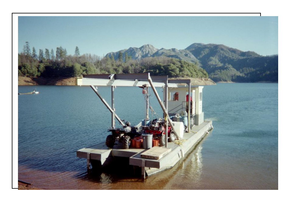
Figure 3. Barge loaded with bench test materials and equipment

The results of the bench scale test showed that nearly all the organic substrate recipes behaved about the same with regard to metal removal and рН improvement. Thus, the final mixture (number 3) was primarily selected based on economics tempered with the "jump start" that was apparently provided by the rice hulls. Table 1 below provides the proportions used in the four bench cells with the recipe selected for the pilot cell shaded.