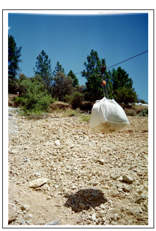
Figure 5. Highline in use

The bridle-tension line would pass through another pulley (anchored to the shore-side tower) and be attached to the 4x4 pickup truck which would provide the muscle to pull the supersacks from the LC to the top of highline. One drawback to the concept was that the highline system would need to