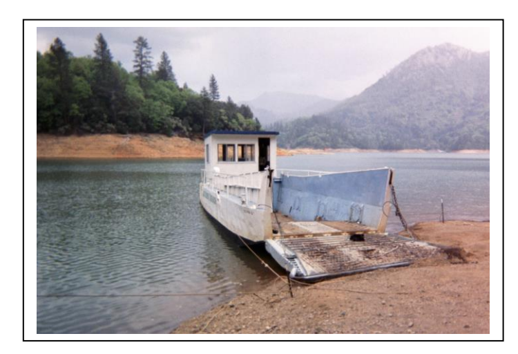
Figure 4. "Elsie" the landing craft from Shasta Lake Caverns

weather conditions. Fortunately, a local resort, Lake Shasta Caverns, maintained a World War II vintage landing craft (LC, Fig. 4) that was available for private rental at the bargain rate of US$75 per hour (operator included) plus fuel. The capacity of the LC was 14 short tons (12,730 kg). Theoretically, the substrate material could be transported across the lake in about three 4hour trips plus mobilization/demobilization time. The LC would also be used to transport the construction equipment (a small trackhoe, 4x4 pickup truck, two all-terrain vehicles) and other construction materials (prefabricated plywood panels that would comprise the walls of the pilot SRBR test cells, liners, and pipes). Helicopter transport of the equipment and material would not have been feasible in any case. The total