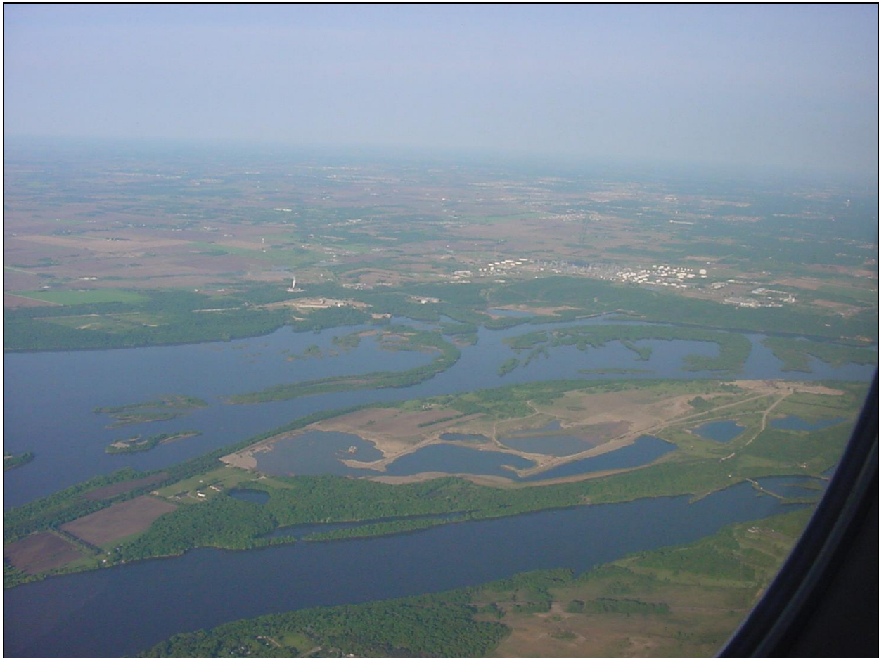
Figure 1. View of the Lower Grey Cloud Island, Minnesota along the Mississippi River, looking towards the southwest in the spring of 2003.

Over the first fifteen years of the stand, the patch expanded from about 0.11 acres to 0.58 acres in area; while the inner core of trees expanded slightly from 0.08 acres to 0.09 acres in size. The collective basal area of most tree species increased but was concentrated in fewer