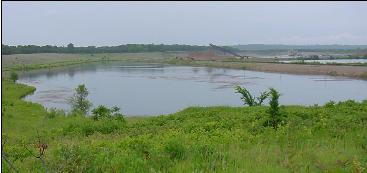
Figure 2. View looking west of the stand illustrating the composition and structure of naturalized Rhus sp. and emerging saplings surrounding the stand.

In contrast, many surviving edge trees have increased their basal area with some individuals growing more than 1.25 dbh cm per year. The box elder ( Acer negundo L.) trees decreased in the number of individual trees and saplings (dbh \geq 2.54 cm) (Table 1). Woody plant seedling recruitment including tree seedlings (Table 2) has occurred for northern red oak ( Quercus rubra L.), woodbine ( Parthenocissus quinquefolia (L.) Planch.), riverbank grape ( Vitis riparia Michx.), Eastern red cedar ( Juniperus virginiana L.), honeysuckle ( Lonicera sp.), grey dogwood ( Cornus recemosa Lam.), Norway maple ( Acer platanoides L.), northern prickly ash ( Zanthoxylum americanum Mill.), Salix sp. (willow), Rubus sp. (raspberry/blackberry), green ash ( Fraxinus pennsylvanica (Marsh.) and common hackberry ( Celtis occidentalis L.). A small stand of Kentucky Bluegrass ( Poa pratensis L.) has become less substantial (less area covered per square meter) within the inner core of the stand.