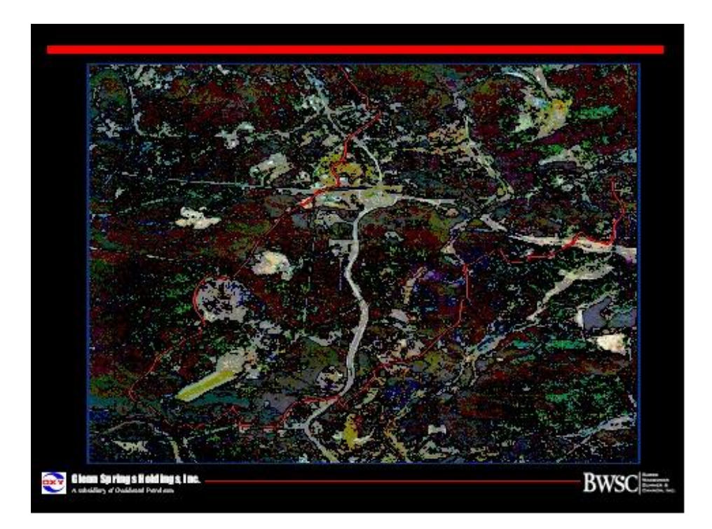
Figure 8. The Copper Basin Project Area Literature Cited