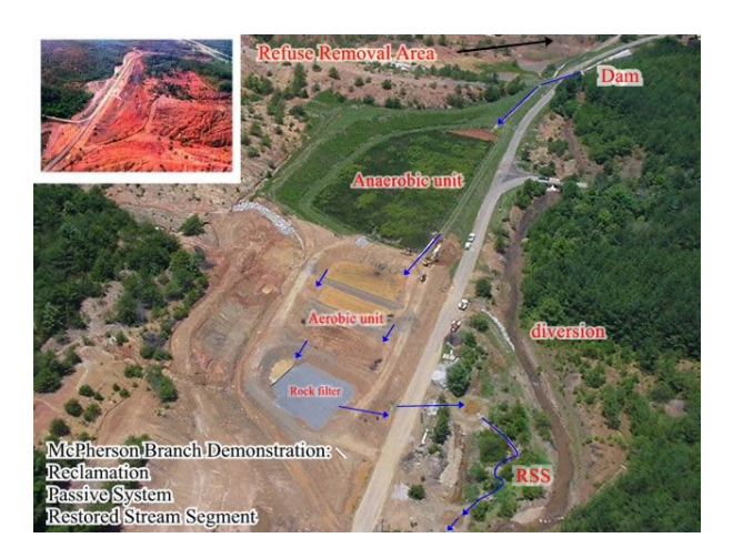
Figure 2. McPherson Demonstration

In 1998, GSHI constructed a demonstration passive wetland that captured water from McPherson Branch, a small (165 hectare / 410 acre) first-order watershed with a monoculture of pine growing on the eroded soils. Near its confluence with North Potato Creek, this stream exhibited low pH, moderate acidity, and elevated metals. Additionally, stream remediation was challenged by the high sediment load from the eroded areas upstream. Even paved roadways located well above the creek channel were regularly inundated and covered with sandy silt from the barren areas. The relatively low concentrations of metals and acidity indicated the drainage was a good candidate for passive treatment. Evidence of very high flows and obviously high sediment loads required an innovative approach to implementing passive treatment. This project was detailed in a 2002 ASMR presentation (Faulkner, 2002).