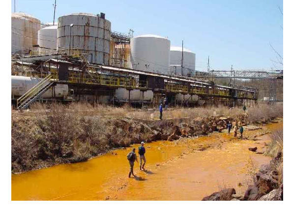
Figure 5. Removal of metals from Davis Mill Ck.