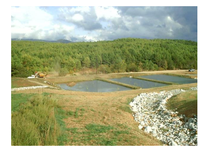
Figure 3. Aerobic Wetland

In that same year, GSHI removed a 7600 cubic meter (10,000 cubic yard) pile of mine waste proximate to McPherson Branch, and documented a rapid acceleration of the improvement in water quality in the branch that had been slowly occurring since the mines became idle decades ago (TDEC, 2002). Since October of 1998, the two-acre anaerobic passive treatment system has successfully routed base flow from McPherson Branch through the cattail dominated wetland, and by limestone dissolution and bacterial sulfate reduction has converted the acidic, metal-laden stream to an alkaline discharge with greatly reduced concentrations of problem metals. GSHI has recently completed an adjoining one-acre, three-cell aerobic wetland (Fig. 2 & 3) that