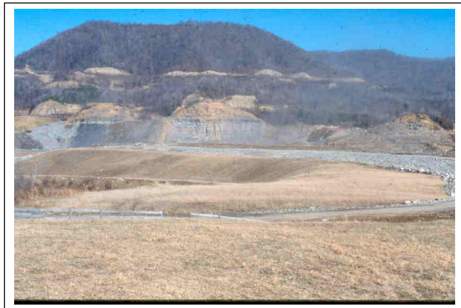
Figure 5. Mined landscape at Powell River Project area. Older pre-SMCRA