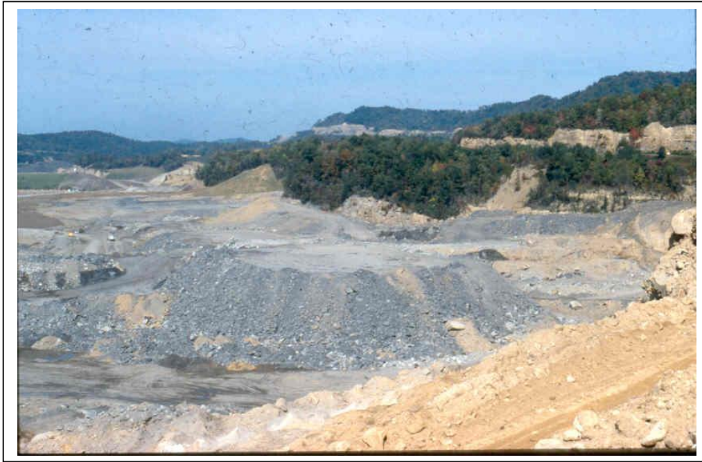
Figure 3. Active mining at Powell River Project area in early 1980's. Older pre-SMCRA highwalls can be seen in background. Deeper unoxidized strata generate the gray spoils seen in the middle of the picture while pre-weathered oxidized strata generate the brown spoils with more acidic reaction and lower rock fragment content. This area also corresponds to the inset area shown in Figs. 1 and 2.