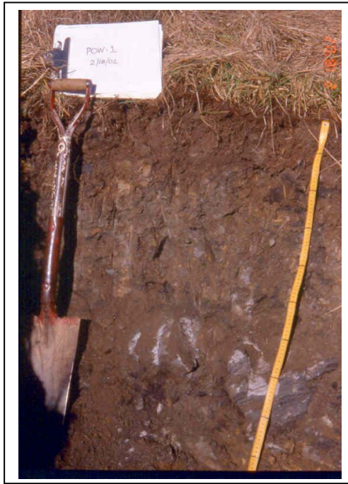
Figure 4. Profile of proposed series 1 described in 2002. This pedon is < 18% clay and formed from mixed spoil types.

composition of stoniness, depth, and rock-type-criteria. However, no units were combined to permit a range of more than two classes within one criterion.