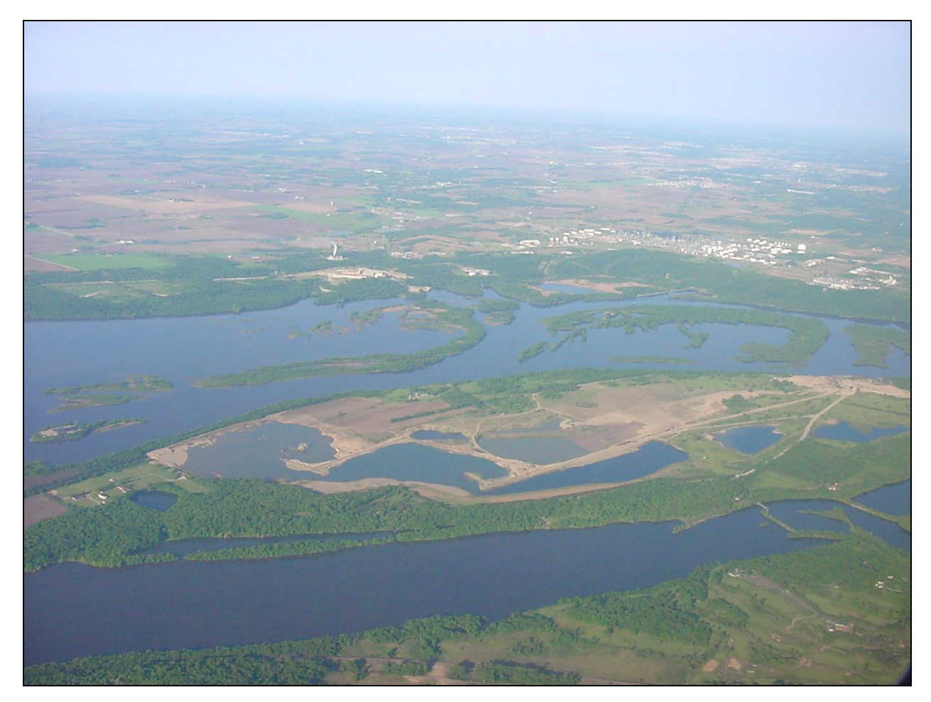
Figure 1. Lower Grey Cloud Island, Minnesota along the Mississippi River, looking southwest in the spring of 2003.

In 1998, we described a circular forest patch that we had established in 1983 on the Lower Grey Cloud Island, southeast of the Twin Cities (Minneapolis and St. Paul, Minnesota) (Burley et al. 1998). The forest patch has been installed on a large xeric mound of excess sand, one of many mounds created to provide suitable post-mining building sites above the 100 year floodplain of the Mississippi, River (Fig. 1). The surface mine is still in operation and supplies sand and gravel for road mixtures and concrete. The mine has been extensively studied (Sanders and Associates 1981) and is expected to complete mining operations in about 20 years (Sanders, Burley, and Churchward 1982). As mining operations continue, our study reports upon the developments within this forest patch since that initial 10 year report and publication.