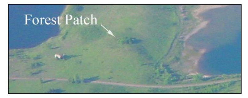
Figure 2 . Location of the forest patch on a mound of sand above the 100 year floodplain. The lakes typically are at the elevation of the Mississippi River.

Besides reducing mortality and being able to expand across the landscape, we also thought that the forest patch had another advantage over traditional planting approaches. We thought that the patch was highly visible as a clump of vegetation right from initial establishment, whereas in many cases traditional planting approaches, installed vegetation is almost invisible across an expansive herbaceous post-mining landscape (Fig. 2).