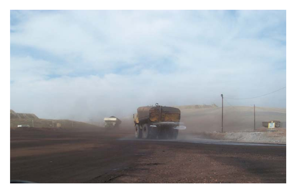
Figure 3: 166 m<sup>3</sup> Water Truck in Operation in Coal Hopper Area During Windy Day.

between 45.4 and 75.7 m<sup>3</sup>. Two fast fill loadouts are designed to load the single 166 m<sup>3</sup> water truck (Figure 3). In 2001, a significant effort was made to connect the water supply reservoirs with each other to allow sharing of water between the pits. Water may now be moved from the eastern portion of the mine to the middle and north portions, where there is more need for the water. Water can also be returned from the middle portion of the mine to the western portion of the mine. Sediment traps and small sediment ponds have also been constructed to protect the water supply reservoirs from excessive sedimentation in order to maintain capacity.