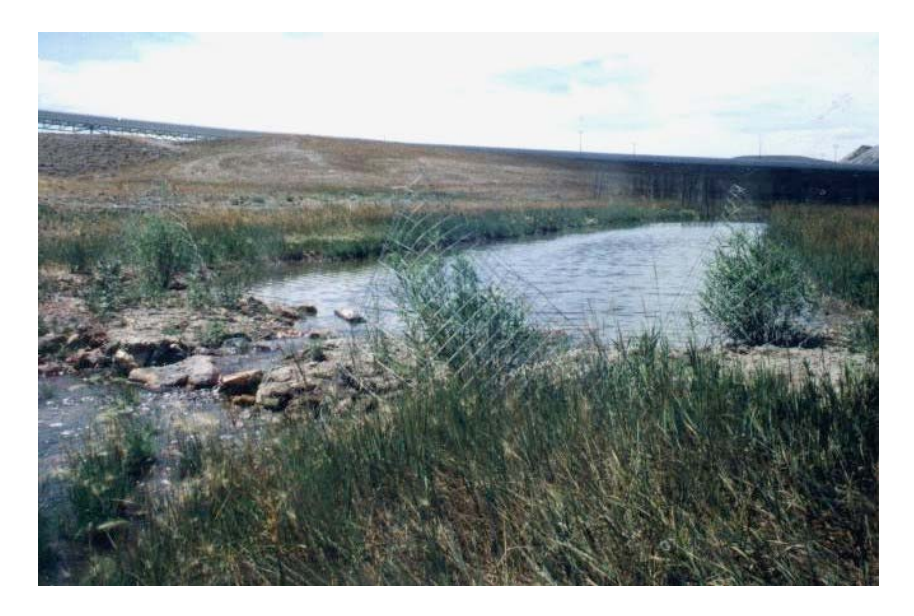
Figure 5: Pool and Counter-Weir Sequence on AVF Reach 1 with Caged Coyote Willow (Salix exigua) Plantings

Following construction of the pools and counter-weirs (Figure 5) on AVF Reach 1 for wetland replacement purposes in January 2002, reclaimed alluvial water levels have risen approximately 1 m. Boron concentrations spiked upward as water flushed through the unsaturated zone, but rapidly declined. Selenium concentrations also declined rapidly and currently range from <5 to 33 \mu g/l. It is expected that with water available to the lower reclaimed Porcupine Creek channel, ground water conditions can be kept consistently reducing and the fluctuations in alluvial water levels will decrease. It is also hoped that sulfate-reducing bacteria will proliferate in the more saturated environment, thereby reducing TDS concentrations. Sulfate-reducing bacteria were detected in all of the AVF Reach 1 monitoring wells in January 2003.