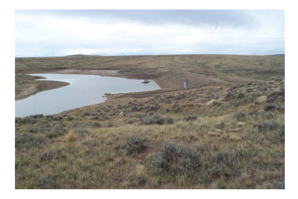
Figure 3: Coal Bed Methane Produced Water Stored in Flood Control Reservoir at North Antelope Rochelle Mine, September 2002.

North Antelope Rochelle has made agreements with coal bed methane producers upstream of the mine to handle produced water within the mine permit area. While concern has been raised that more CBM water will enter the mine than can be efficiently handled and that the mine will not be able to discharge the excess water within effluent limitations, the CBM producers will not be allowed to discharge more water to the mine than can be efficiently handled. Water produced from CBM operations must be discharged under all applicable state and federal permits. If more water is being produced from coal bed methane wells than the mine can process, other options for water discharge, including construction of upstream storage reservoirs, re-injection, or pumping around the mine, will have to be utilized by the CBM producers. Points of discharge are specified in the agreements between Powder River Coal Company and CBM producers. Wherever possible, discharges will be directly to major drainages to limit uptake of salts from soils.