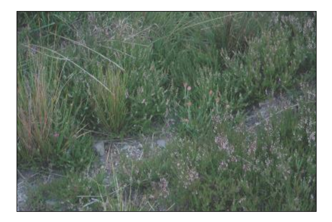
Figure 3. Re-created heathland from transferred heathland turf, fenced against sheep, three years after transfer. Here the most abundant ericoid is Calluna vulgaris ; there is some Erica tetralix (e.g. mid-field) and a heathland tussock grass, Carex echinata .

which explained the slow germination. Another experiment was set up subsequently using fresh seed heads stripped from the woody material and applied with a tackifier, and it is hoped that this procedure will overcome both dormancy and windblow effects.