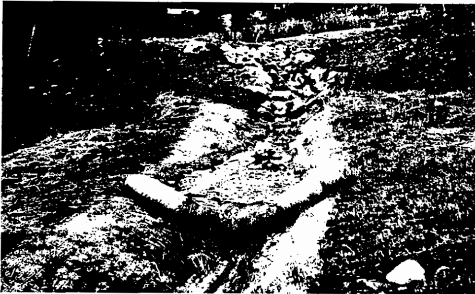
Figure 3. Fiber Wattle Installed as an Effective Check Dam and Sediment Trap in an Interceptor Ditch