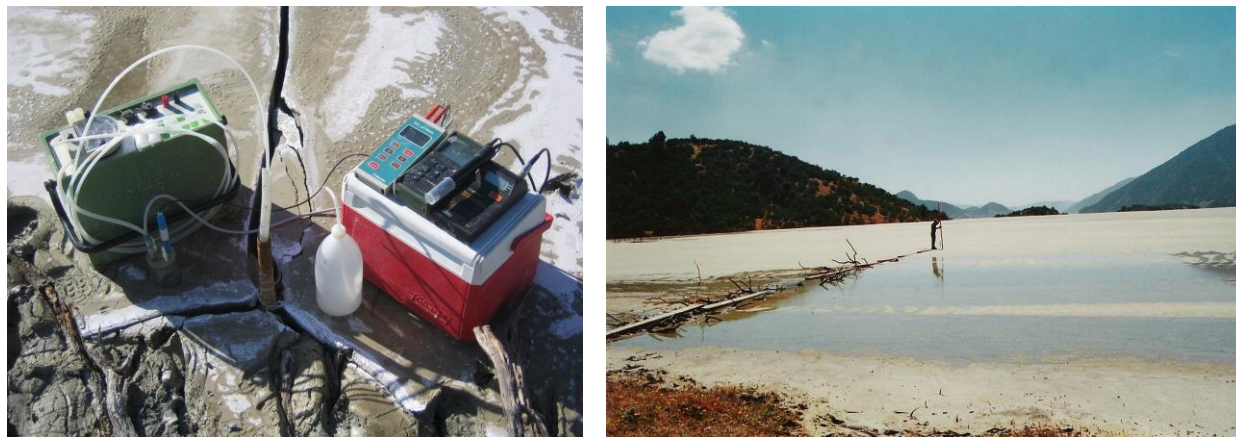
Figure 2: Sampling at point TL-26; water sampling by drive-point piezometer with measurement of pH and Eh (left picture) and sampling of tailings by a hand-corer (right picture).

Drive-point piezometer were installed at six sampling points (TL-10 – TL-28, Fig. 1) in the tailings impoundment to sample water to 4 m depth (Fig. 2, left). Tailings samples were taken at these sampling points up to 2.5 m depth (Fig. 2, right). Eh, pH, alkalinity, Fe(II)-concentrations of water samples, and sample colour, texture and paste-pH of tailings samples were measured immediately.